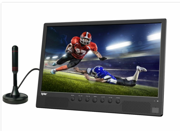
Figure 4.1: Front view of the Tyler TM710-14 portable TV, showing the screen, control buttons, and an attached antenna.