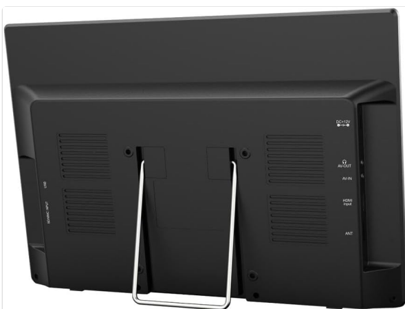
Figure 4.2: Rear view of the TV with the built-in stand extended, showing the DC 12V input, AV-OUT, AV-IN, HDMI input, and ANT input on the right side, and USB, SD/MMC input on the left.