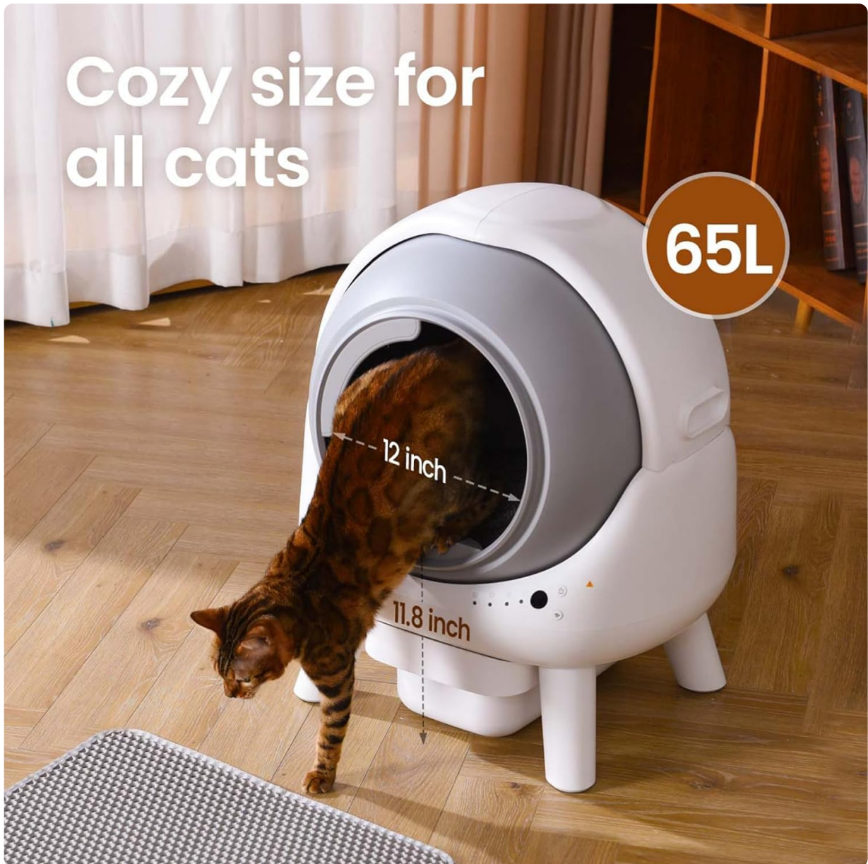
Image: The litter box with a cat exiting, illustrating the 12-inch opening and 11.8-inch height for comfortable use by cats.