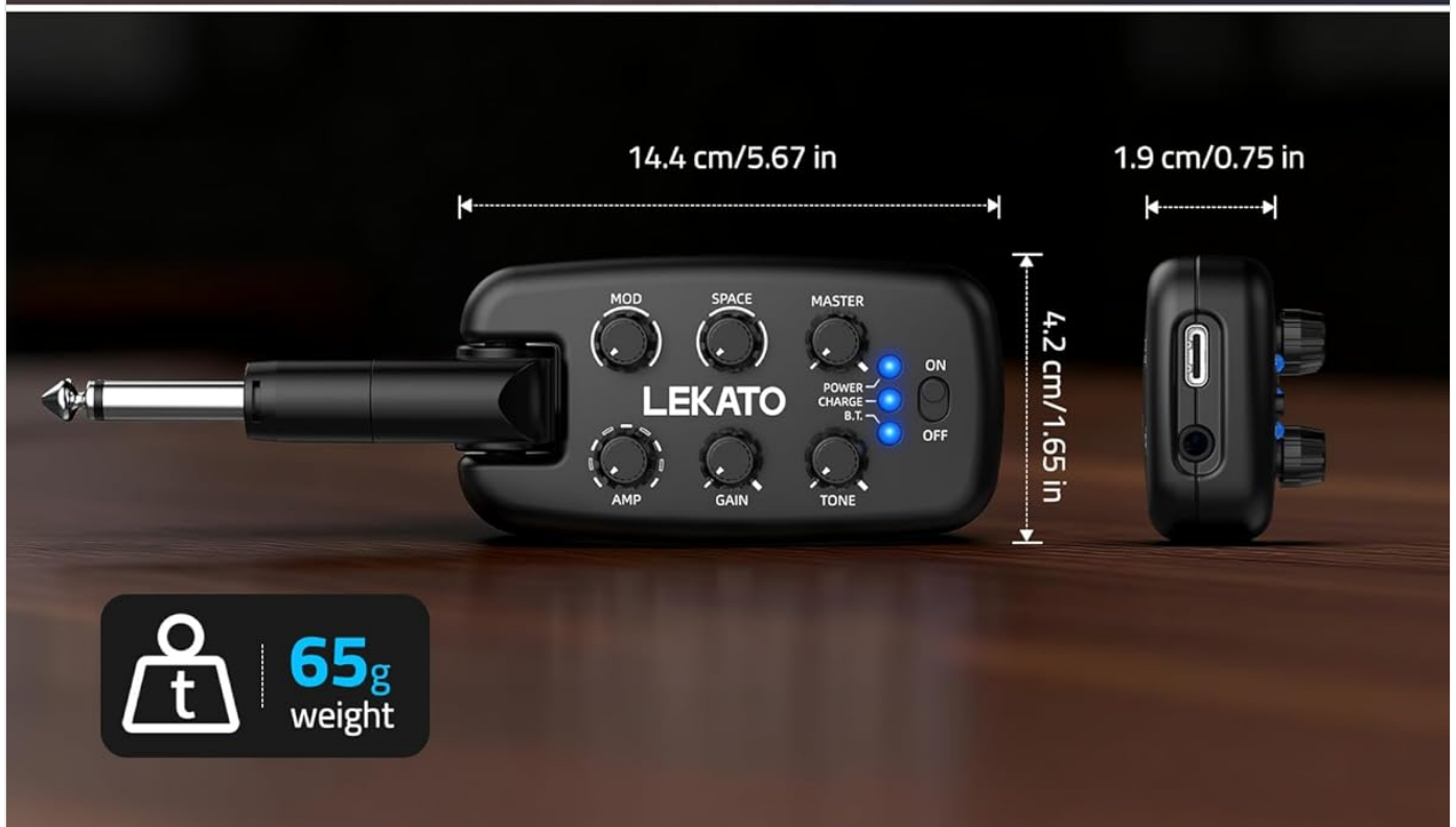
Image: Front view of the LEKATO PA-2 amplifier with labels pointing to the AMP, GAIN, TONE, MOD, SPACE, MASTER knobs, ON/OFF switch, POWER/CHARGE/B.T. indicators, charging port, and 3.5mm headphone output.