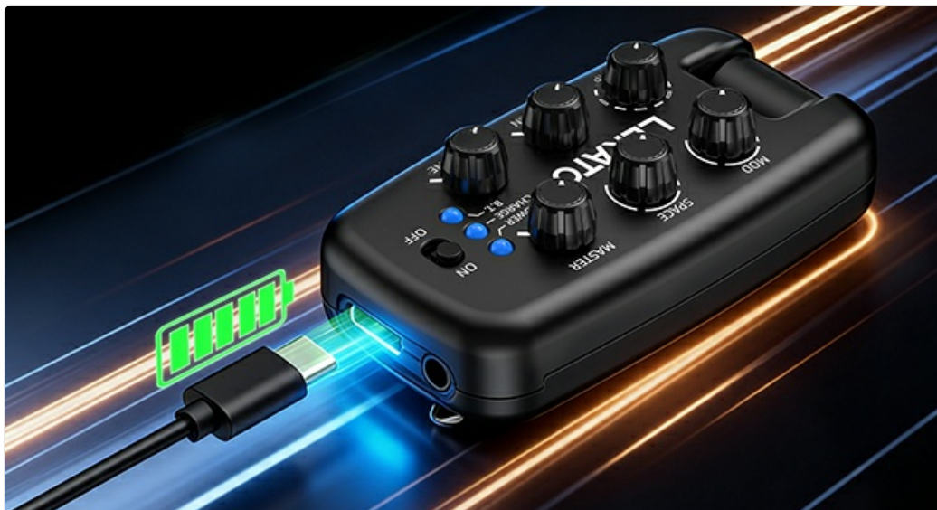
Image: The LEKATO PA-2 showing its USB-C port and 3.5mm headphone output, with headphones and an external speaker connected via the headphone jack.