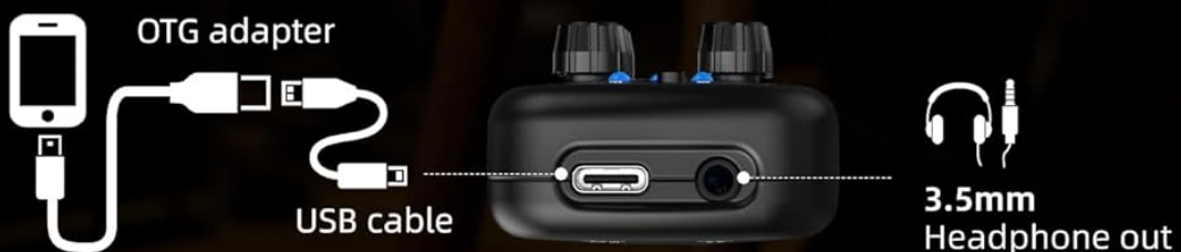
Image: A user playing an electric guitar with the LEKATO PA-2 connected to the guitar. An illustration shows the PA-2 connected via a USB cable and OTG adapter to a smartphone for recording.

Use a usb cable with an otg adapter (sold separately) to record or play audio on your smartphone.