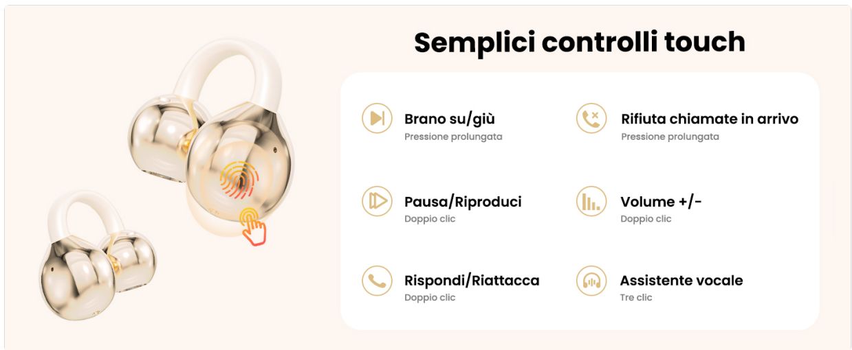
An illustration detailing the touch control functions for managing music playback, calls, and voice assistant.