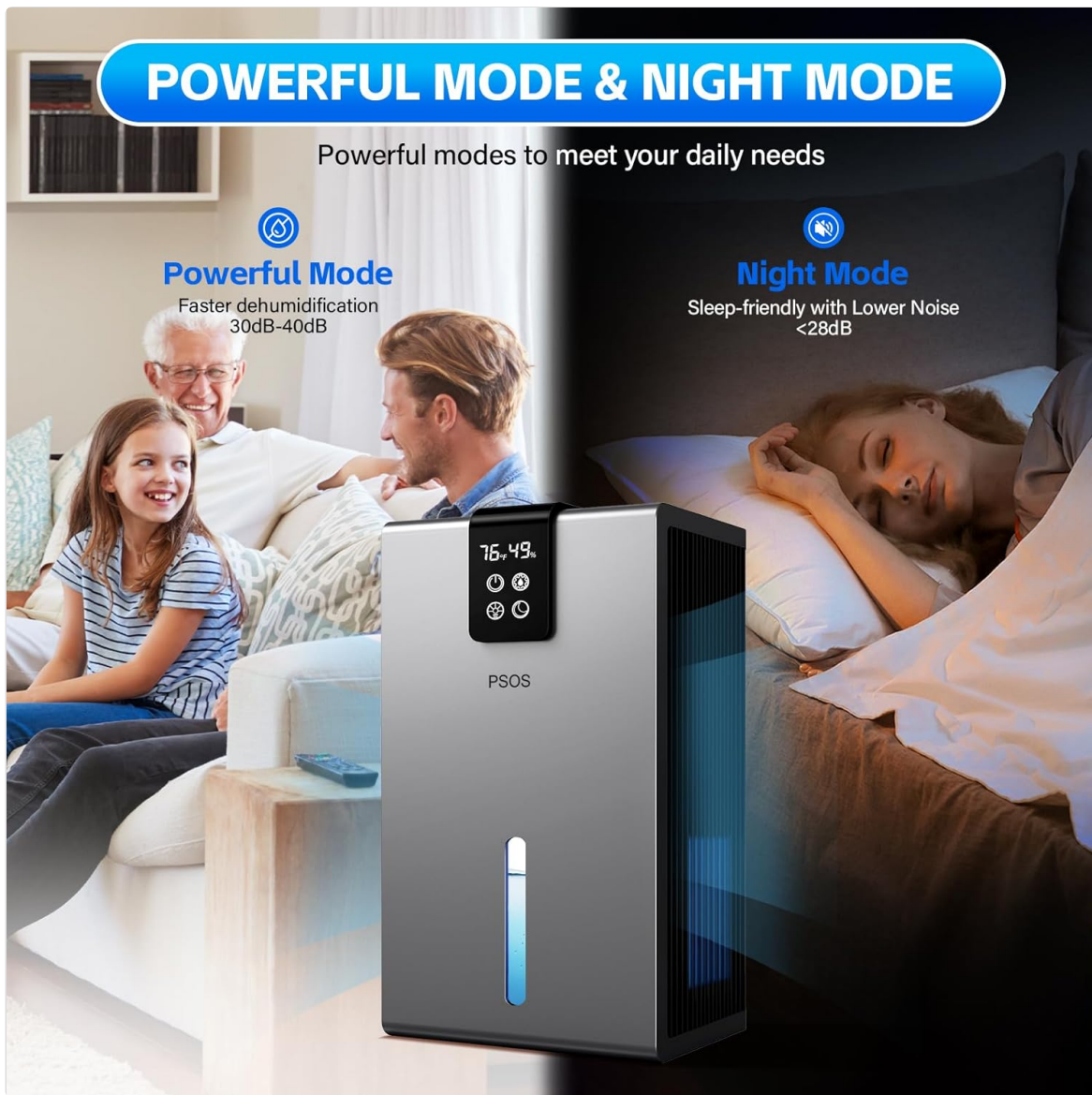
Figure 4.2: The dehumidifier features an ultra-quiet operation and a 7-color ambient light, enhancing comfort during nighttime use.