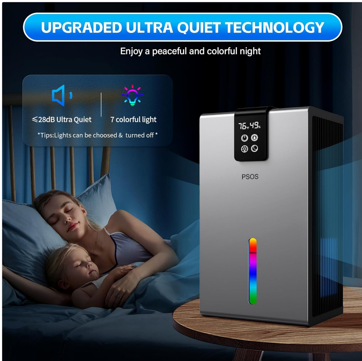
Figure 4.1: Illustration of the Powerful Mode for faster dehumidification and Night Mode for quiet operation.