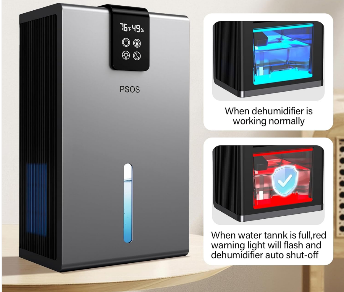
Figure 5.1: The dehumidifier's auto shut-off feature activates when the water tank is full, indicated by a red warning light.