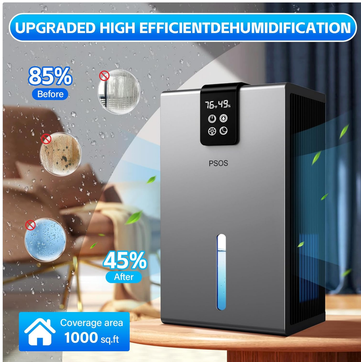
Figure 3.1: The dehumidifier effectively reduces humidity in spaces up to 1000 sq.ft, as shown by the before and after humidity levels.