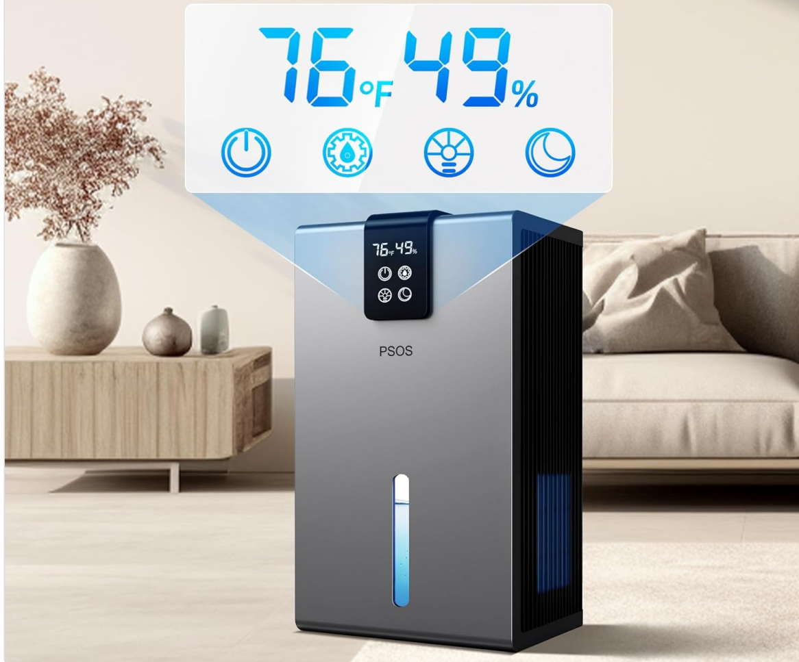
Figure 2.2: Close-up of the intelligent control panel displaying temperature and humidity, along with power, mode, light, and sleep mode buttons.

Dual detection of temperature & humidity