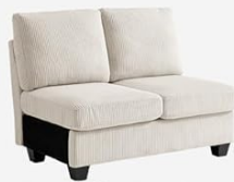
Double Seater Carton B *1