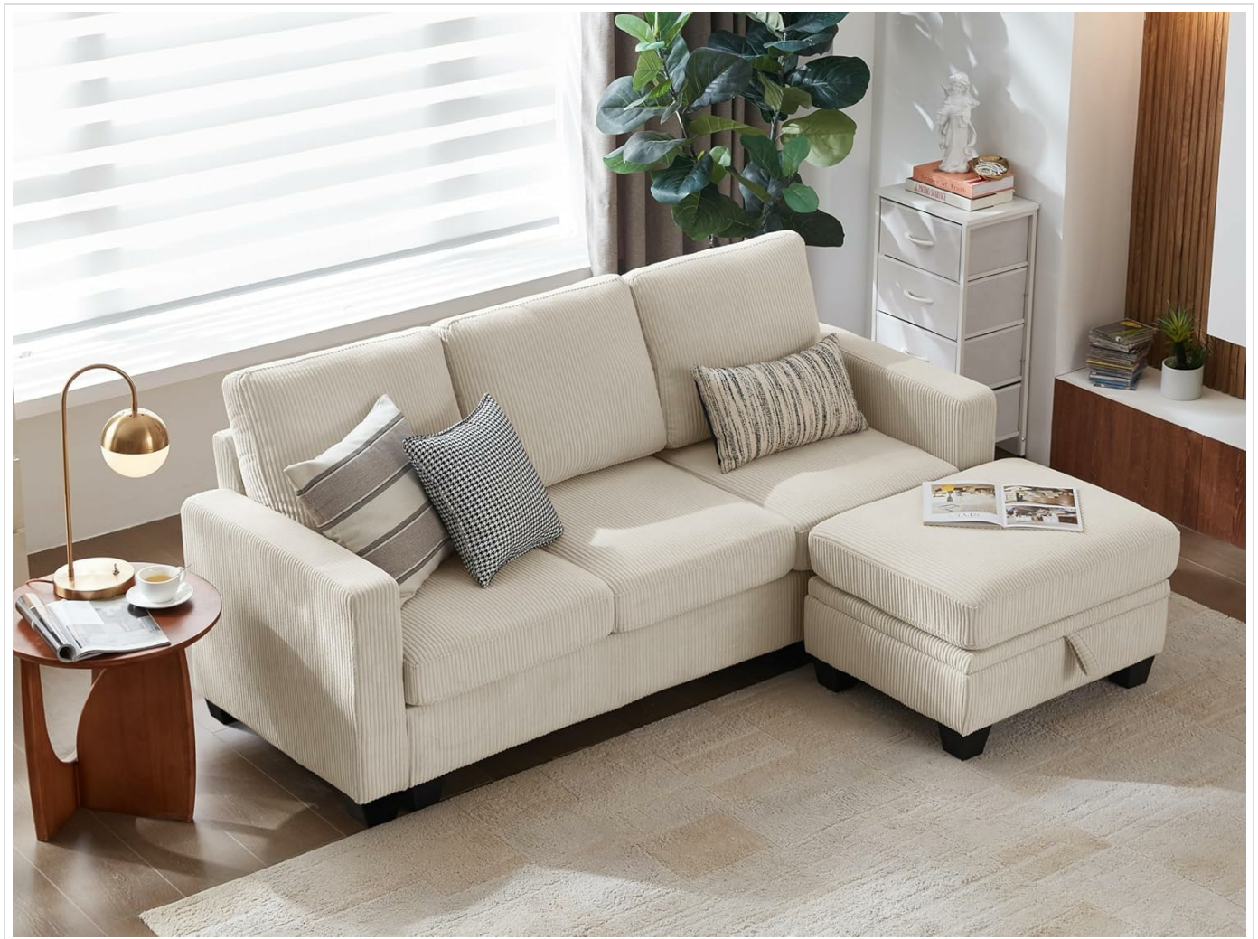
Figure 7: Key dimensions and weight capacity of the CHIC HOUSE KALEIDO Modular Sectional Sofa.