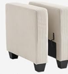
Sofa Armrest Carton D *1