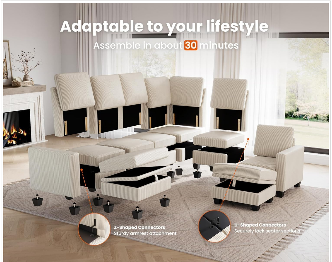
Figure 3: Visual guide for assembling the modular sofa, showing how pieces connect and where legs are attached.

Your browser does not support the video tag.