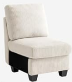
Single Seater Carton A *1