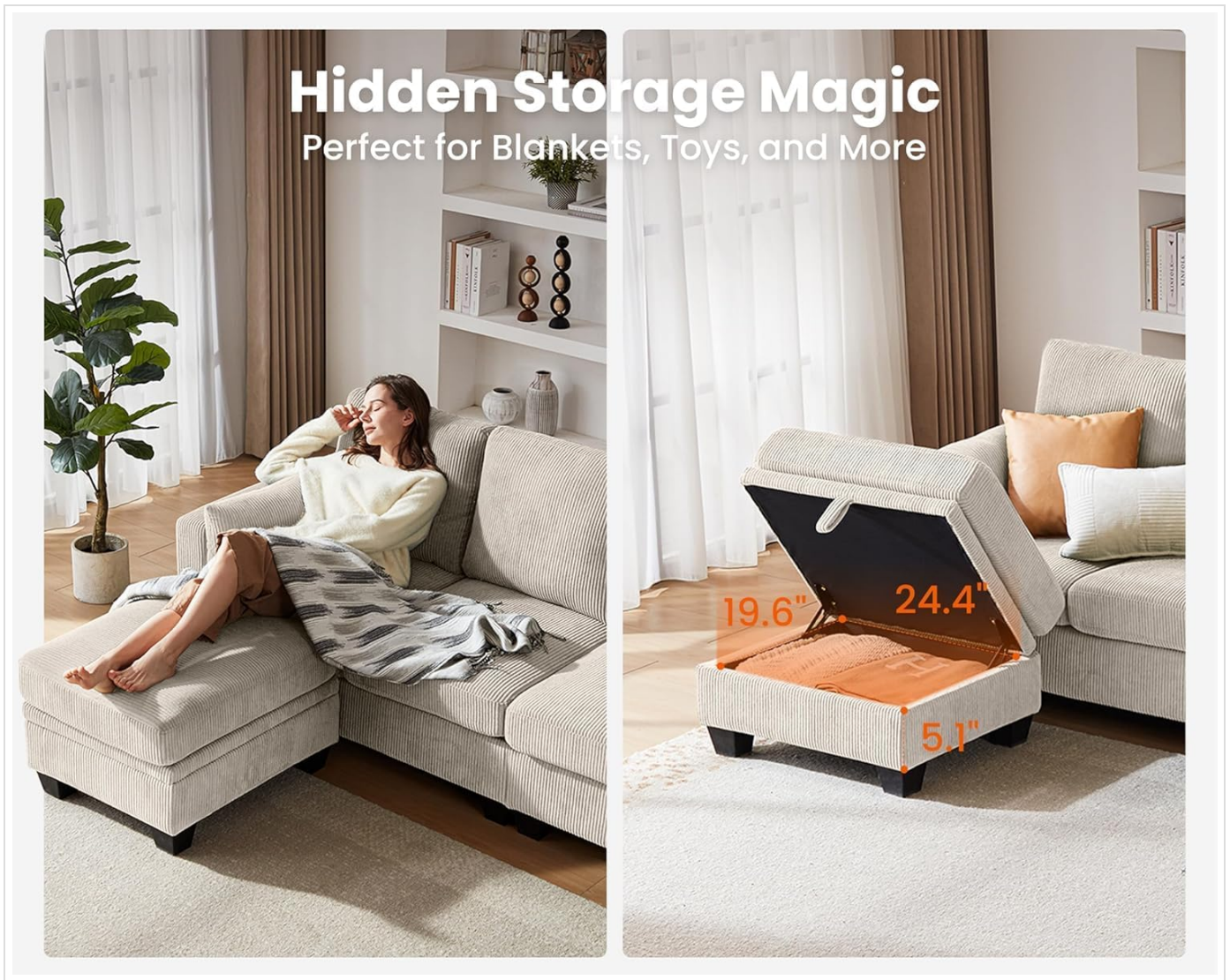
Figure 5: The versatile storage ottoman, demonstrating its use as a chaise and its hidden storage capacity.

Your browser does not support the video tag.