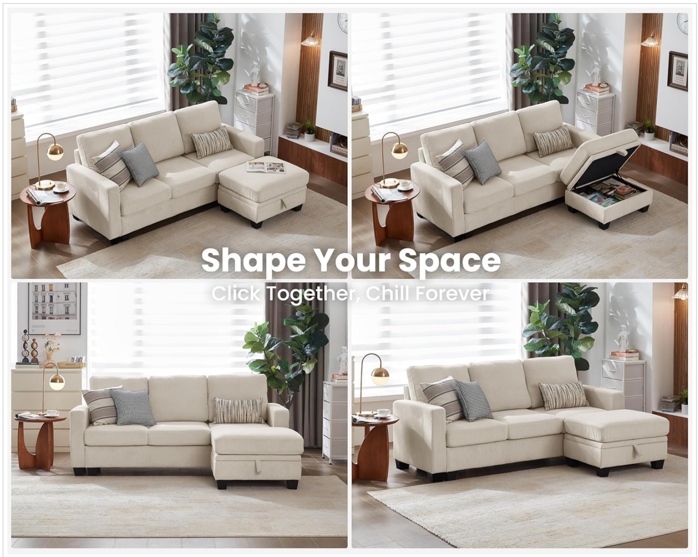
Figure 4: Examples of various sofa configurations possible with the modular sections and ottoman.