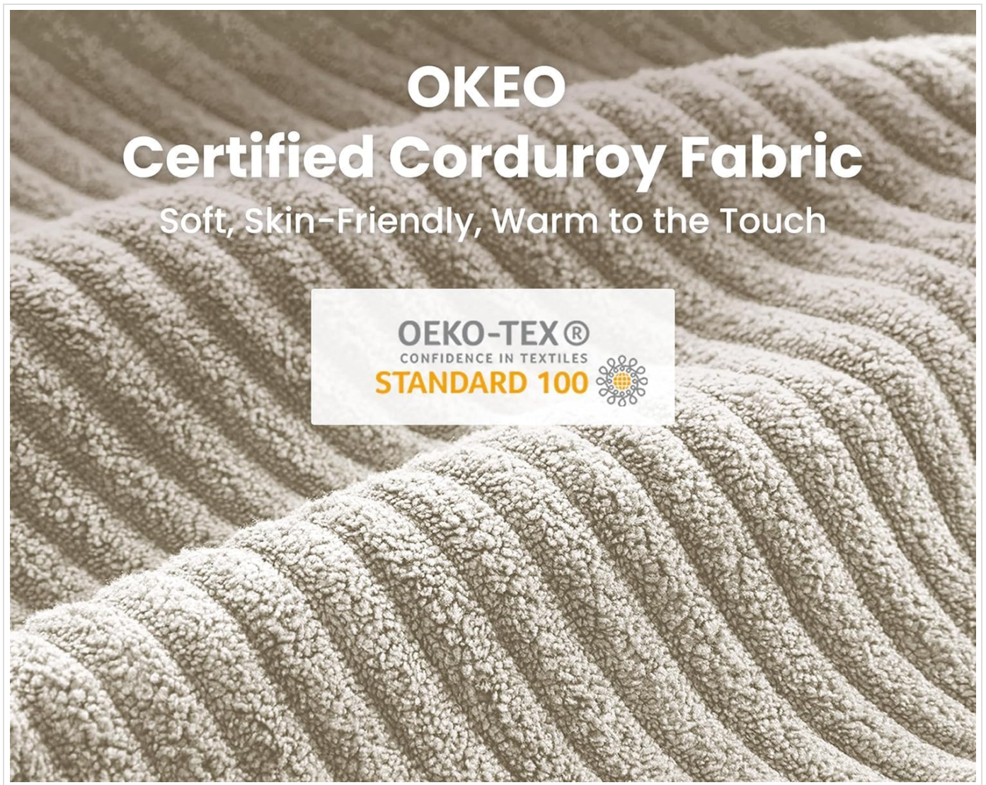
Figure 6: The OEKO-TEX certified corduroy fabric, highlighting its quality and comfort.