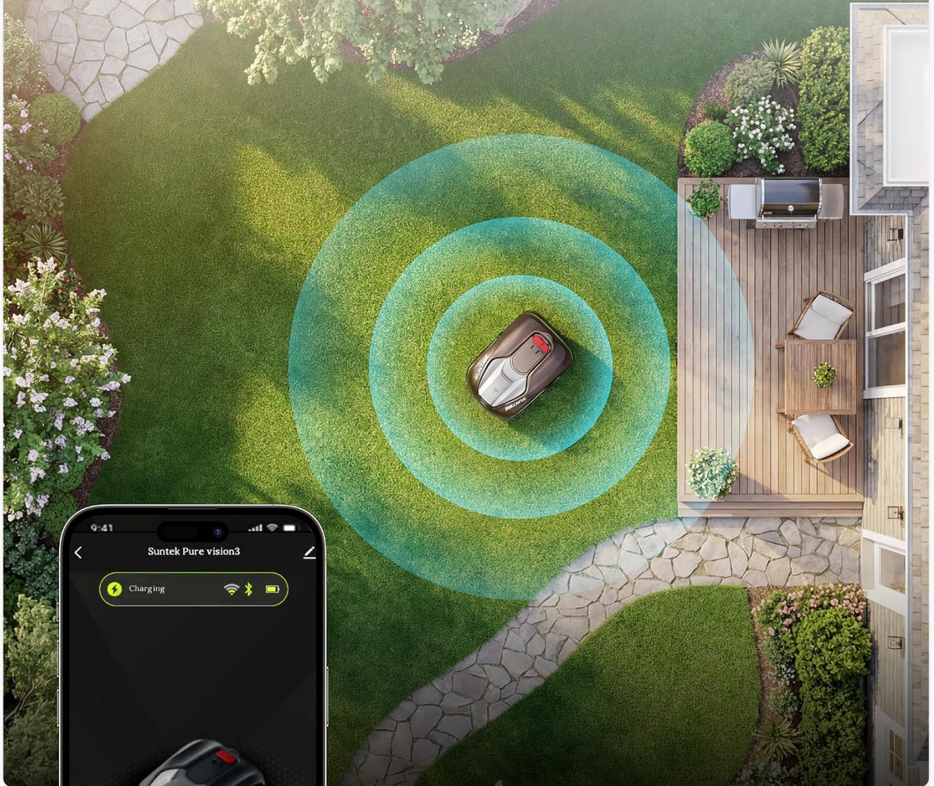
Image: An aerial view of the SUNTEK SRM2025 robot lawnmower on a lawn, with a smartphone displaying the control app interface, demonstrating intelligent app control.

Configurez facilement les planning de tonte et la connexion réseau via Bluetooth.