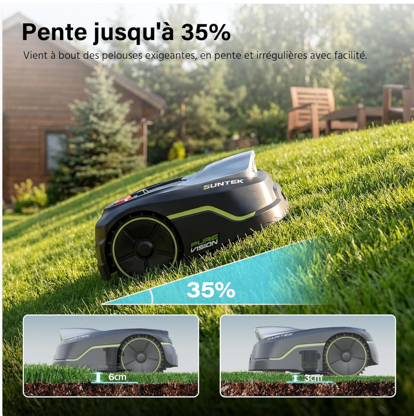
Image: The SUNTEK SRM2025 robot lawnmower navigating an incline, with insets showing adjustable cutting heights of 3cm and 6cm, highlighting its ability to handle slopes up to 35%.

Vient à bout des pelouses exigeantes, en pente et irrégulières avec facilité.