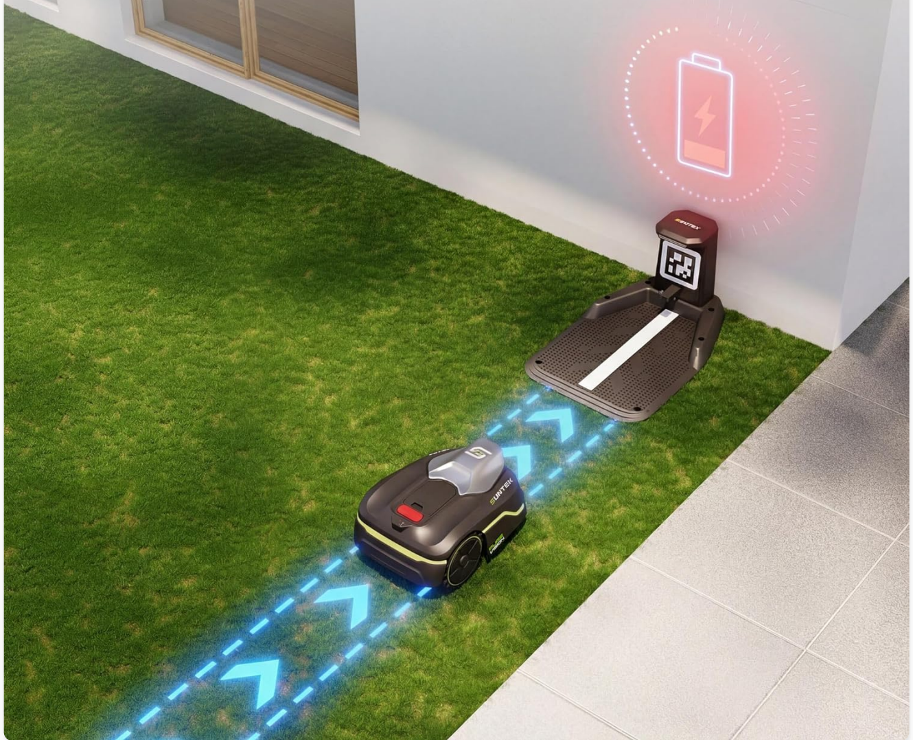
Image: The SUNTEK SRM2025 robot lawnmower automatically navigating back to its charging station, indicated by blue arrows, for recharging or during rain.

Par temps de pluie ou en cas de batterie faible