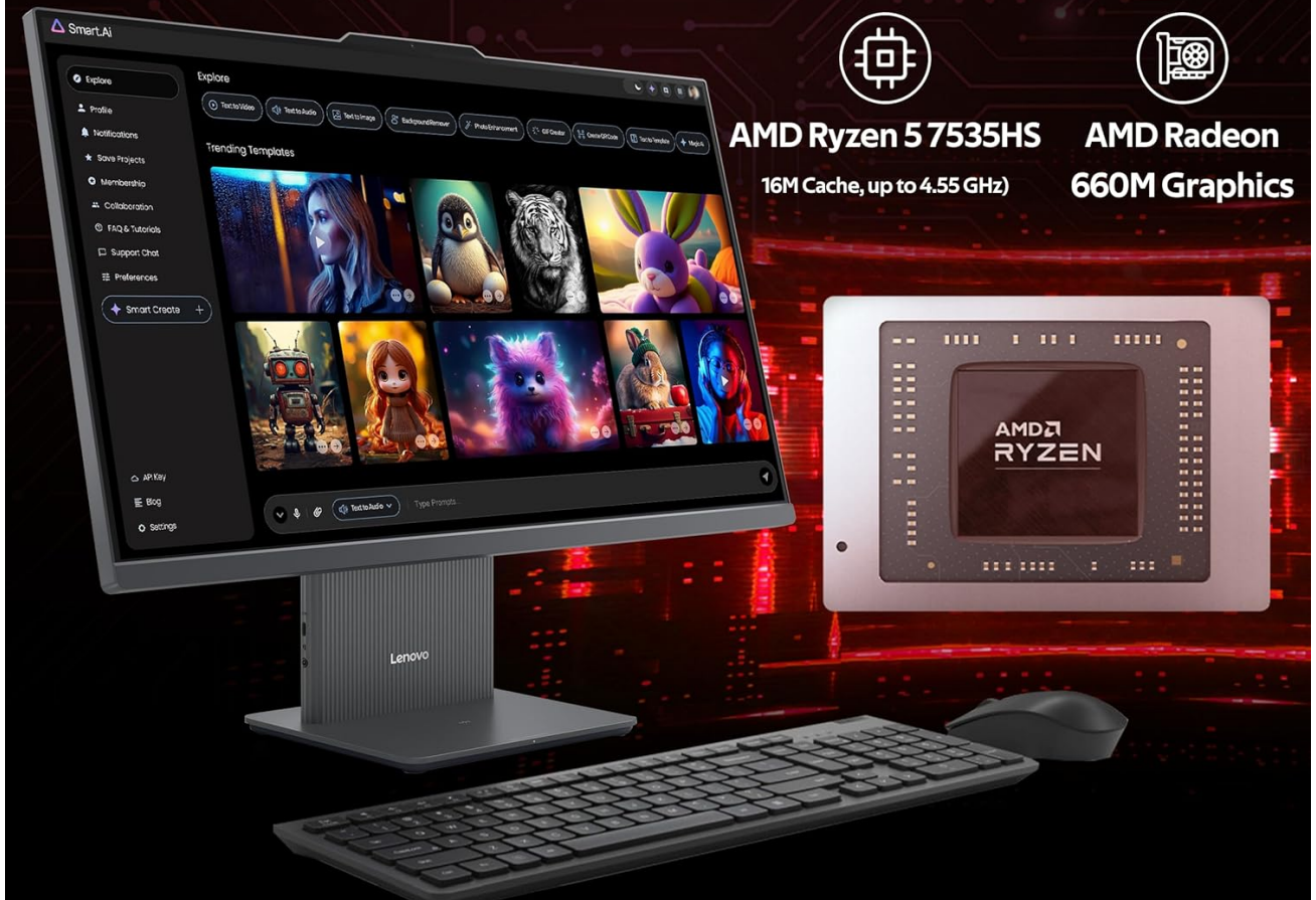
Figure 4.2: Illustration of the AMD Ryzen 5 7535HS processor and AMD Radeon 660M Graphics for powerful processing.

AMD Ryzen™ 5 powers through multitasking, dataset crunching, code debugging, and resource-intensive applications. Engineered for on-site or remote work, it delivers consistent full-throttle performance to eliminate lag and boost productivity.