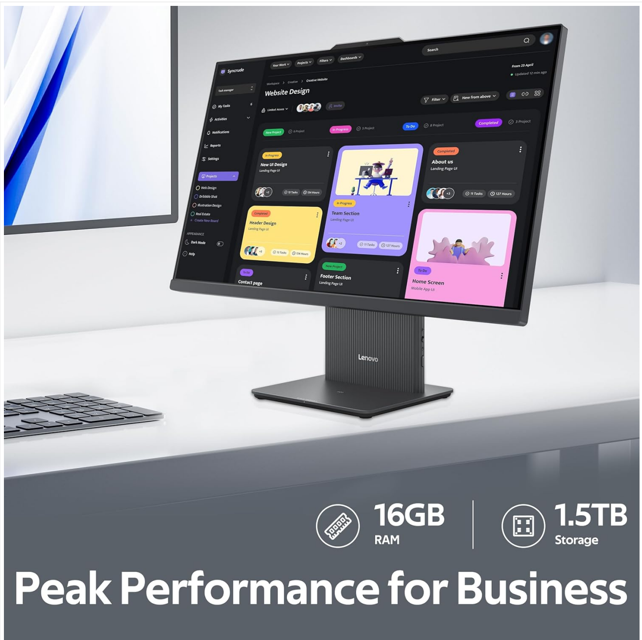
Figure 4.3: The All-in-One desktop highlighting its 16GB RAM and 1.5TB storage capabilities.