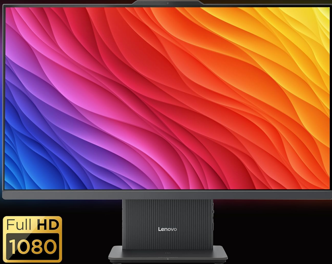
Figure 4.1: The 23.8-inch Full HD display provides clear and vibrant visuals.

Crisp visuals on a 23.8-inch FHD screen! Enjoy stunning clarity and vibrant colors for work, streaming, or creative tasks—ideal for immersive daily use.