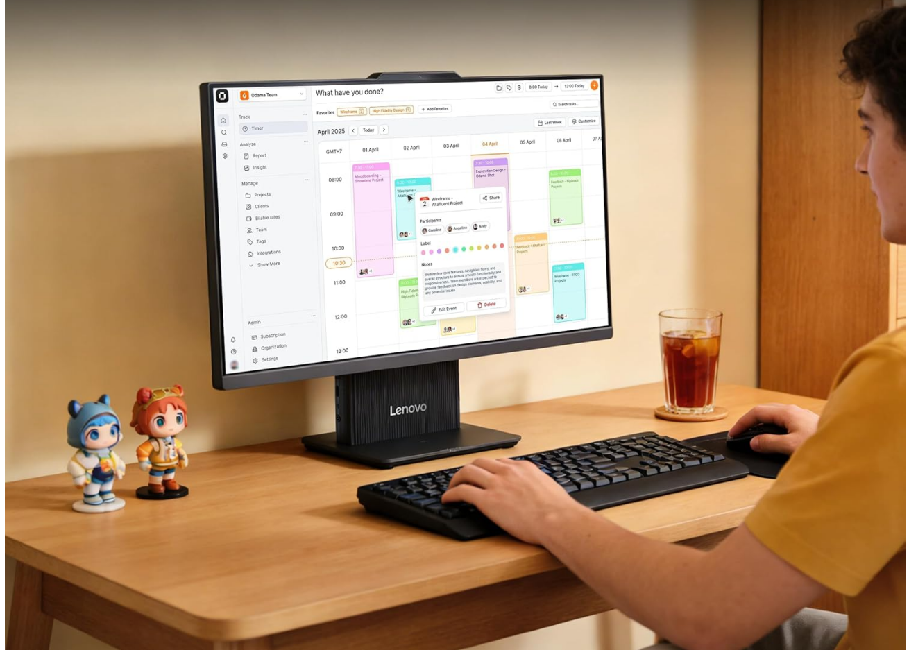
Figure 4.5: A user demonstrating the ability to manage multiple applications and tasks on the desktop.

Handle multiple tabs, apps, and projects at once. No lag, no crashes—seamlessly switch between work, browsing, and creativity in one screen.