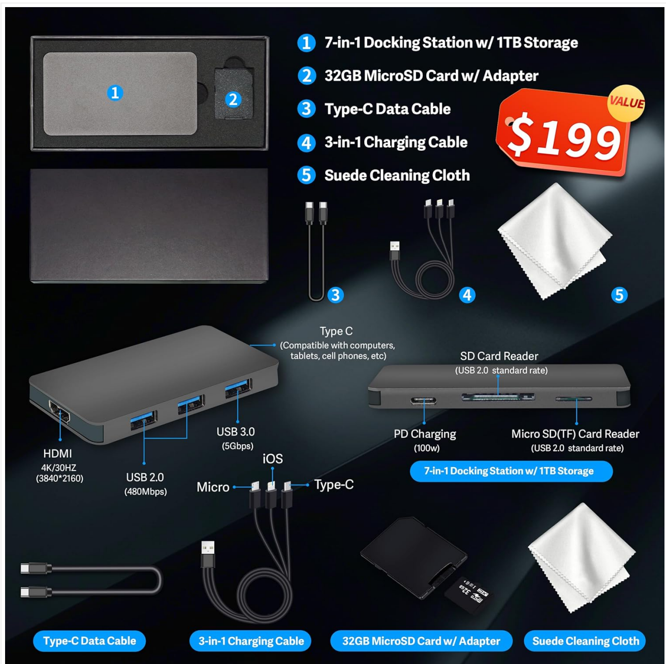
Figure 2.1: Included accessories, featuring the 7-in-1 docking station, cables, MicroSD card, and cleaning cloth.