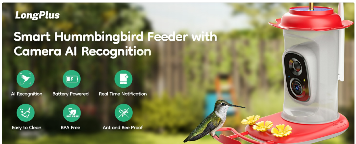
Image: Overview of the LongPlus Smart Hummingbird Feeder highlighting its features like AI recognition, battery power, real-time notifications, easy cleaning, BPA-free material, and ant/bee proof design.

The LongPlus 1080P Solar Hummingbird Feeder with Camera provides an interactive way to observe hummingbirds. It features a 2K camera for capturing video and images, AI-powered species identification, and a solar panel for continuous power. The feeder is designed with features to deter ants and bees, ensuring a clean feeding environment for hummingbirds.