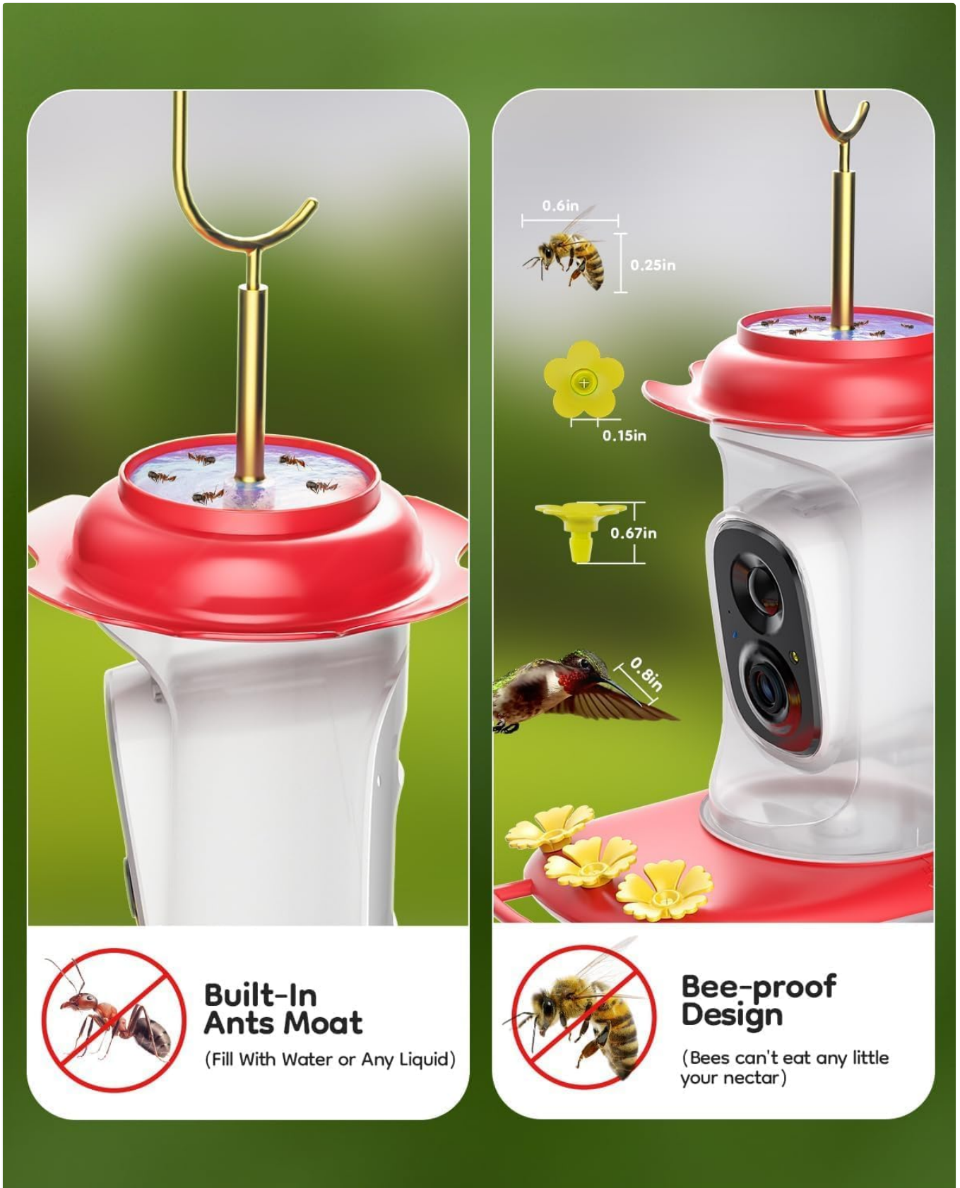
Image: Close-up of the feeder showing the built-in ant moat filled with water and the bee-proof feeding ports, designed to protect the nectar from pests.

6. Assemble Ant Moat: Fill the built-in ant moat with water or any liquid to deter ants from reaching the nectar.