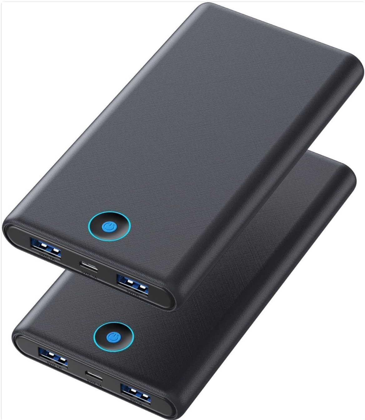
Image: The FOCHEW 20000mAh Portable Power Bank, a compact and sleek black device.