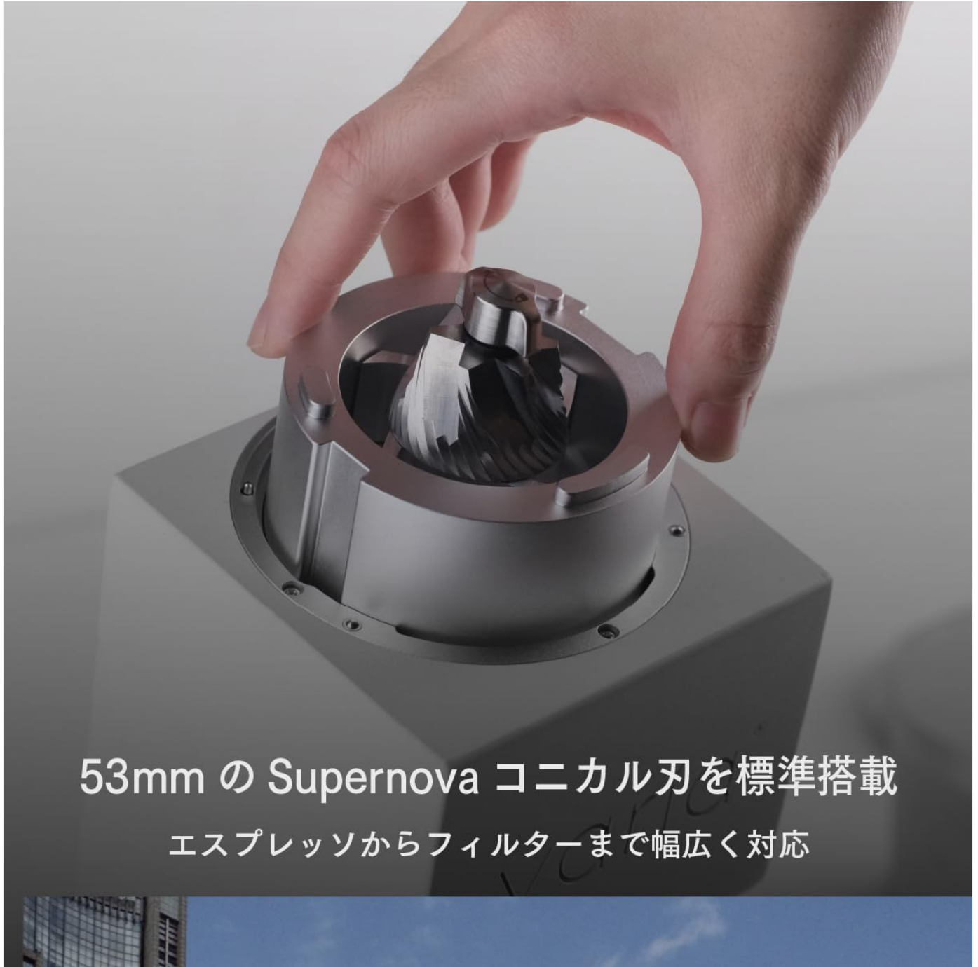
Image 5: View of the 53mm Supernova conical burrs, highlighting the precision grinding components.