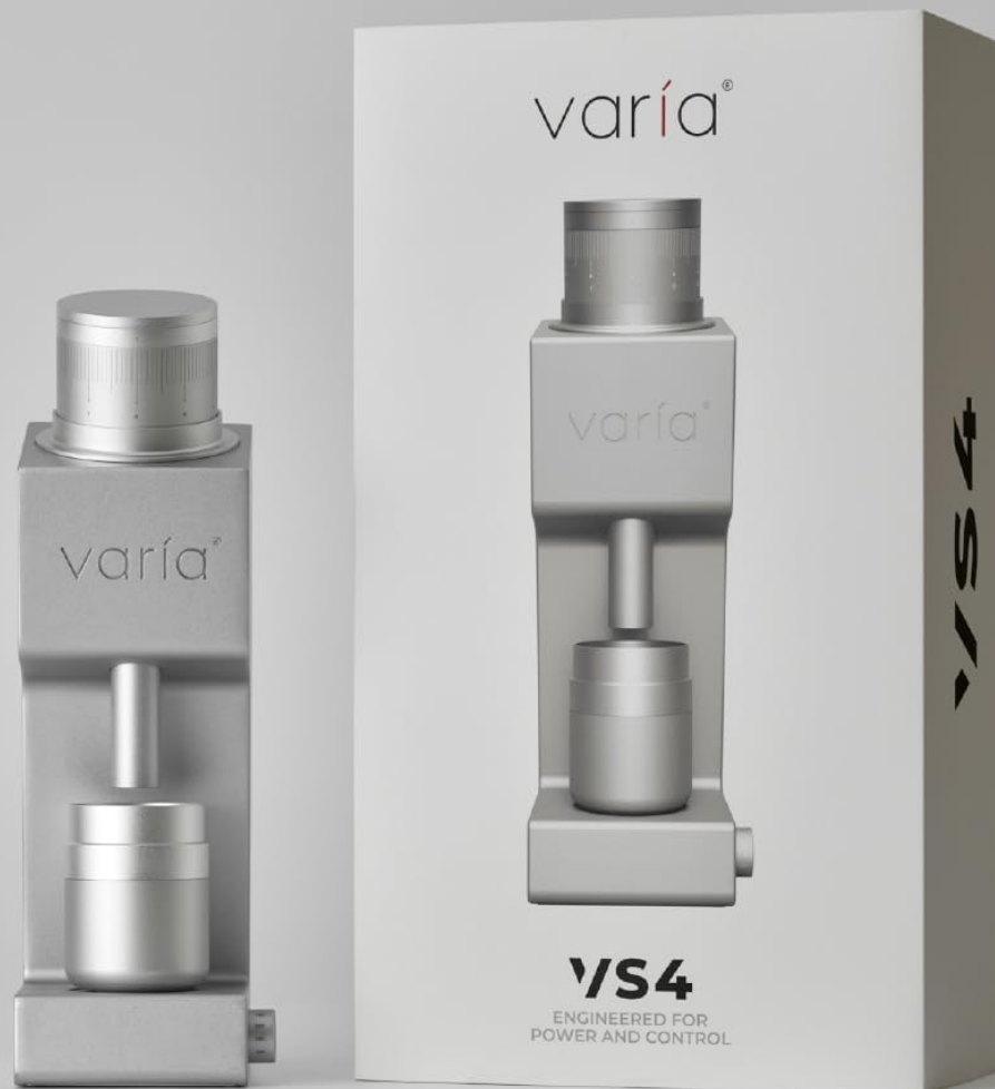
Image 3: The Varia VS4 Grinder in Silver, shown with its retail packaging.