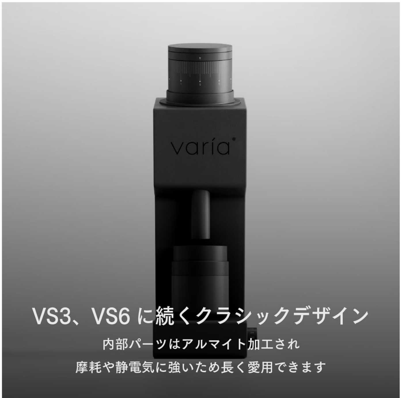
Image 1: Varia VS4 Grinder main unit, showcasing its sleek design.