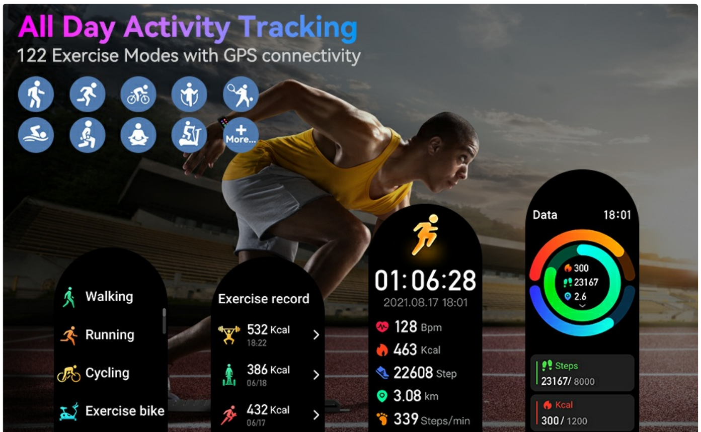
Image: The Bestinn H32 Fitness Tracker displaying all-day activity tracking data, including steps, distance, and calories burned, with icons for various sports modes.