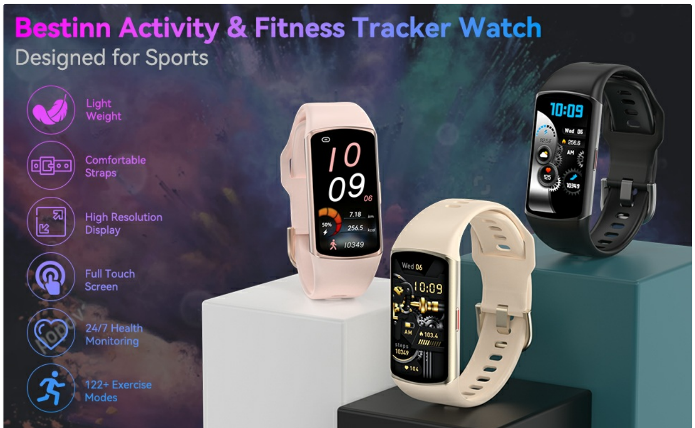
Image: The Bestinn H32 Fitness Tracker showcasing its 1.58" Ultra-HD display with multiple customizable watch faces and an always-on display feature.