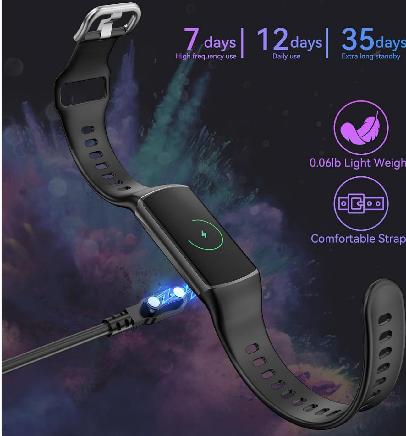
Image: The Bestinn H32 Fitness Tracker connected to its magnetic charging cable, illustrating the charging process.