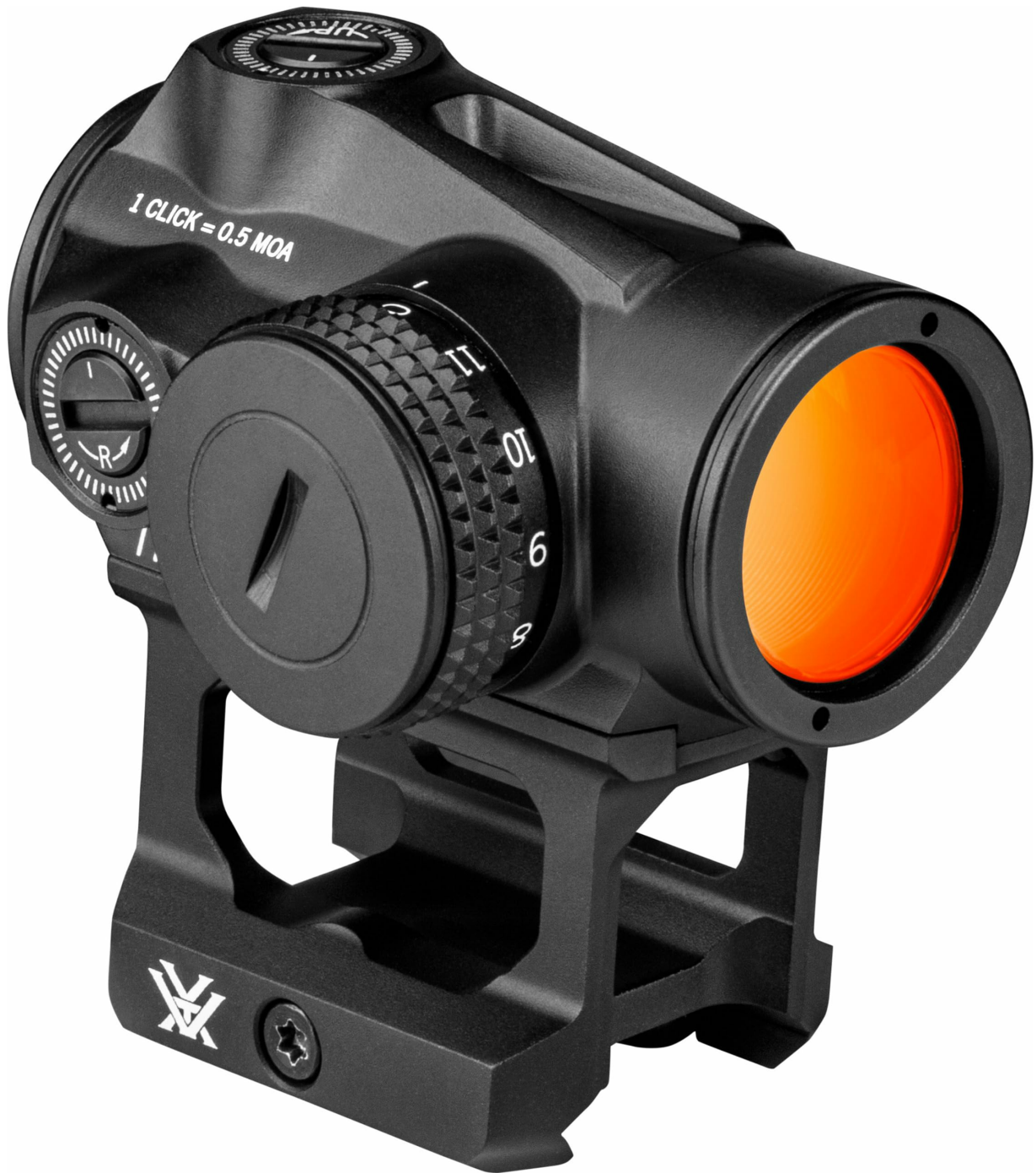
Figure 1: Front view of the Vortex Triumph Red Dot Sight.