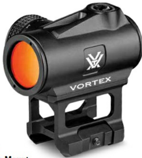
Lower 1/3 Co-Witness Mount

Figure 5: The Lower 1/3 Co-Witness Mount allows for integration with existing iron sights.