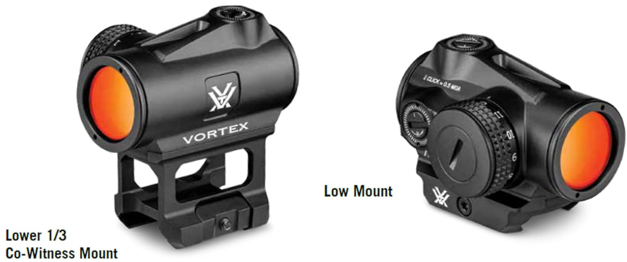
Figure 3: The Vortex Triumph Red Dot Sight shown with both the Lower 1/3 Co-Witness Mount and the Low Mount.