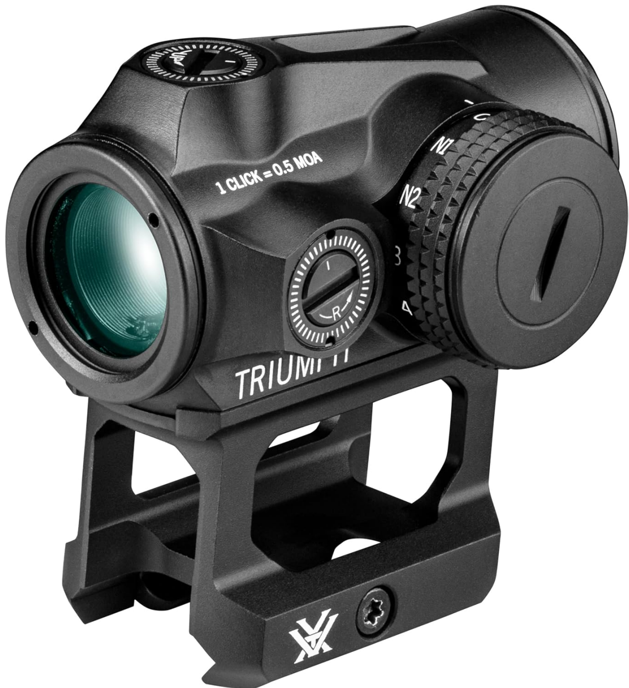
Figure 6: Top and side view of the red dot sight, highlighting the elevation and windage turrets.

To adjust, remove the protective caps from the turrets. Use a small flathead screwdriver or the provided tool to rotate the turrets. Rotate the elevation turret (top) to adjust vertical aim and the windage turret (side) to adjust horizontal aim. Replace the caps after adjustment.