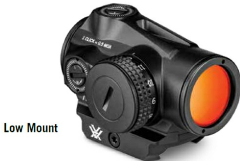
Figure 4: The Low Mount provides a compact profile for the red dot sight.