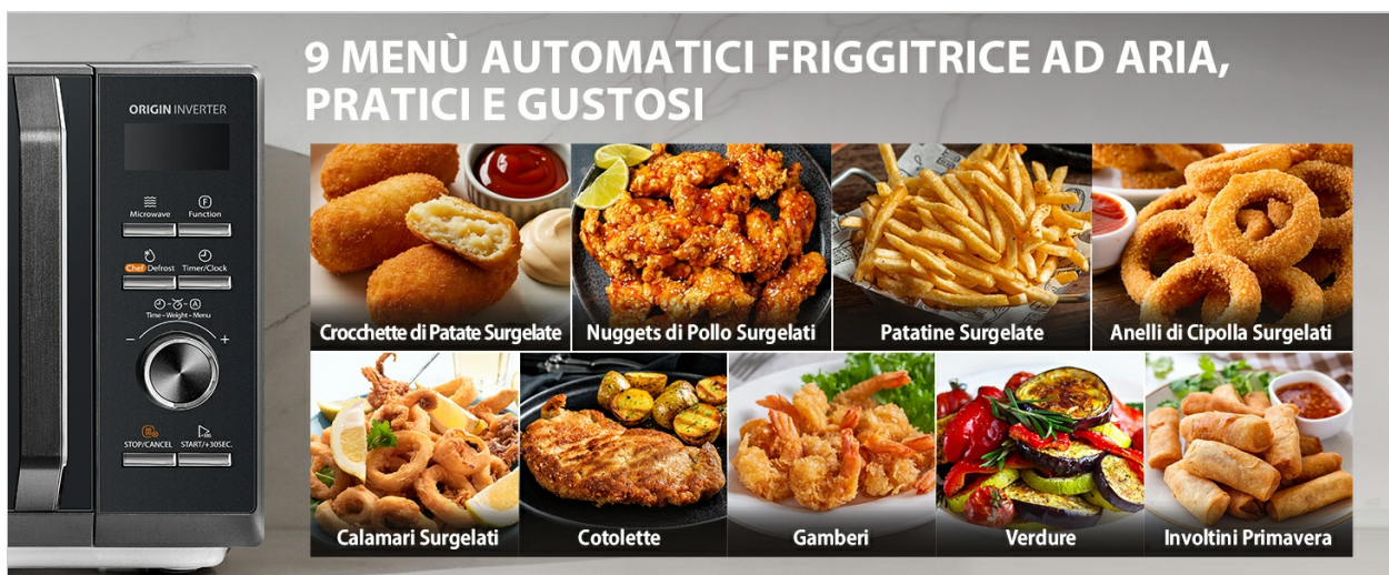
Image: Close-up of the digital control panel, showing function buttons and the dial, with examples of automatic air fryer menus.

The control panel features touch buttons for various functions and a central dial for time/weight adjustments and menu selection.