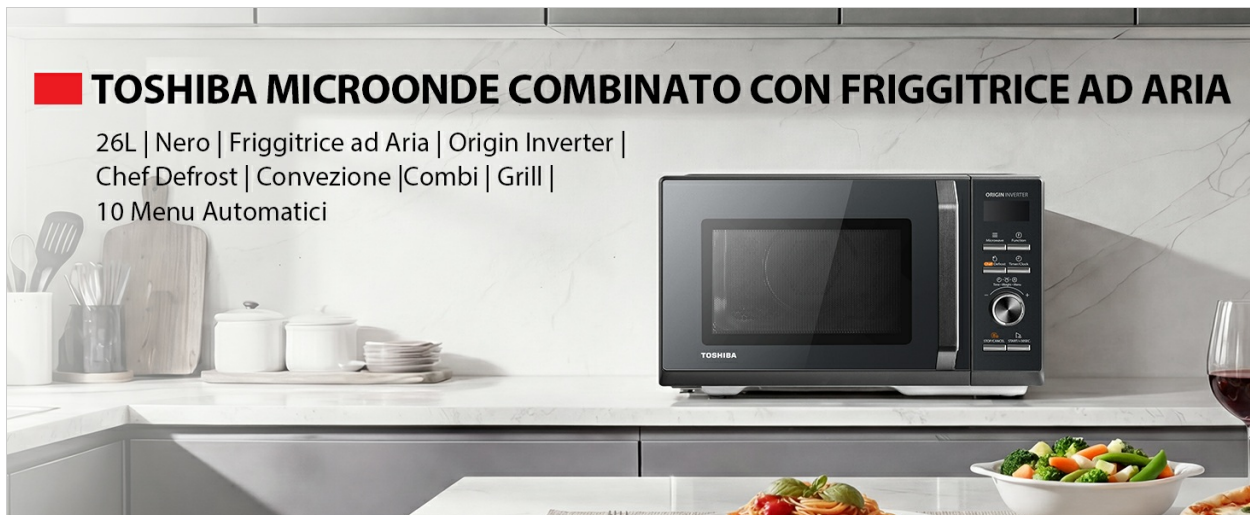
Image: The Toshiba combined microwave oven placed on a kitchen counter, illustrating a typical installation setup.