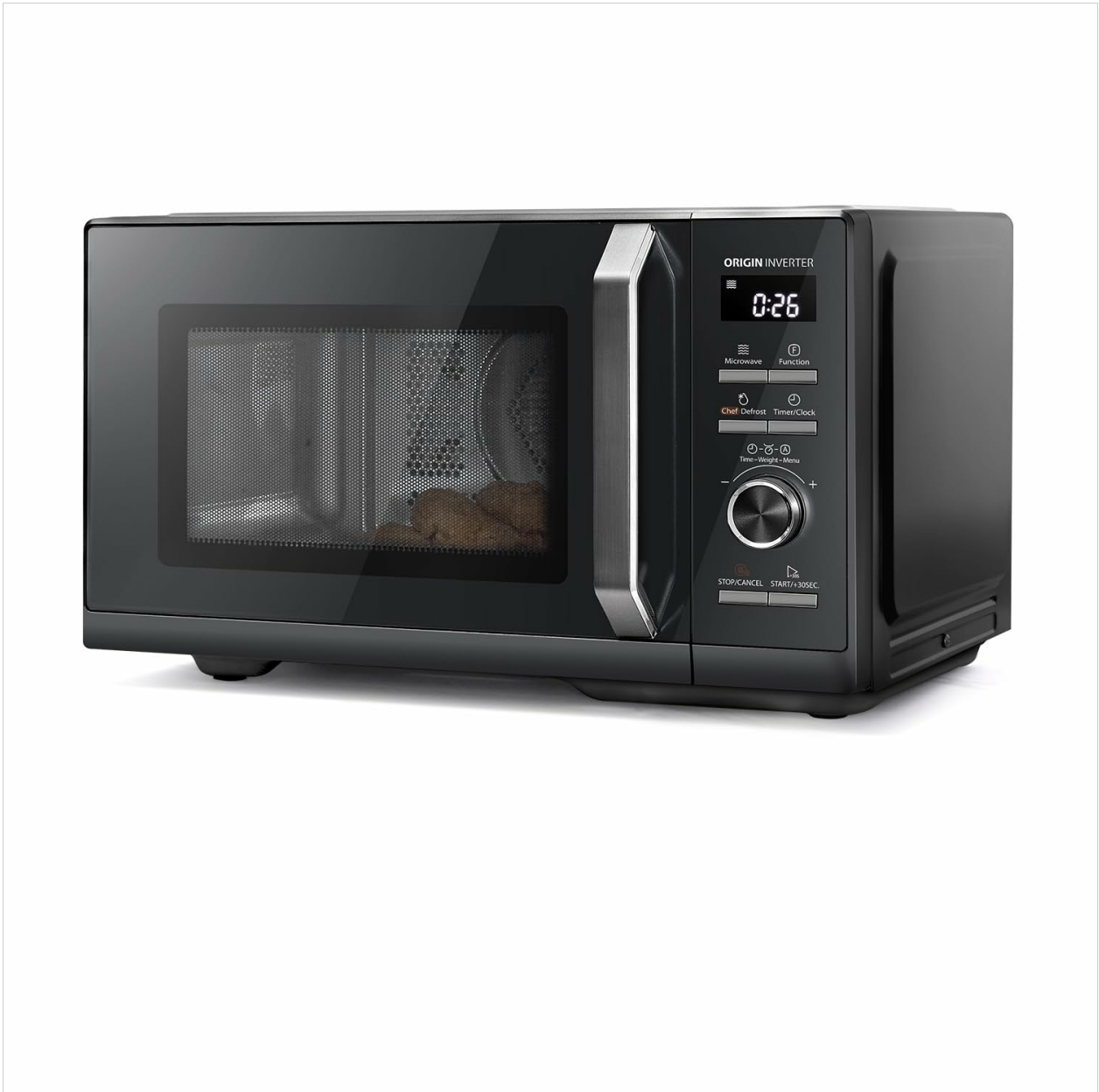
Image: Front view of the Toshiba MW3-AC26SFI(BK) 6-in-1 Combined Microwave Oven, showcasing its sleek black design and control panel.