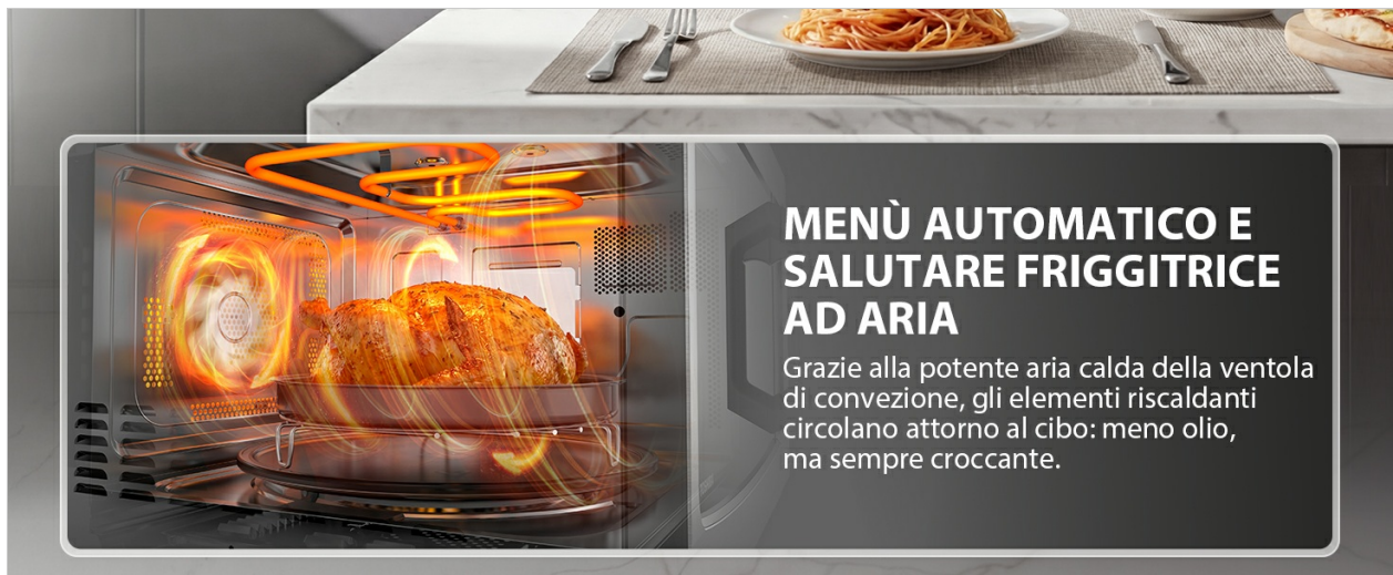
Image: Interior view of the microwave oven demonstrating the air fryer function, with a whole chicken being cooked by circulating hot air.