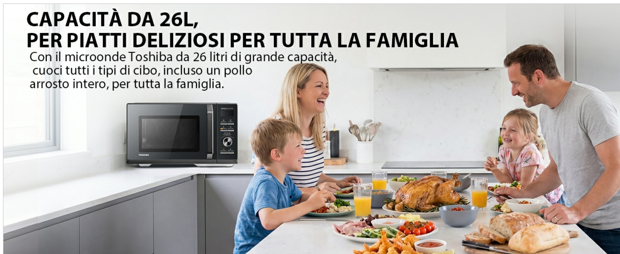
Image: A family gathered around a kitchen table with various dishes, including a roasted chicken, suggesting the capacity of the 26L microwave for family meals.