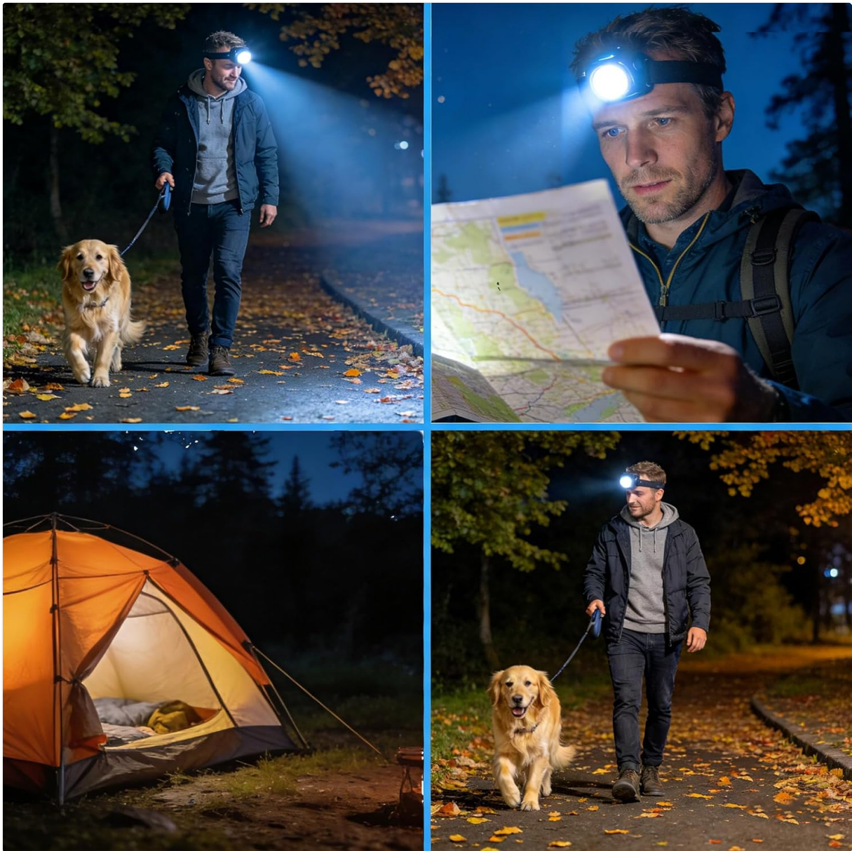
Image: Illustration of the headlamp's 90-degree adjustable tilt feature.