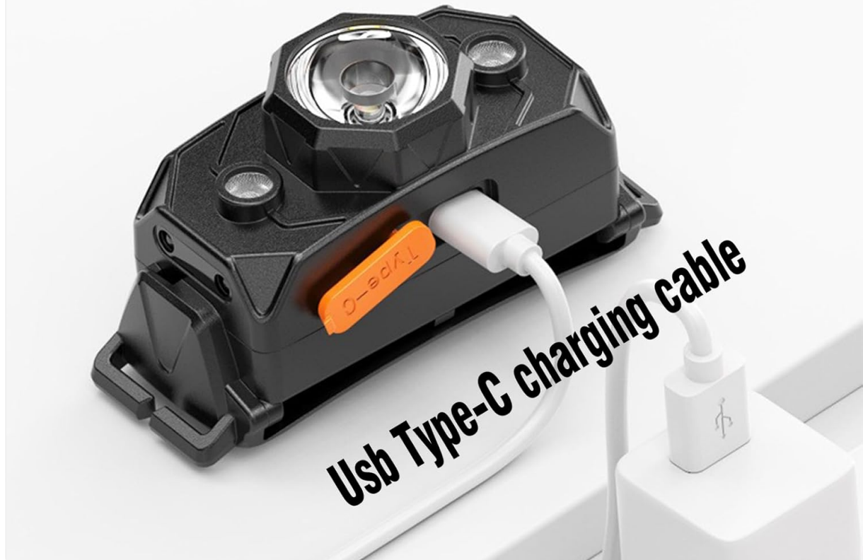
Image: The USB-C charging port on the ODEAR mini02 headlamp.