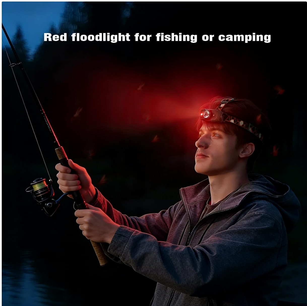
Image: Red floodlight mode in use during a night fishing activity.