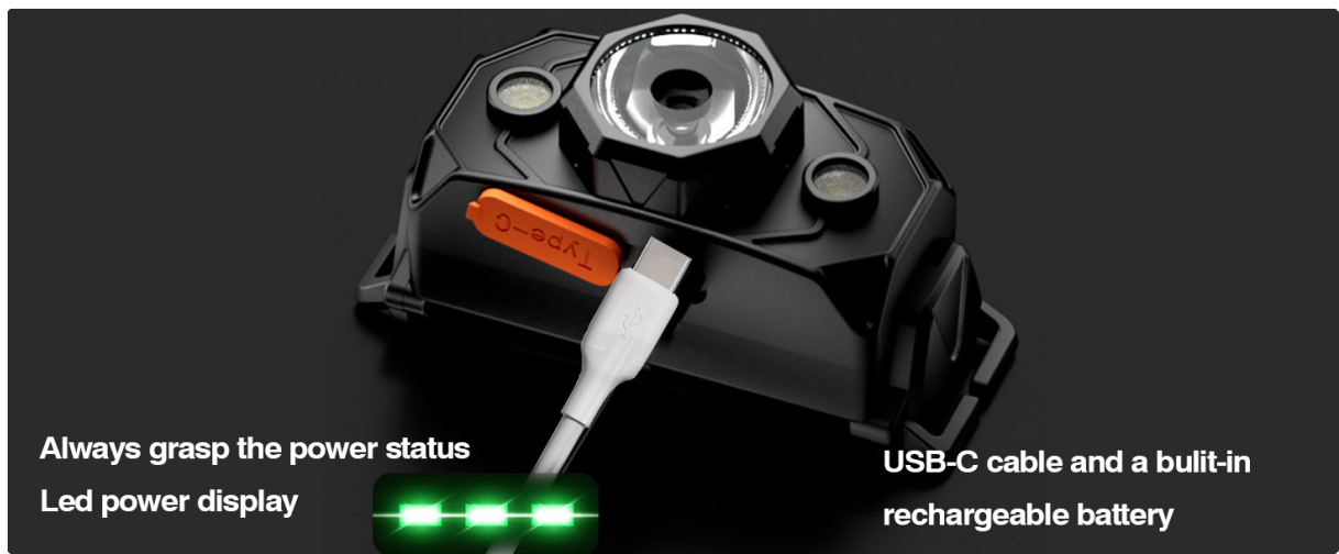
Image: The ODEAR mini02 headlamp, adjustable headband, and USB-C charging cable as packaged.