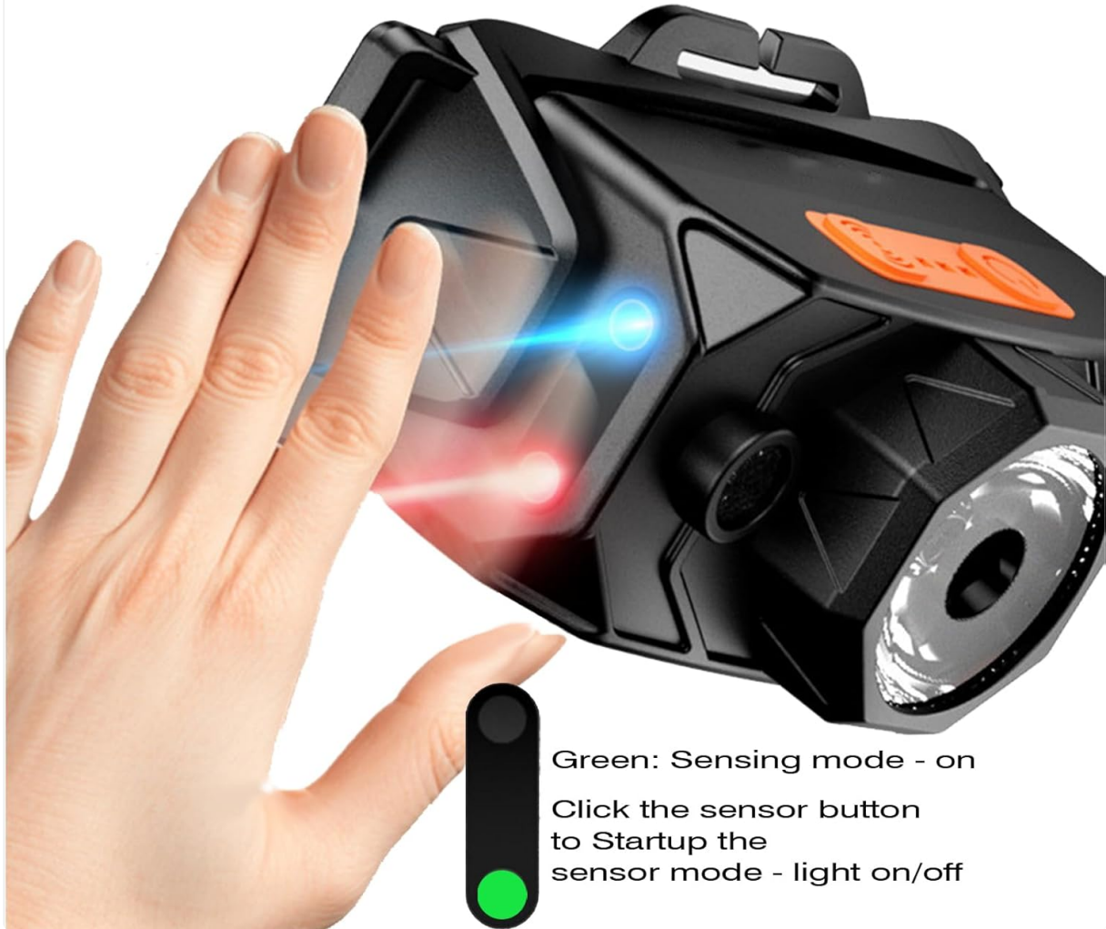
Image: Demonstrating the motion sensor function for hands-free control.