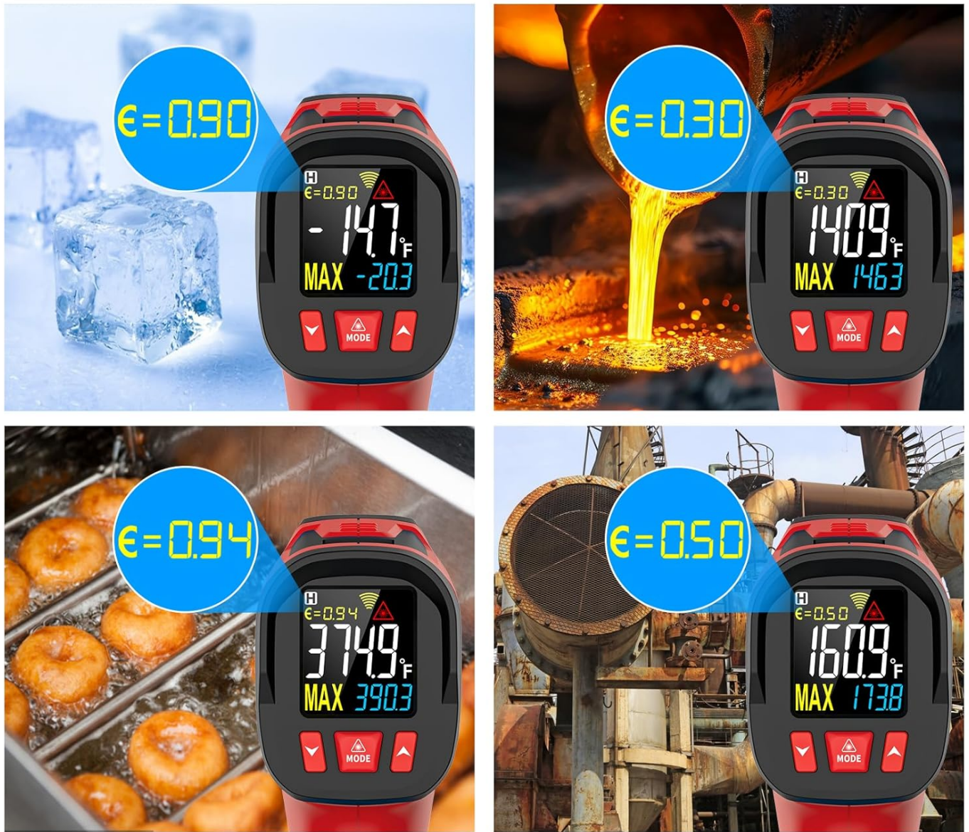
Figure 6.4: Examples of adjustable emissivity for different materials.

The emissivity can be adjusted according to the material the measuring object