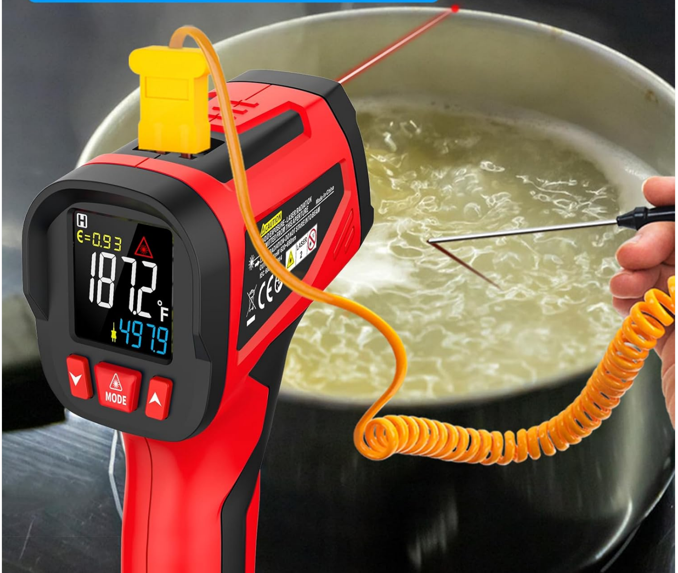
Figure 6.3: Using the K-type thermocouple probe for contact measurement.

Thermocouple measurement: -40-1202°F (-40~650°C)