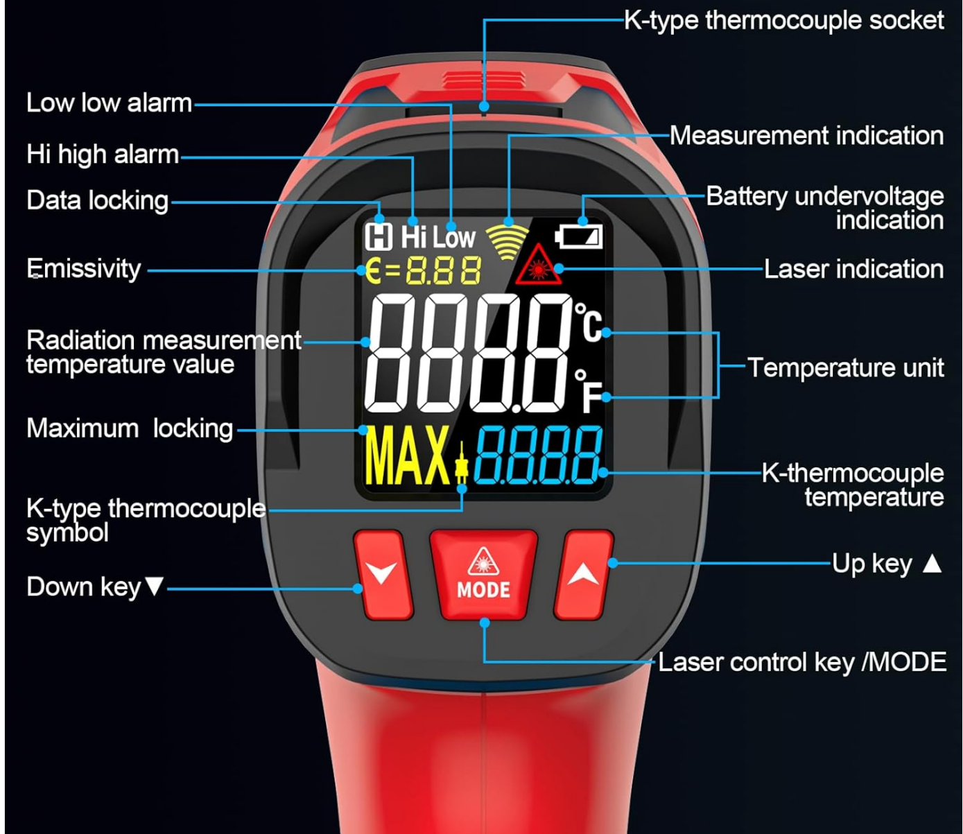
Figure 4.2: Detailed component identification of the IR06PRO thermometer.