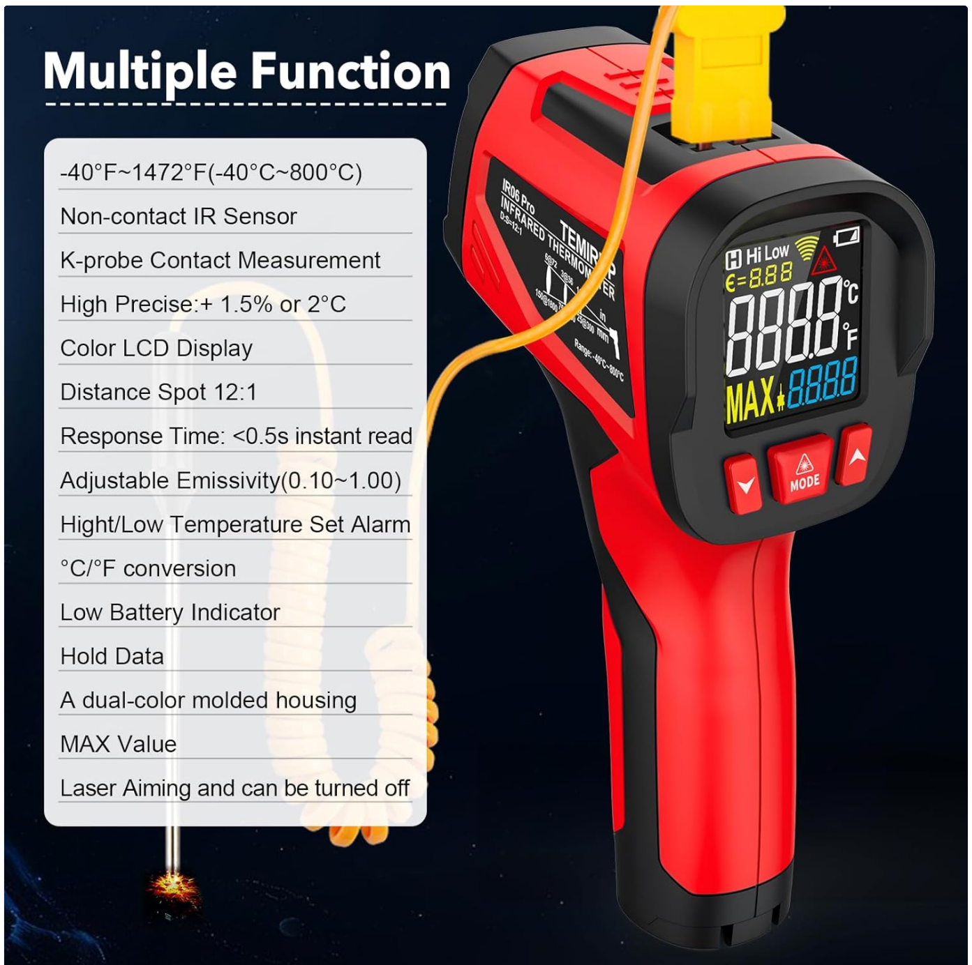
Figure 4.1: Key features and functions of the IR06PRO thermometer.