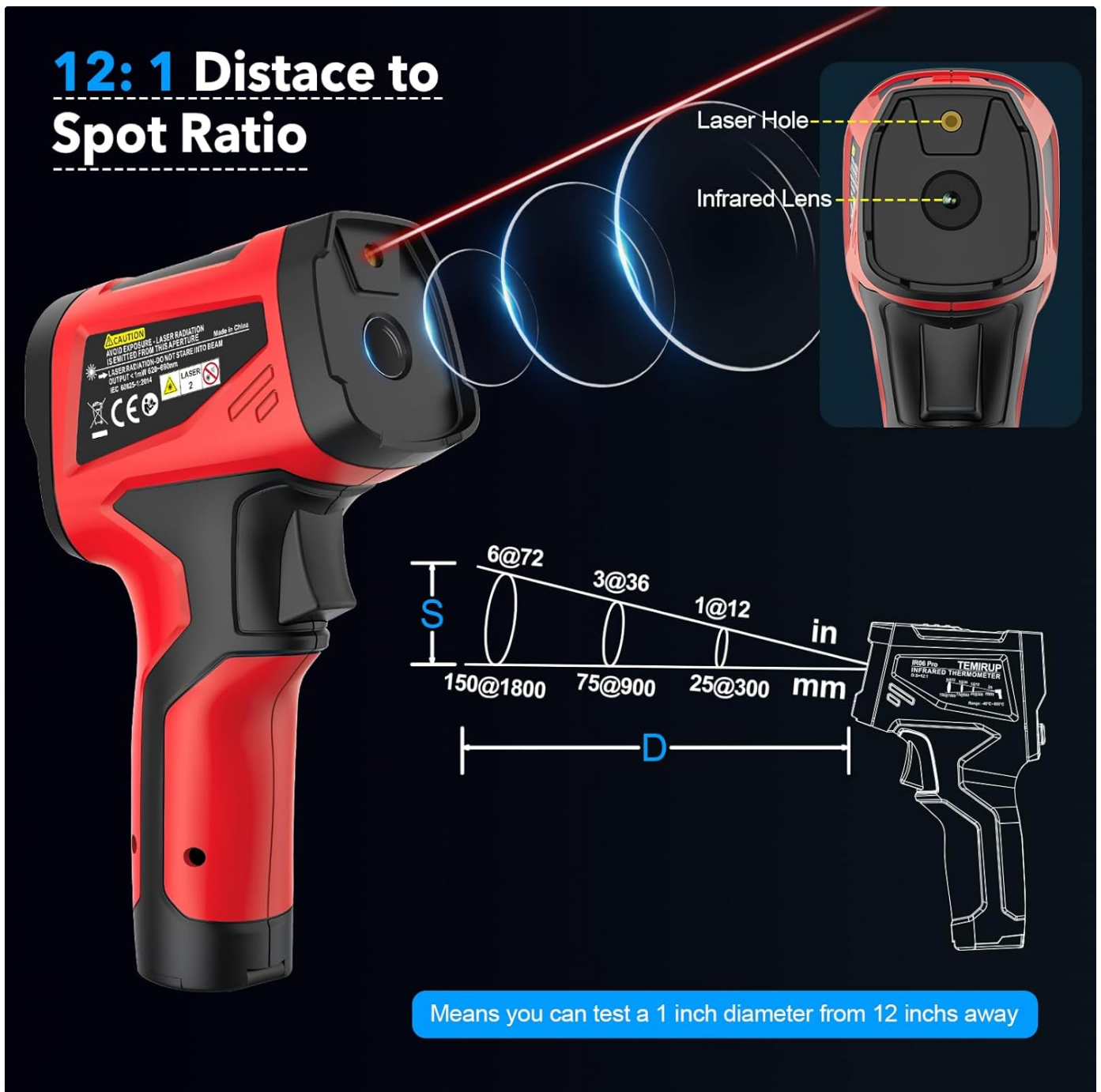
Figure 6.2: Understanding the 12:1 Distance-to-Spot Ratio.