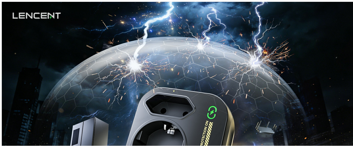
Image: LENCENT Surge Protector with lightning effects, illustrating protection against electrical surges.