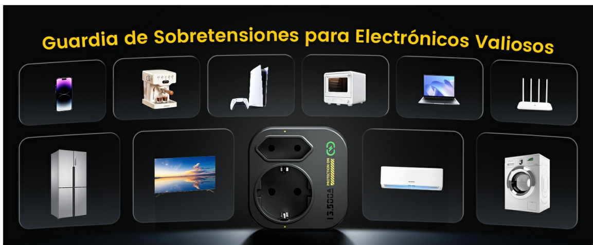
Image: The surge protector surrounded by various electronic devices, symbolizing protection for valuable electronics.