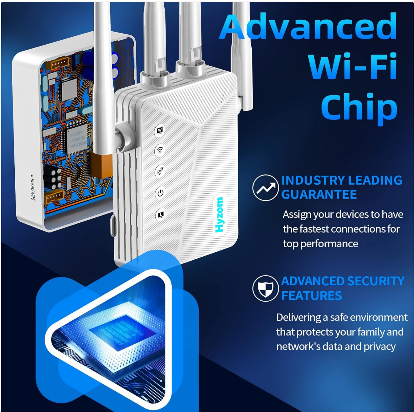
Figure 4.1: Front and side view of the Hyzom WiFi Extender, showing LED indicators, WPS button, and Ethernet ports.

Familiarize yourself with the components of your Hyzom WiFi Extender/Repeater.