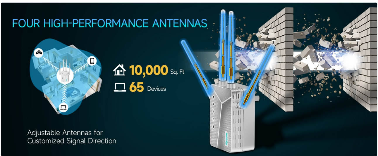
Figure 8.1: The Hyzom WiFi Extender features four high-performance, adjustable antennas for customized signal direction and improved penetration through walls.

Adjust the extender's antennas for optimal signal direction.