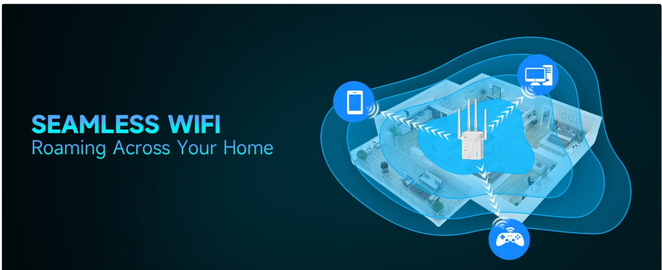
Figure 6.2: The Hyzom WiFi Extender supports connection for over 65 devices, including smartphones, notebooks, IP cameras, speakers, tablets, and gaming consoles.