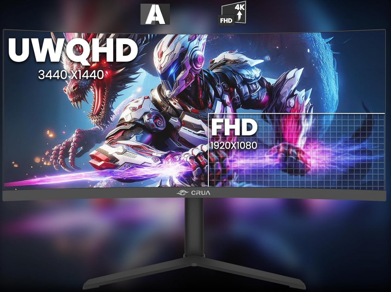
Image: Visual comparison demonstrating the higher detail of UWQHD (3440x1440) resolution versus FHD (1920x1080).

Switch between UWQHD 3440×1440 and FHD 1920×1080 for crystal-clear details or smoother performance — the perfect balance for work and play.