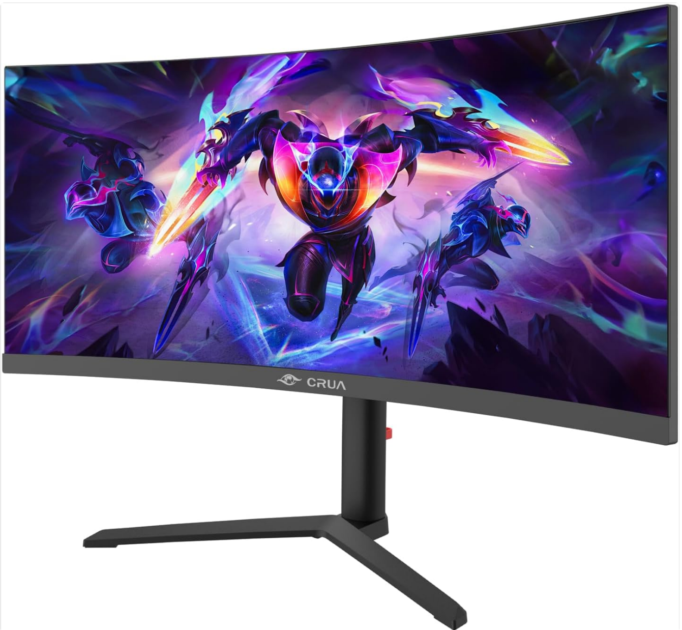
Image: Front view of the CRUA 34-inch Curved Gaming Monitor.