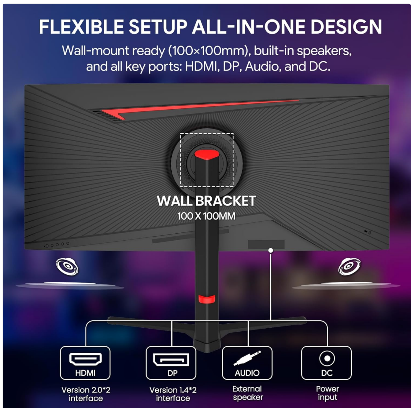
Image: Rear view of the monitor detailing HDMI, DP, Audio, DC ports, and the 100x100mm VESA wall bracket area.

The monitor supports VESA 100x100mm wall mounts. Remove the stand before attaching a compatible wall mount bracket (not included).