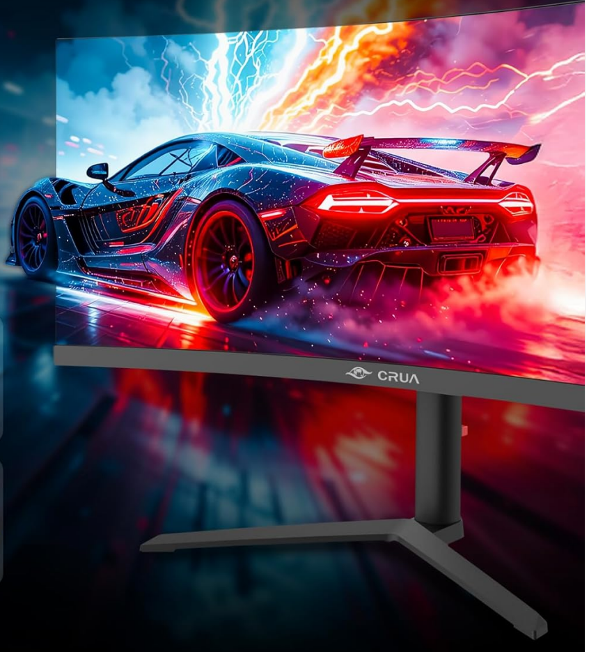
Image: Details on the monitor's color performance, highlighting 120% sRGB, 16.7 million colors, 4000:1 contrast ratio, and 355 cd/m 2 brightness.