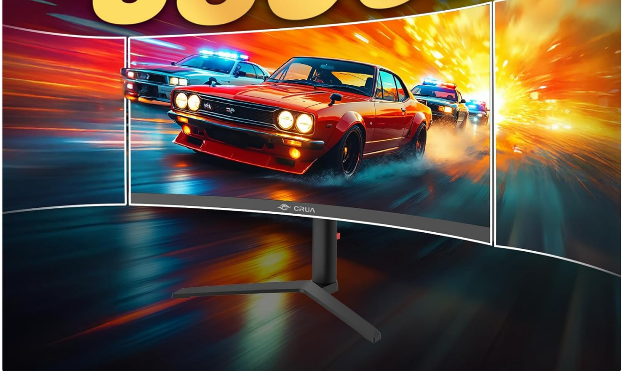
Image: Visual representation of the 3800R ultra-curved screen, demonstrating how it enhances immersion.