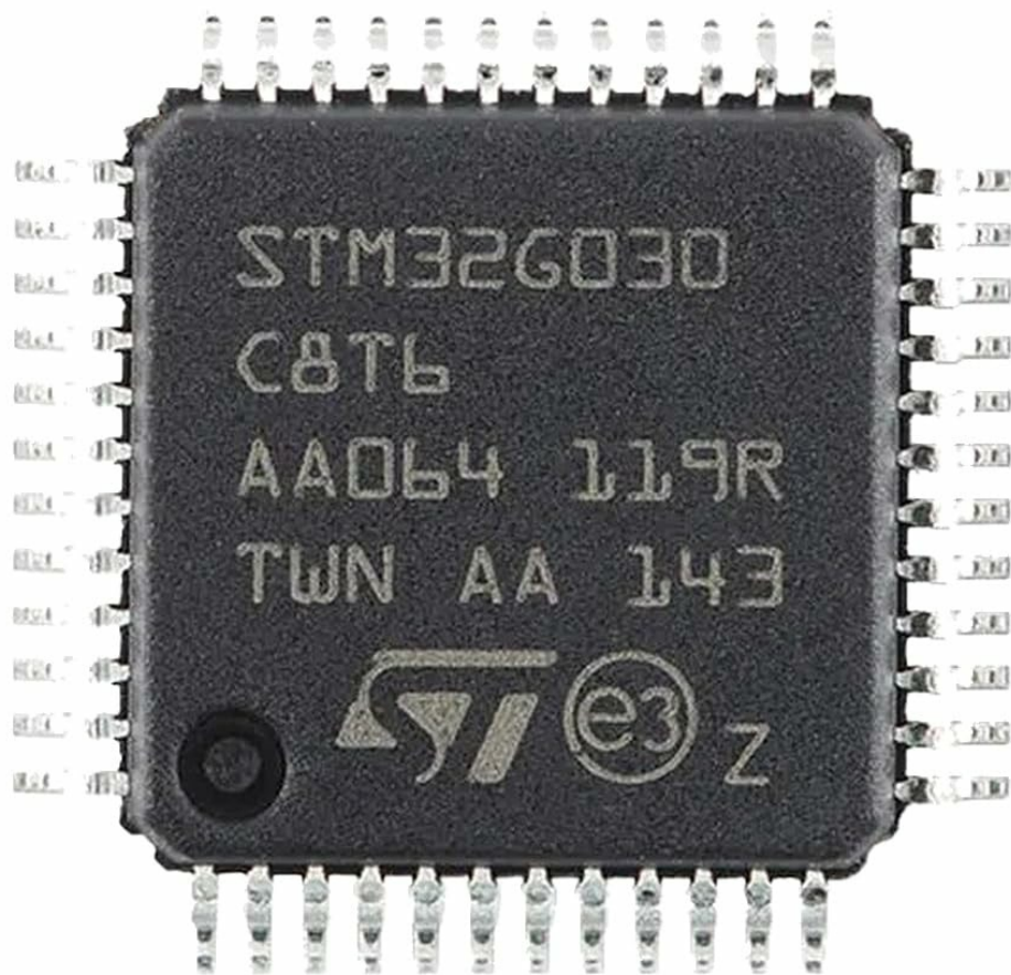
Figure 2.1: Close-up view of the STM32G030C8T6 microcontroller chip, showing its pin configuration and markings.