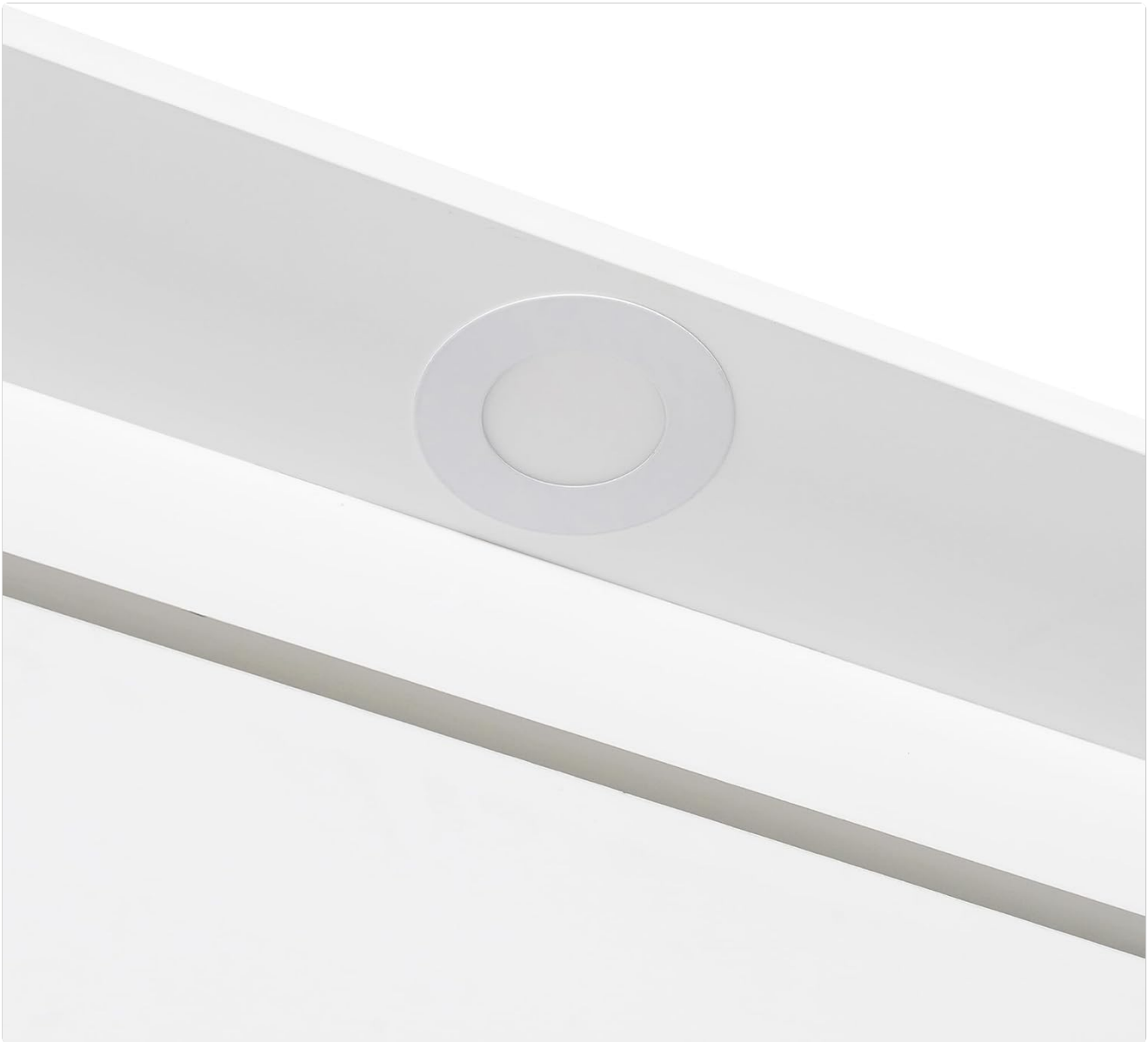
Detailed view of the lower storage cabinets, providing enclosed storage space.