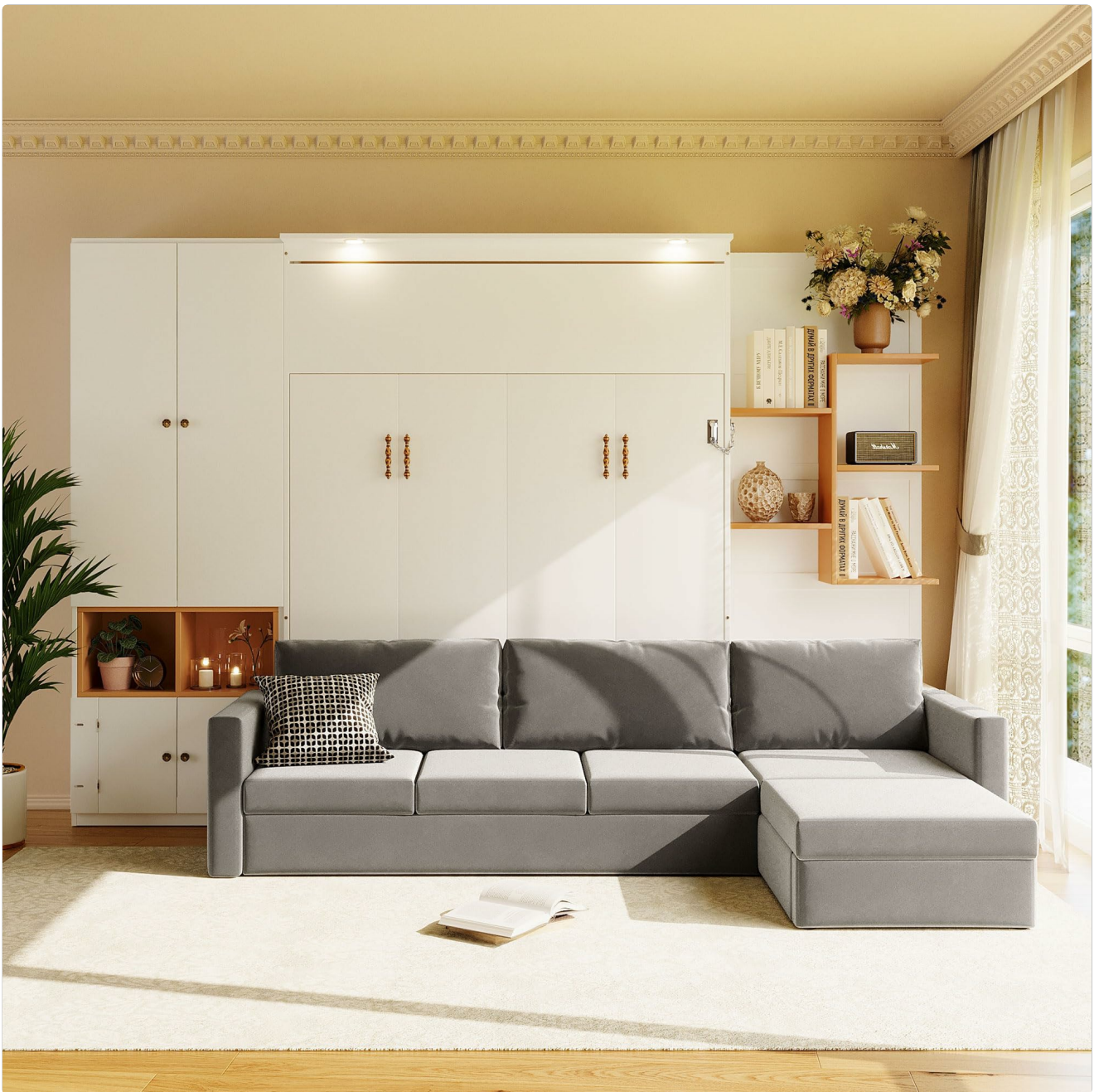
Overall view of the Merax Queen Size Murphy Bed with integrated sofa and storage units.