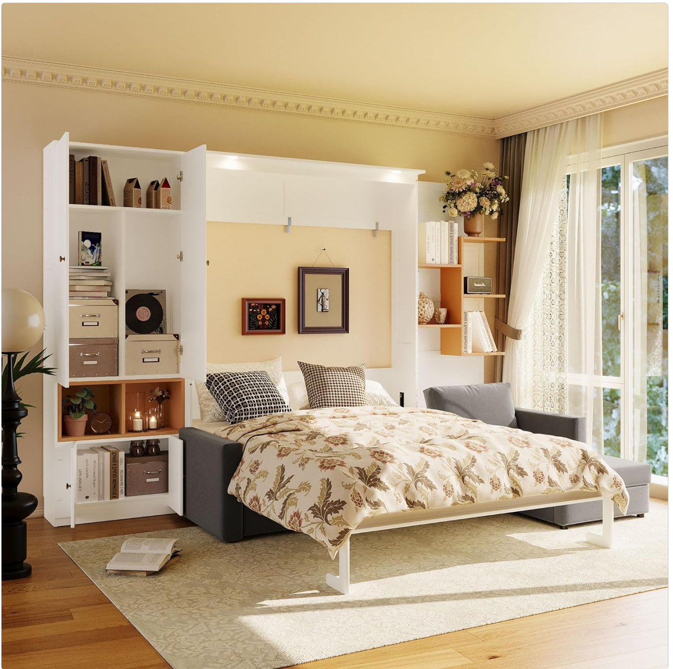
The Merax Murphy bed fully deployed with a mattress and bedding, ready for use.