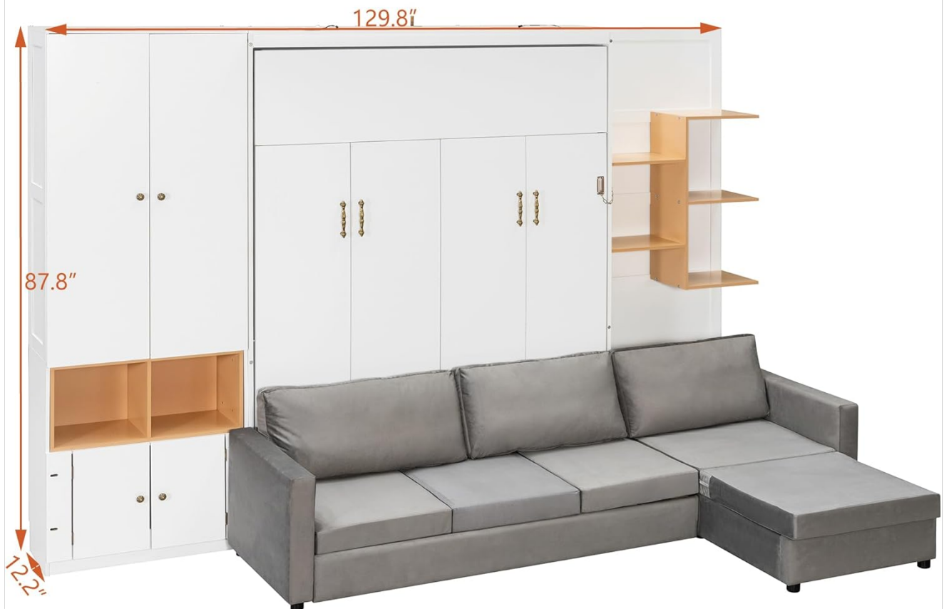
Image showing the overall dimensions of the Murphy bed unit: 129.8" width, 87.8" height, and 12.2" depth when closed.