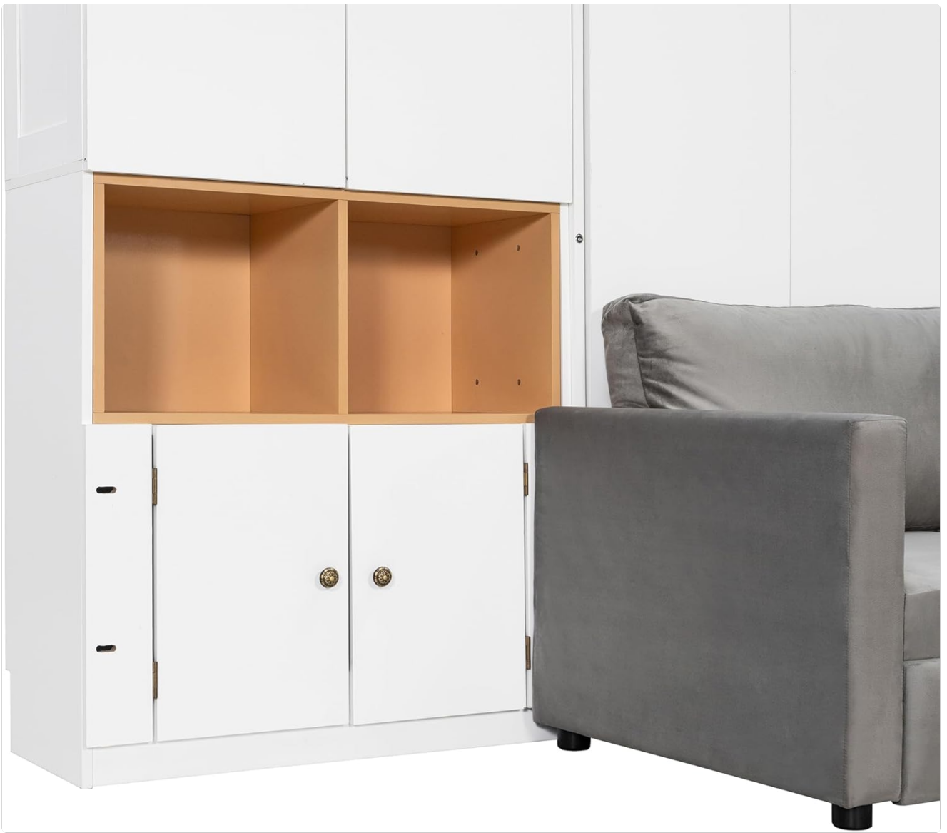
Detailed view of the open storage shelves, designed for books or decorative items.