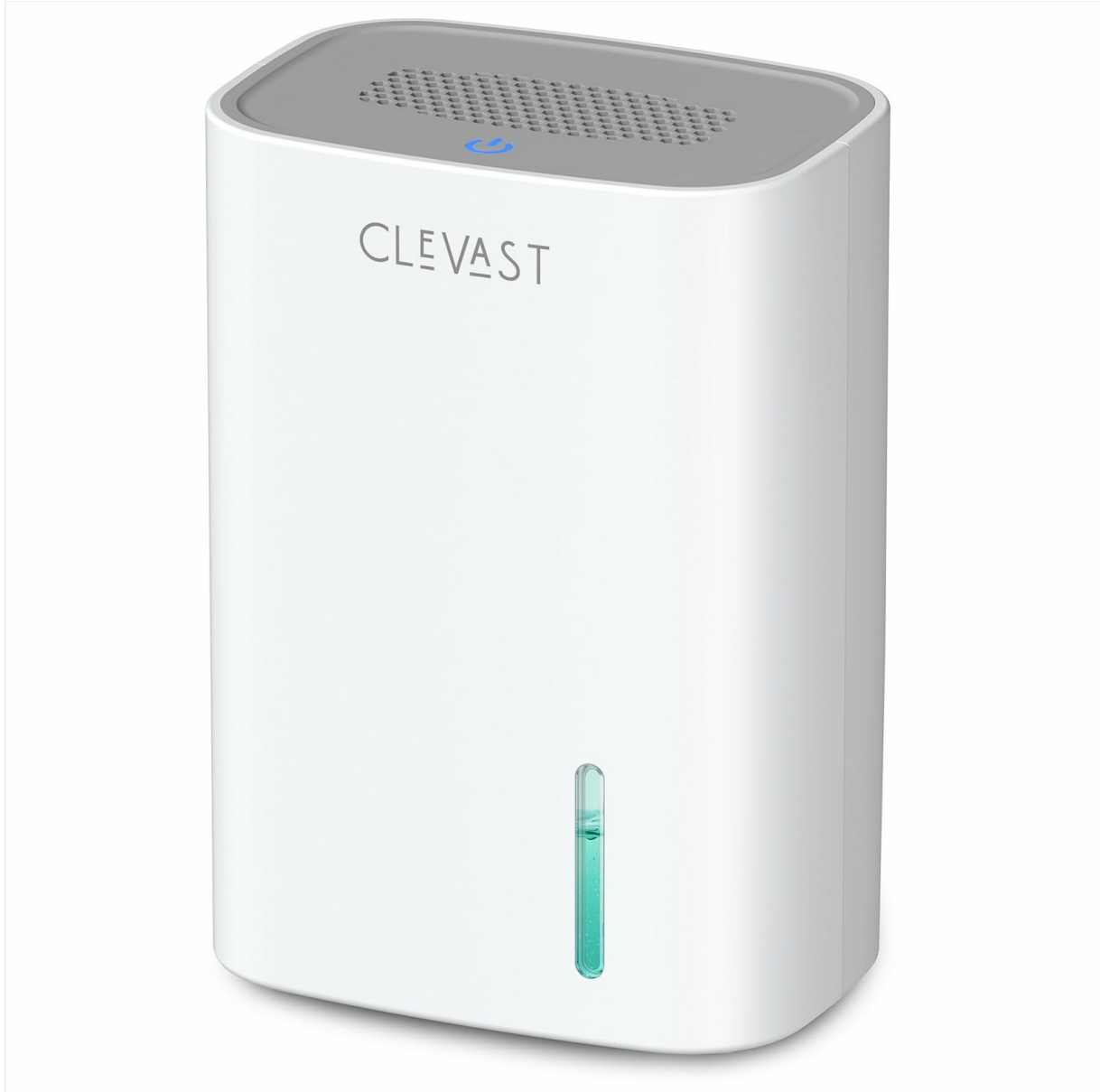
The top panel of the dehumidifier showing the power button and air vents.

The CLEVAST dehumidifier features simple one-button operation for ease of use.