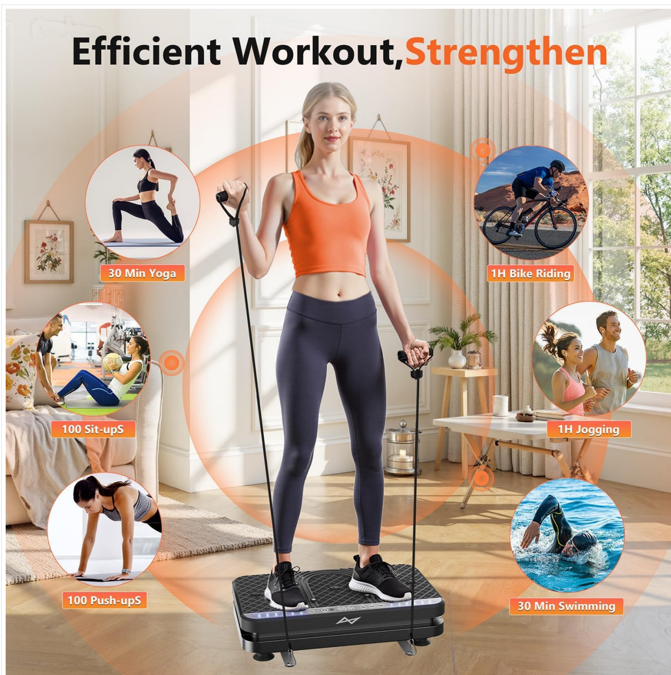
Image: The AXV ARK-6 Vibration Plate, showing the main unit, remote control, and two resistance bands.