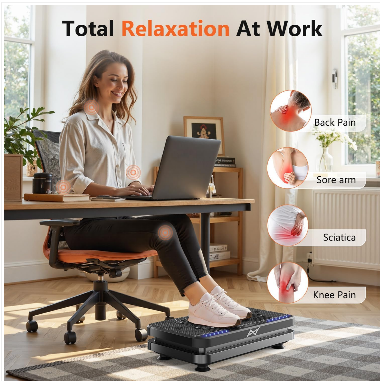
Image: A user utilizing the vibration plate while seated at a desk, demonstrating its use for relaxation and promoting circulation during work.

Image: A user demonstrating standing on the vibration plate with resistance bands, highlighting the versatility for different exercise types.