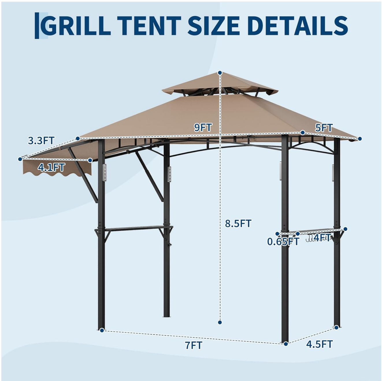
Figure 1: Grill Gazebo Dimensions for Setup Planning