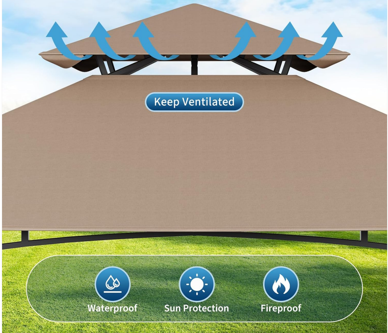
Figure 4: Double-Tier Canopy Ventilation