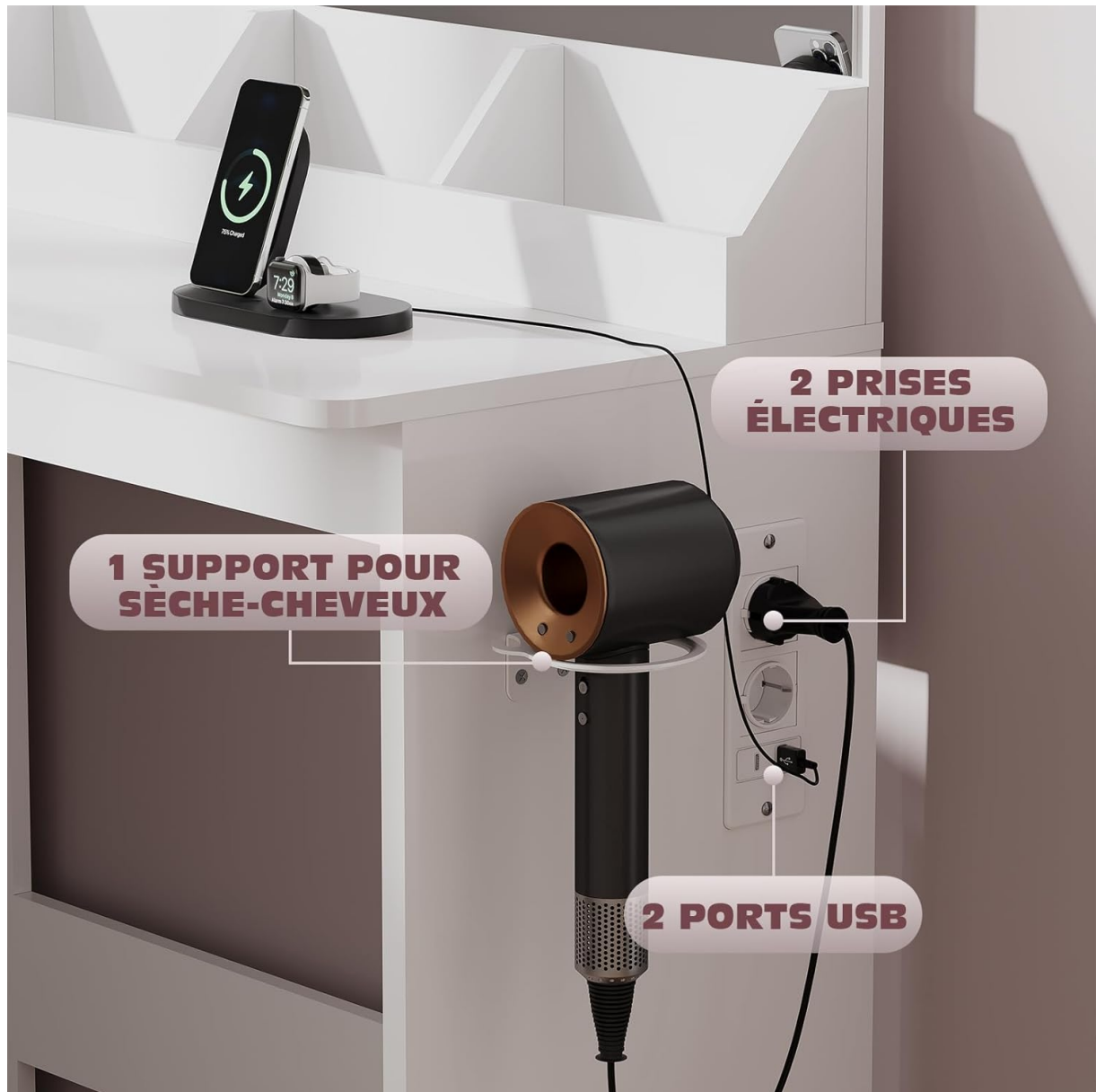
Image: Detail of the integrated power module, showing the electrical sockets, USB ports, and the hairdryer holder.

A dedicated hairdryer holder is also provided for organized storage and easy access.