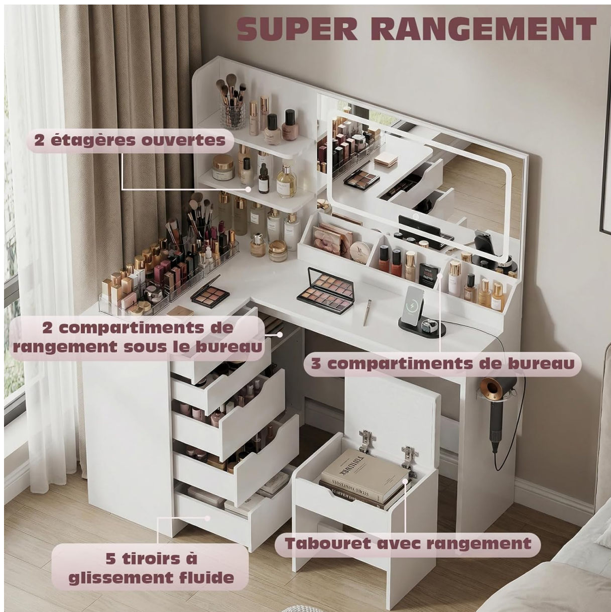
Image: An annotated view of the dressing table, pointing out the open shelves, desk compartments, five drawers, and the storage within the stool.