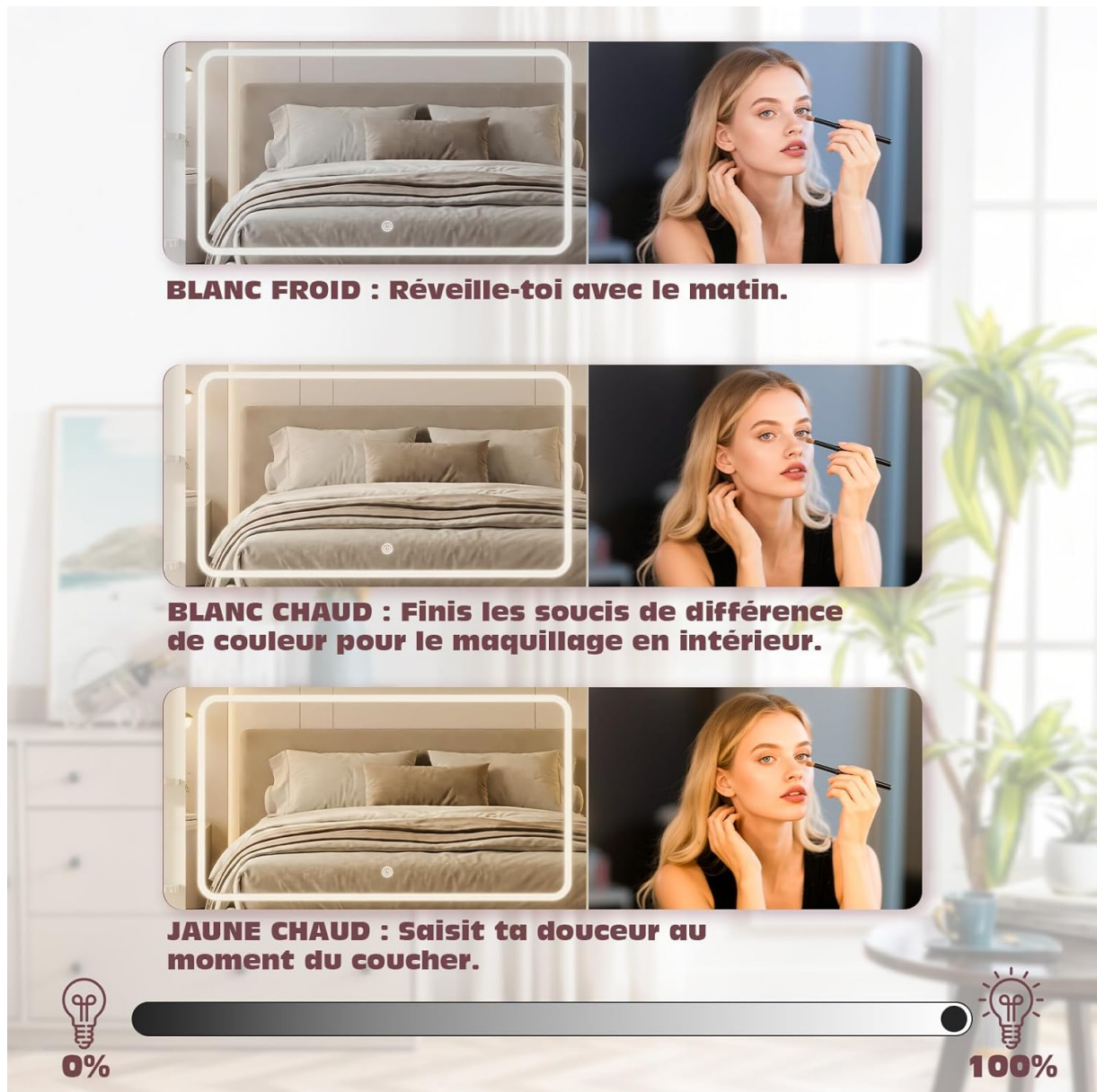
Image: Illustration of the LED mirror's three color temperature settings, demonstrating their effect on appearance.

To switch between modes and adjust brightness, use the touch controls located on the mirror surface. A short press typically cycles through color modes, while a long press adjusts brightness within the selected mode.