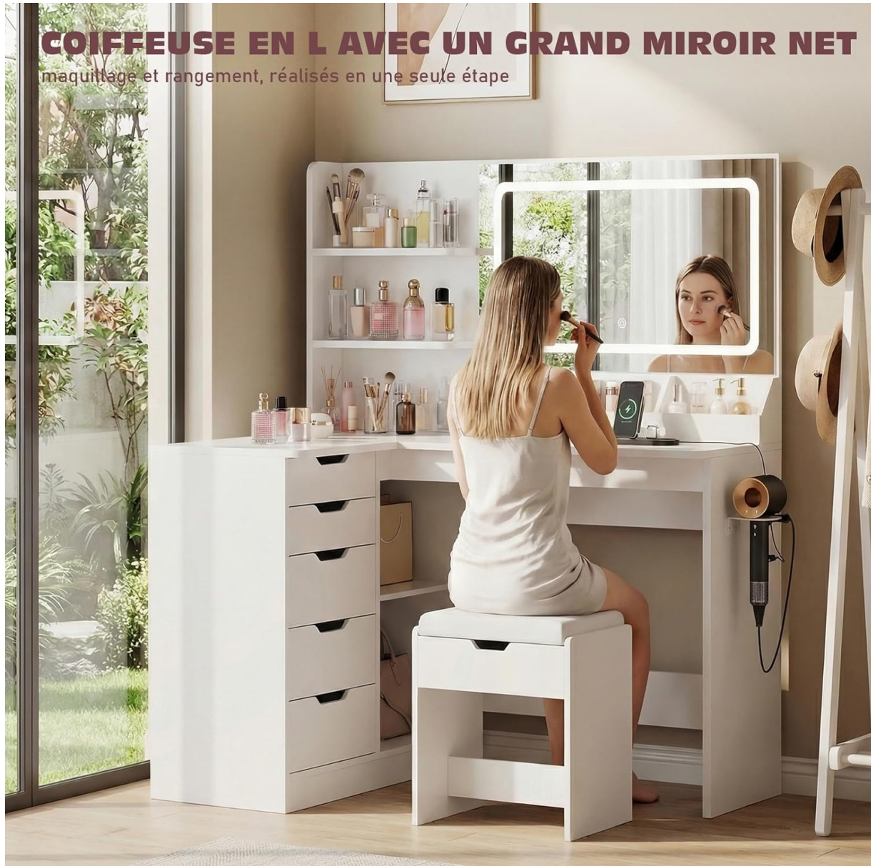
Image: The fully assembled JUMMICO Corner Dressing Table, showing the L-shaped design, LED mirror, and accompanying stool.

The JUMMICO Corner Dressing Table requires assembly. Follow the detailed instructions provided in the separate assembly guide included with your product. All parts are typically numbered for easy identification. Assembly usually takes approximately 3 hours.