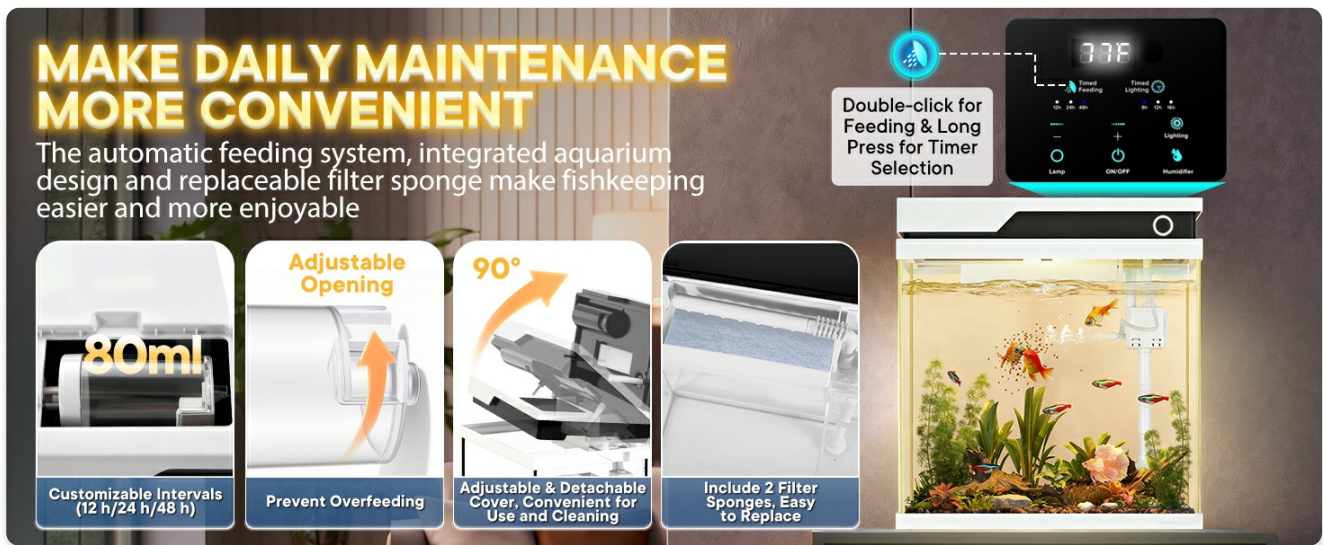
Image: Maintenance features for easy cleaning.