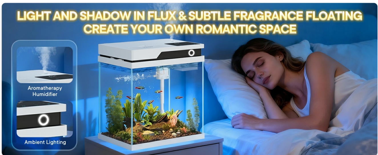
Image: Humidifier and aromatherapy feature.