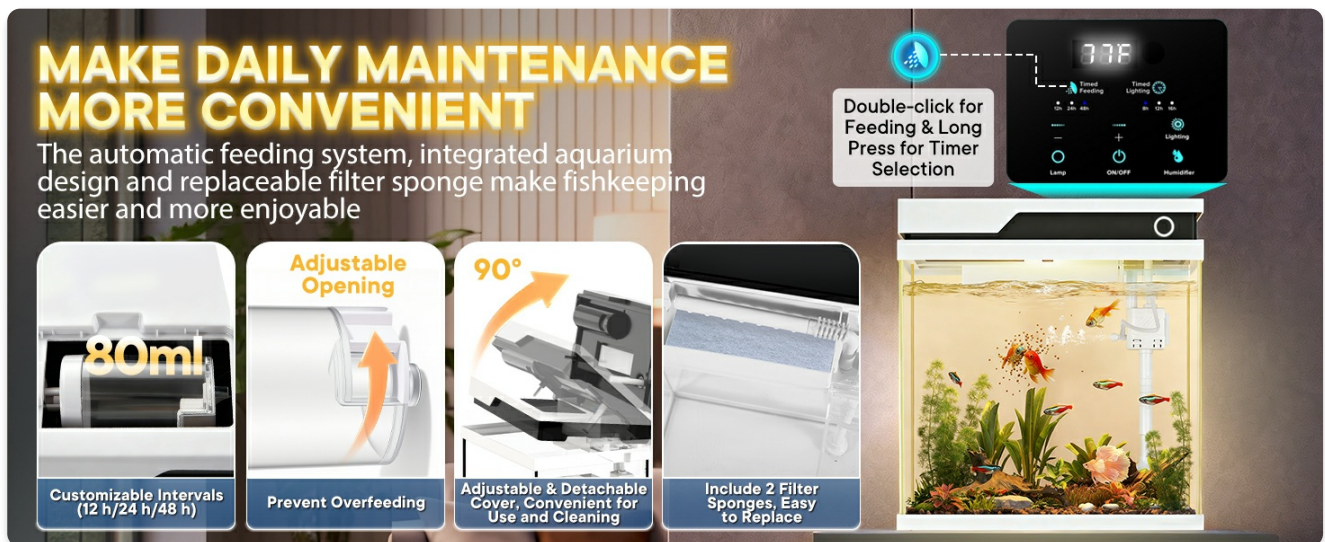
Image: Control panel and auto-feeder details for timed feeding.