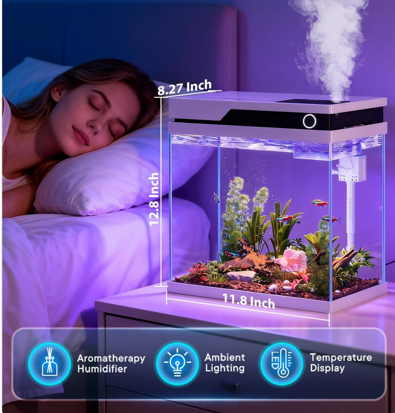
Image: Product dimensions and humidifier feature.