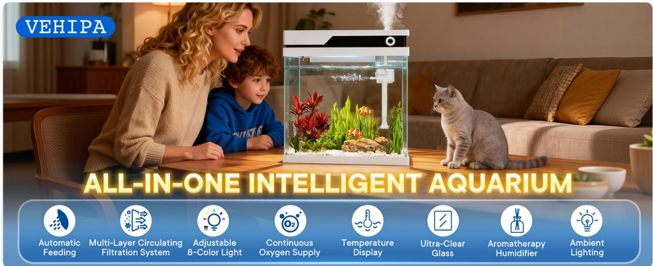
Image: Overview of the aquarium's multi-functional capabilities.