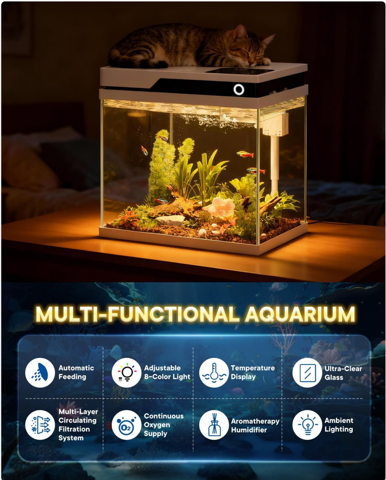
Image: The Vehipa Smart Fish Aquarium Kit, highlighting its compact design and integrated features.