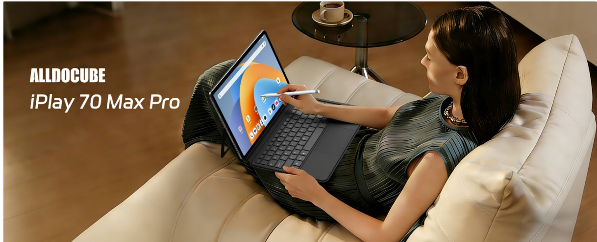
Image: 13-inch 2.5K IPS display.