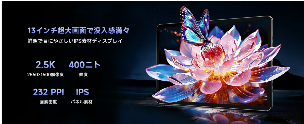
Image: ALLDOCUBE OS 5.0 L features.