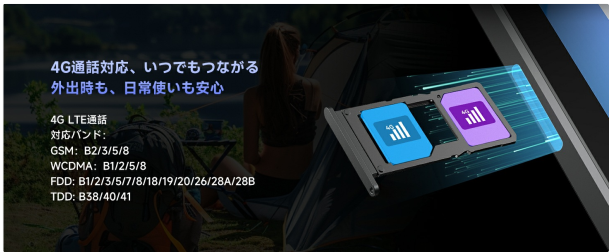
Image: Wireless connectivity features.