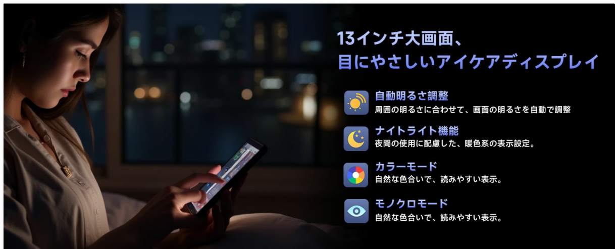
Image: Eye care display features.

The tablet includes an Eye Care Mode and automatic brightness adjustment to reduce eye strain during prolonged use. These features can be configured in the display settings.