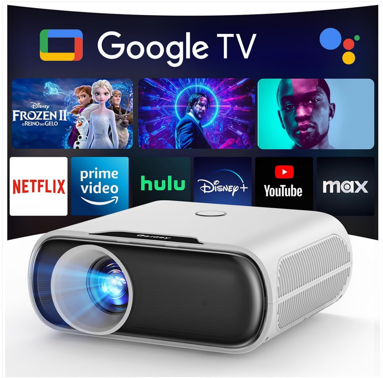
Image: Goiaey C26 Smart Projector, front view showing the lens and ventilation.

The Goiaey C26 is a compact and versatile smart projector designed for various entertainment needs. It features a native 1080P resolution, 4K support, integrated Google TV system, Wi-Fi 6, and Google Voice Assistant.