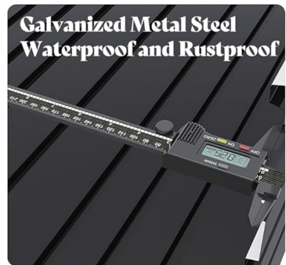
Galvanized Metal Steel Waterproof and Rustproof

This image focuses on key product details such as the four-pane windows for light, gable vents for airflow, and the secure, pad-lockable door.