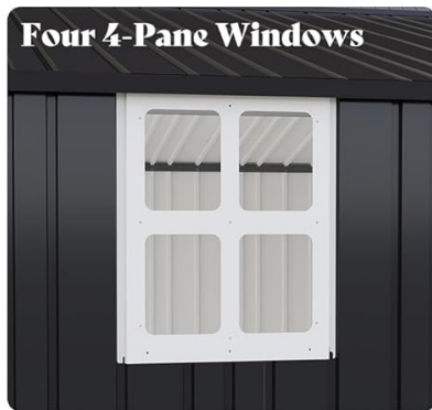
Four 4-Pane Windows