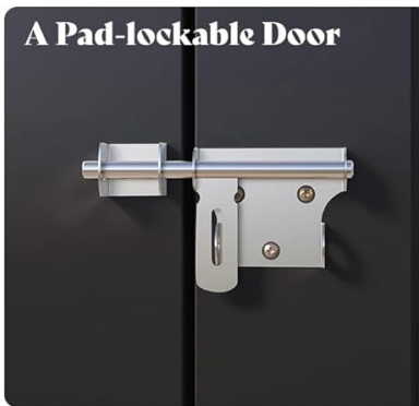
A Pad-lockable Door