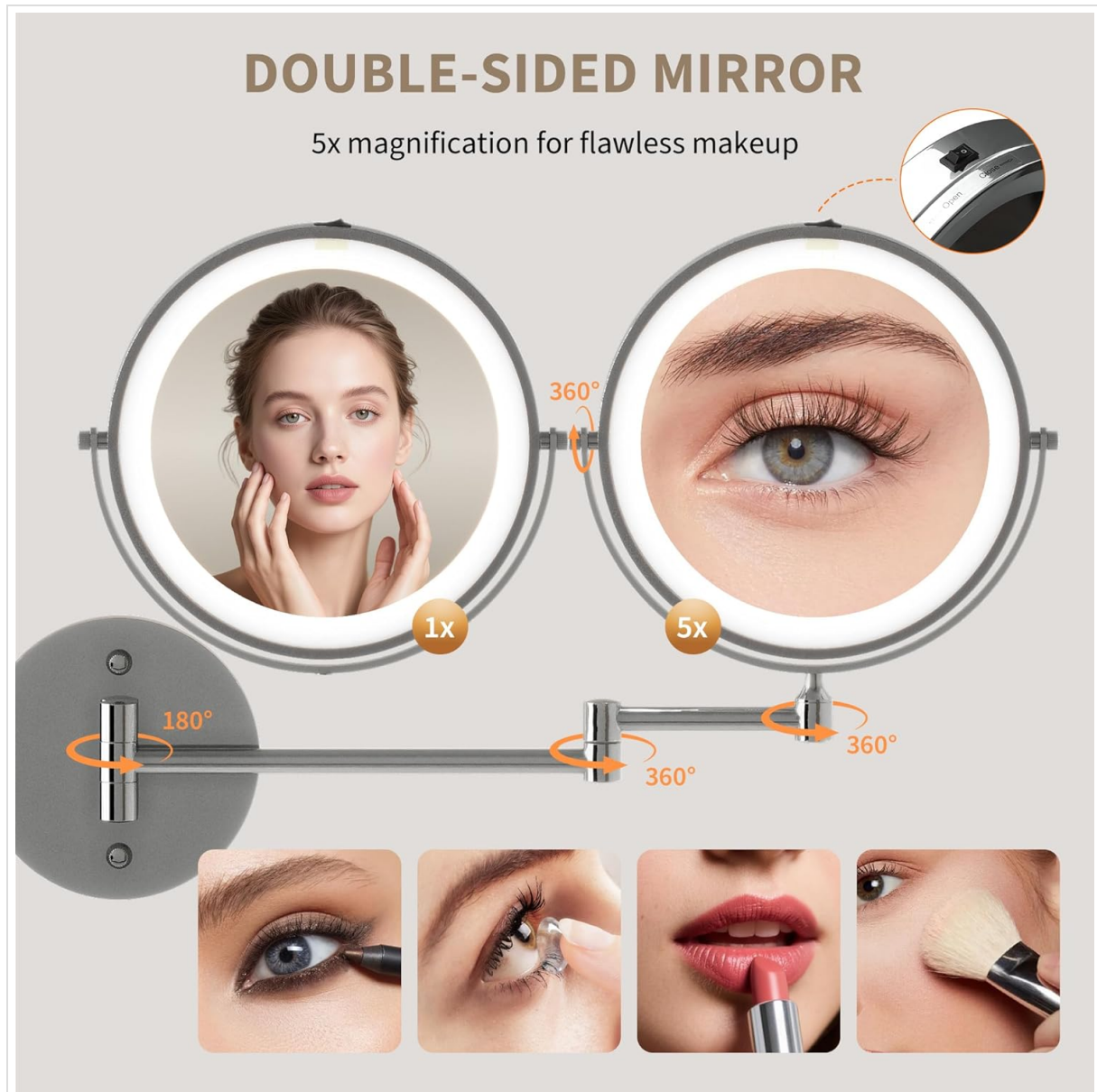
Image: Close-up of the double-sided magnifying mirror, highlighting its 1x and 5x magnification and adjustable arm.