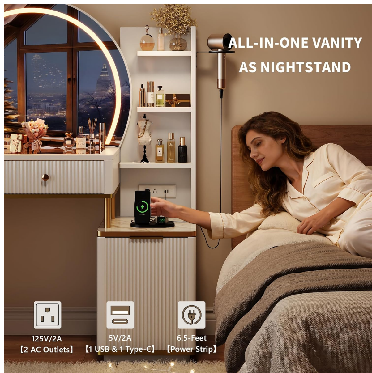
Image: The vanity desk functioning as a nightstand, showcasing the built-in charging station with AC and USB outlets.