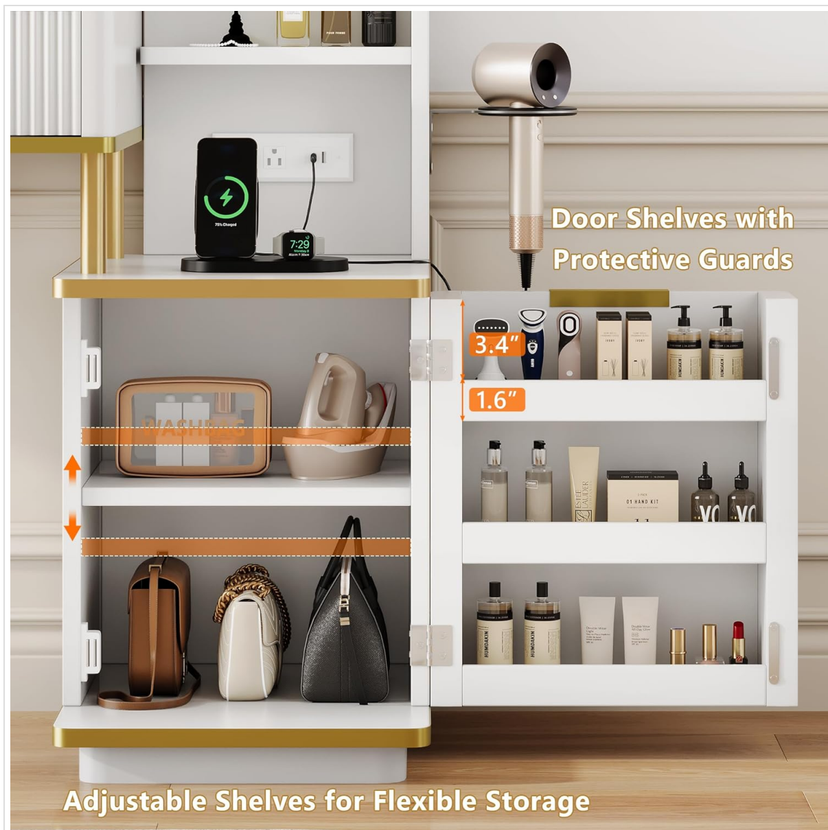
Image: The side cabinet with adjustable shelves and door storage, demonstrating its capacity for various beauty items and accessories.