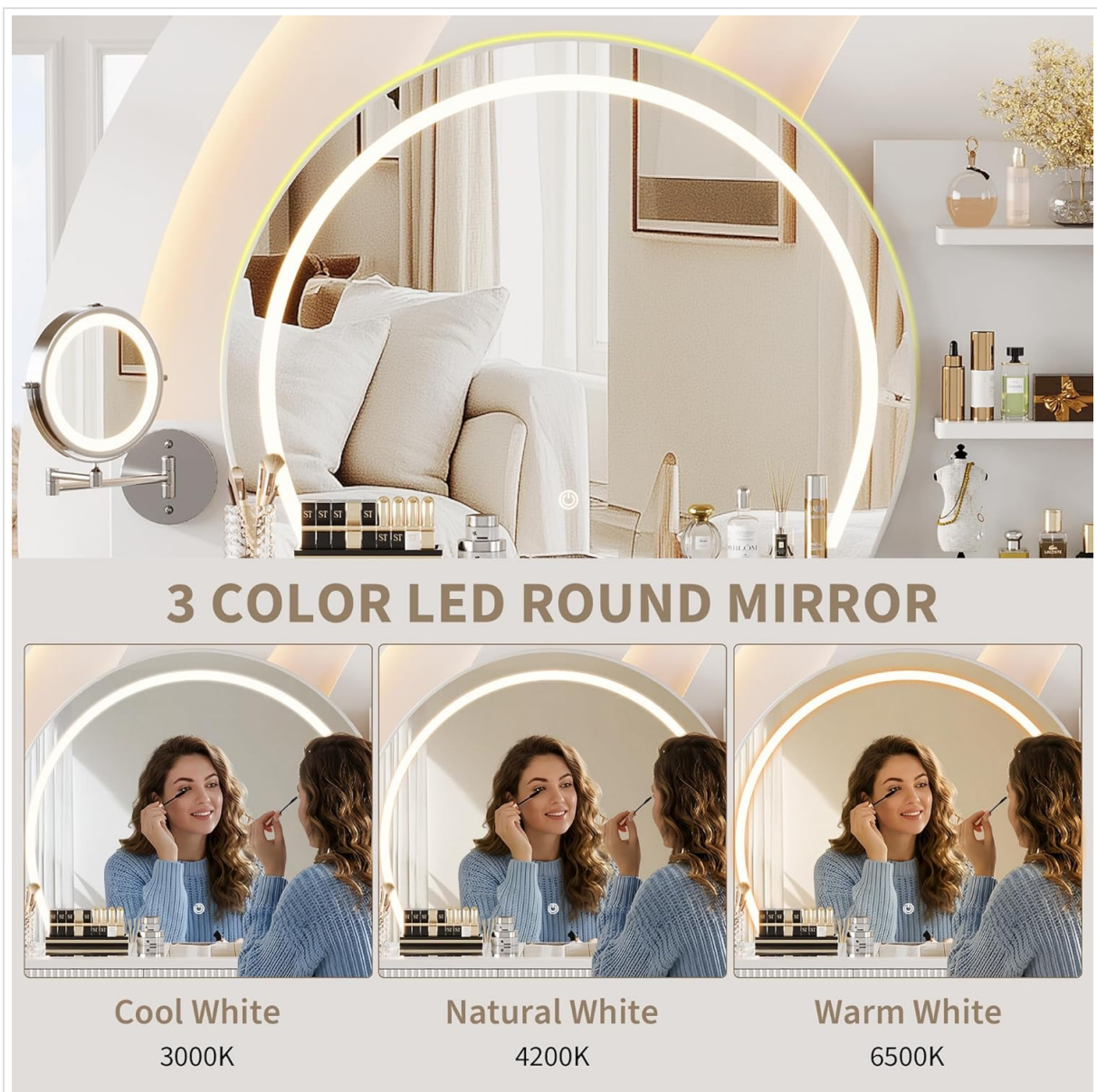
Image: Illustration of the three adjustable light modes (Cool White, Natural White, Warm White) available on the LED mirror.