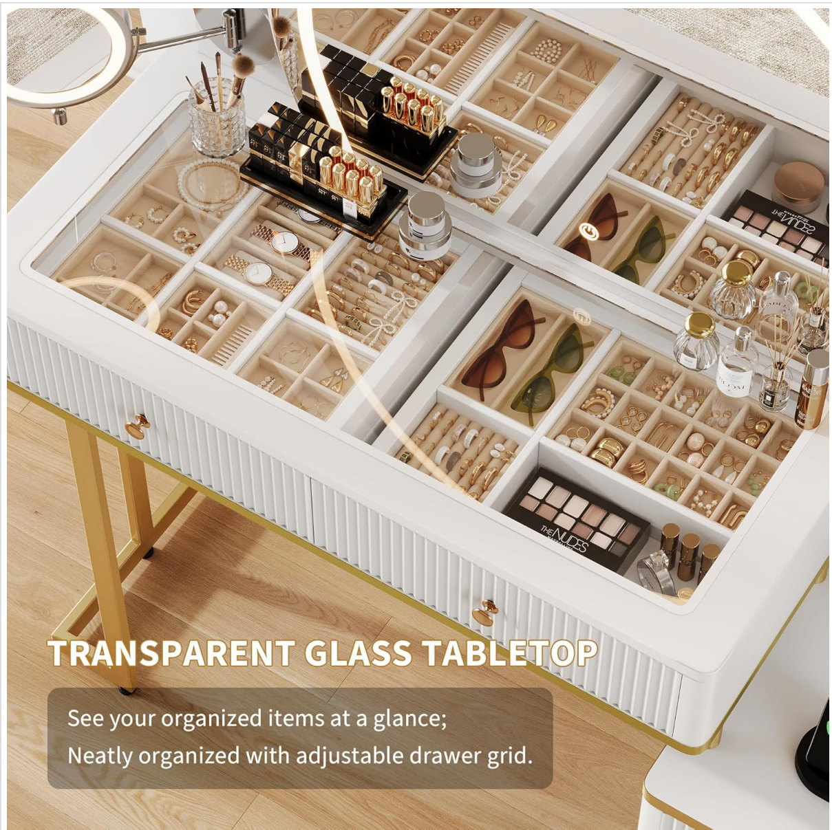
Image: A close-up of the transparent glass tabletop, showing organized compartments within the drawers for various items.