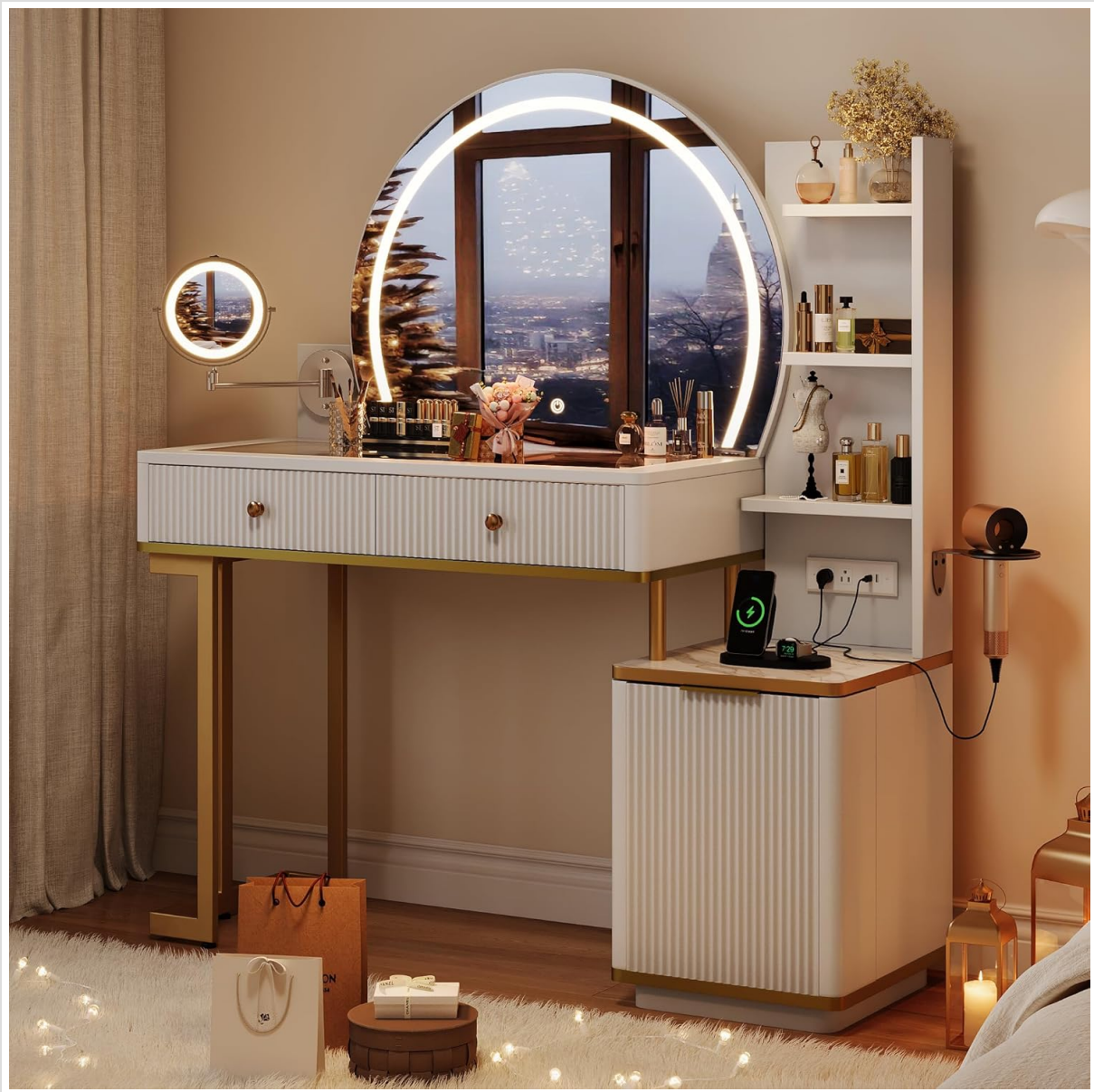
Image: Full view of the iPormis White Makeup Vanity Desk with its round mirror, storage, and gold accents.