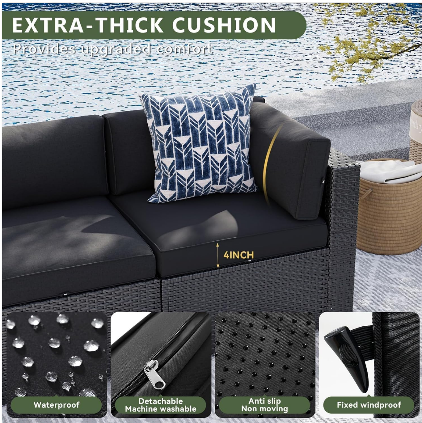
Figure 5.1: Extra-Thick Cushion Features

This image details the comfort and practical features of the cushions, including their thickness, waterproof fabric, and anti-slip design.