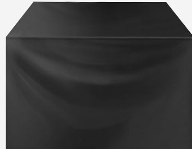
1x Waterproof Cover