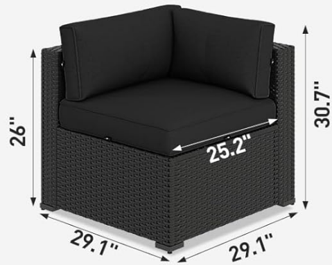
2 x Corner Sofa