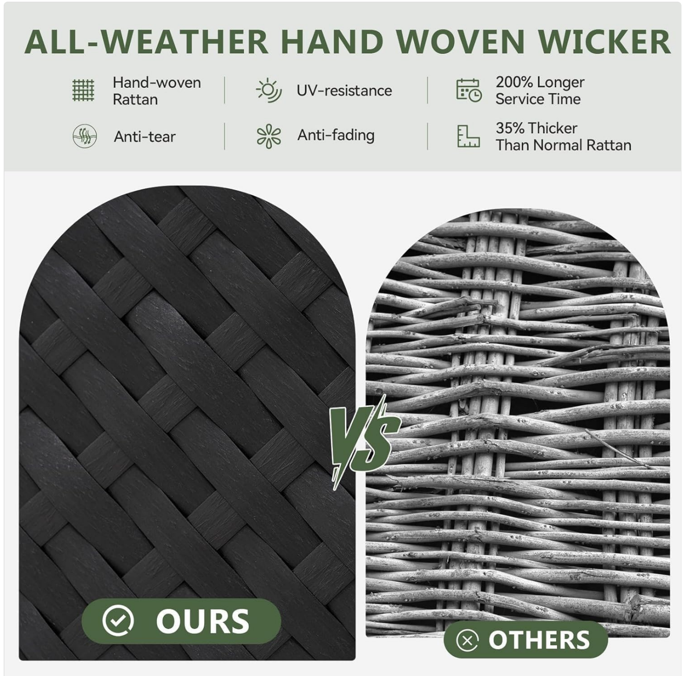
Figure 6.1: All-Weather Hand Woven Wicker

The hand-woven PVC rattan is UV-resistant and designed for all-weather durability. To clean, wipe with a damp cloth and mild soap. Avoid harsh chemicals or abrasive cleaners.