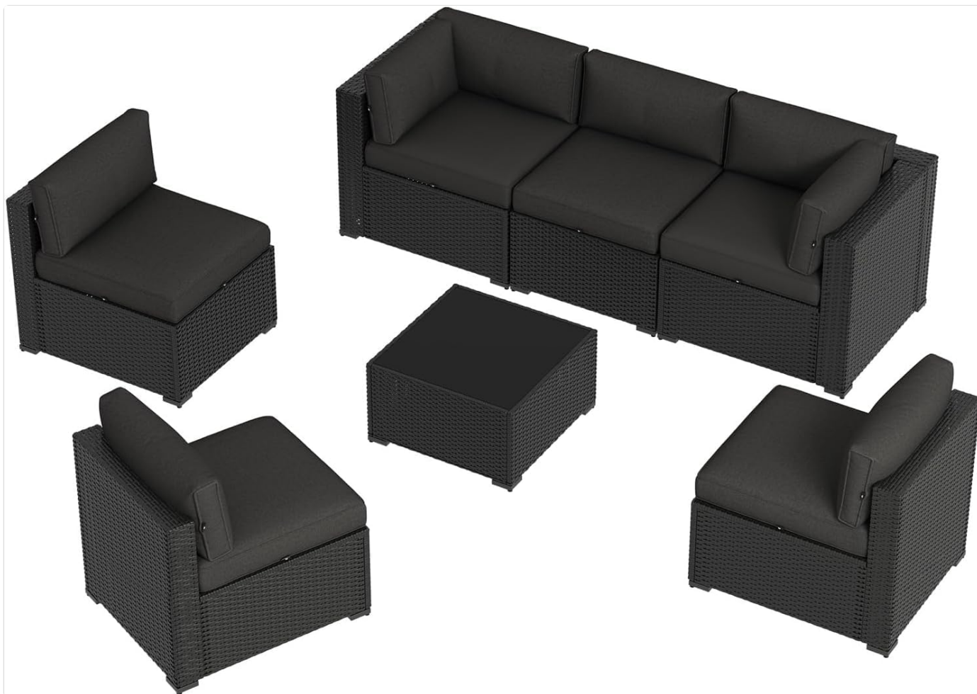
Figure 4.1: Individual Furniture Components

This image shows the various components of the 7-piece set from an aerial perspective, aiding in identification during assembly.