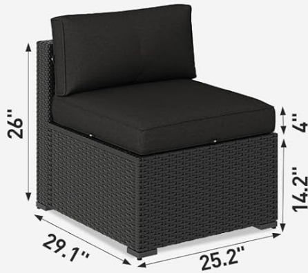
4 x Armless Sofa