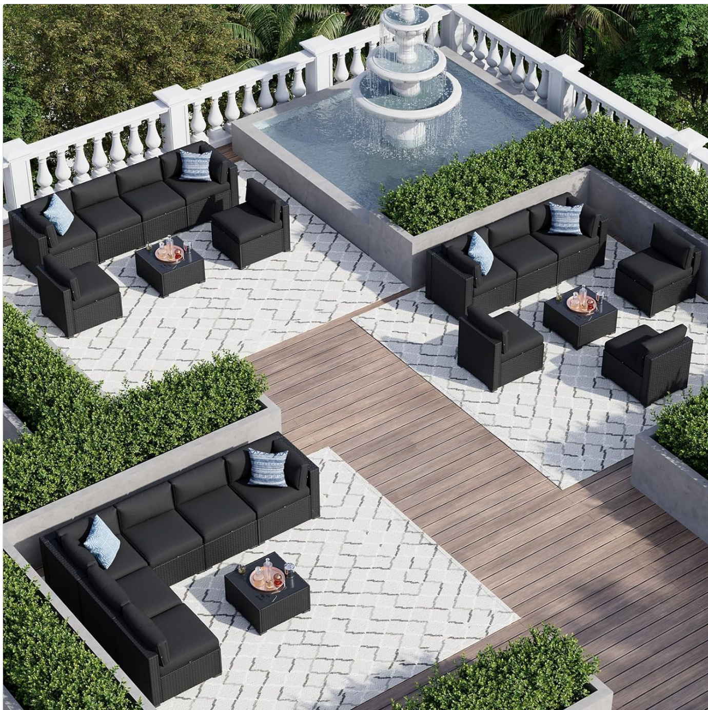
Figure 4.2: Customizable Configurations

The diagram above demonstrates various ways the modular pieces can be combined to create different seating arrangements, such as L-shaped sofas or individual seating areas.