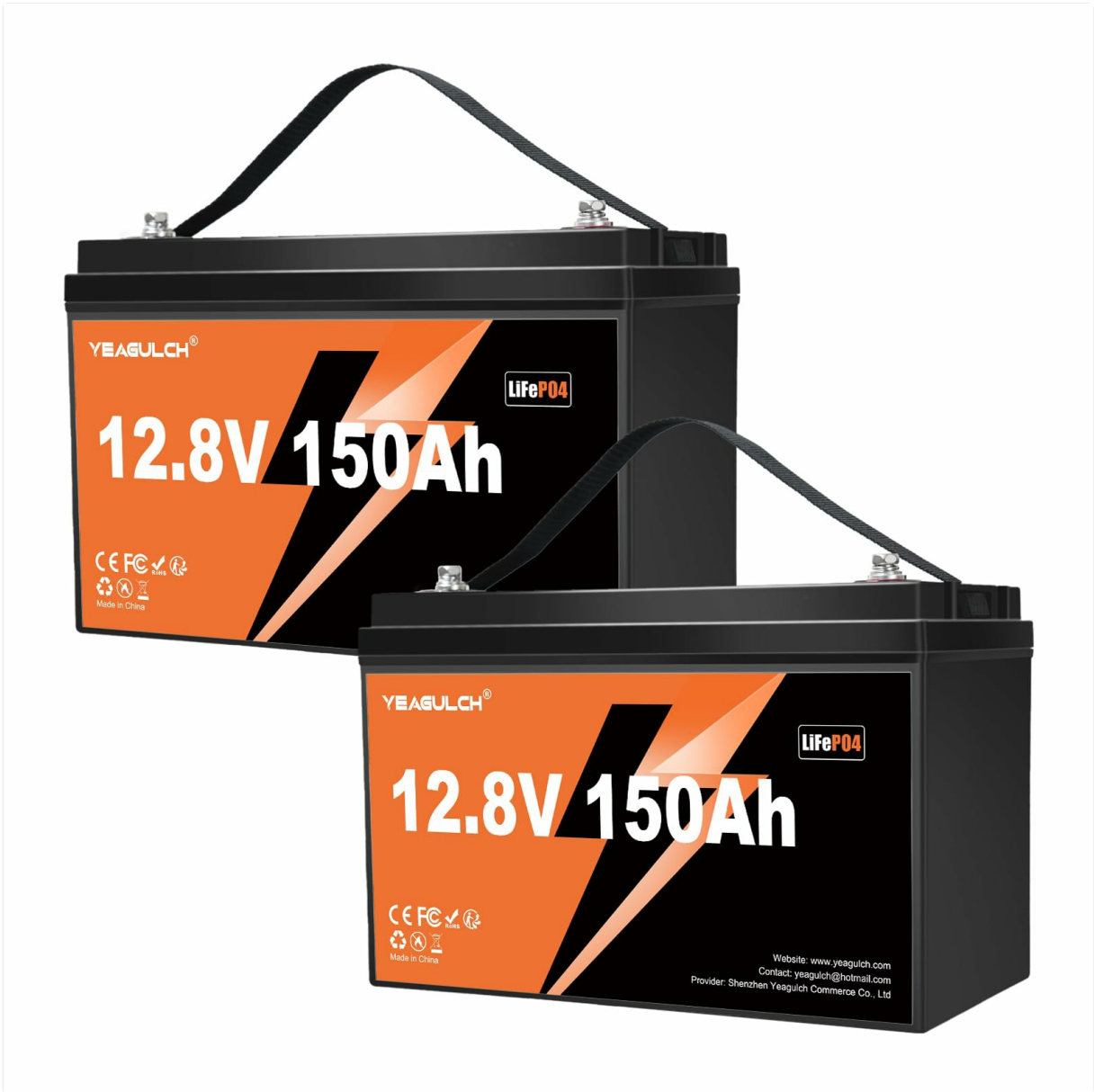
Figure 3.1: yeagulch 12.8V 150Ah LiFePO4 Lithium Battery.