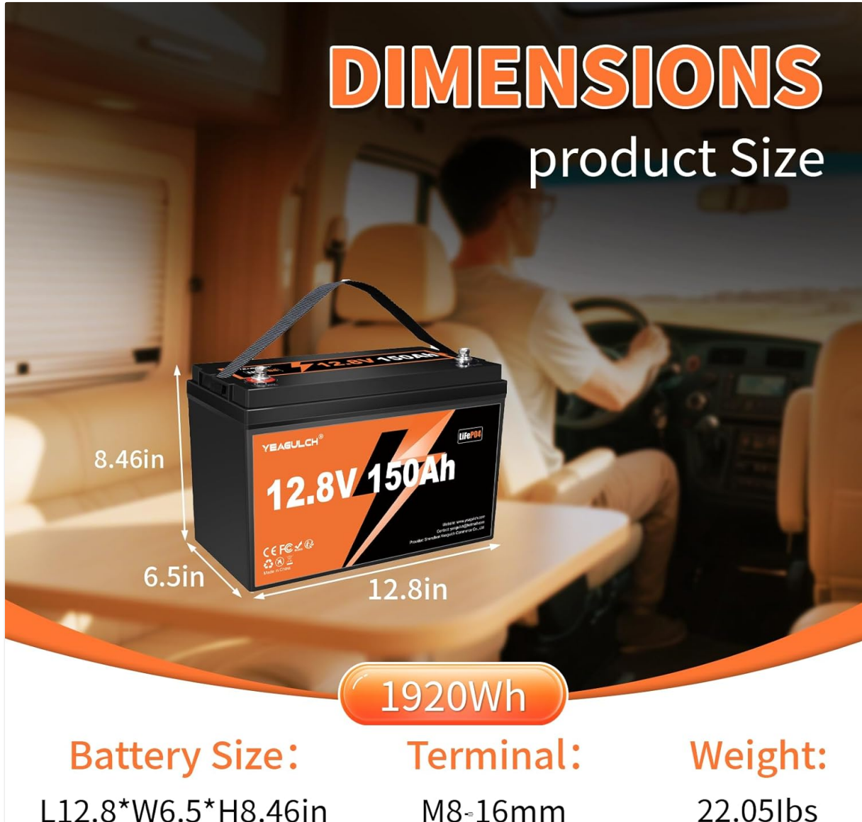
Figure 4.1: Battery dimensions and specifications.

The battery's reference dimensions are 33.2 cm (13.07 in) x 22 cm (8.66 in) x 17.2 cm (6.77 in) (L x W x H). It weighs approximately 12.99 kg (28.64 lbs). The terminals are M8-16mm.