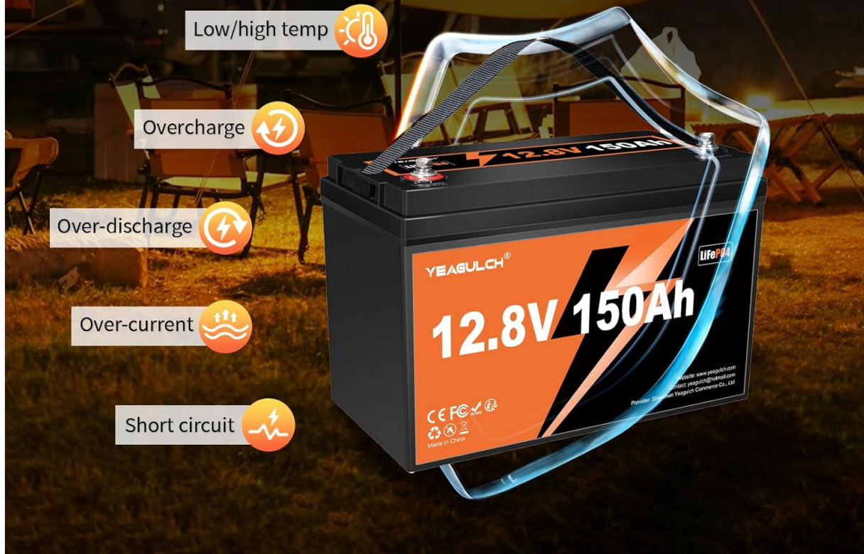
Figure 2.1: Built-in Battery Management System (BMS) protections. The BMS safeguards against various electrical issues, ensuring safe operation.

Unleash reliable power with multiple layers of protection