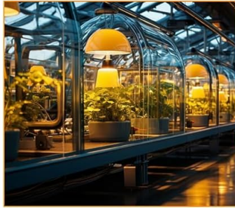
Independent Power System