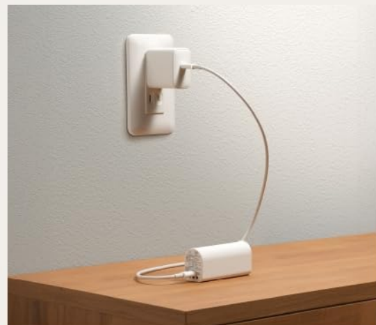
Figure 5.1: Battery insertion, removal, and charging methods.