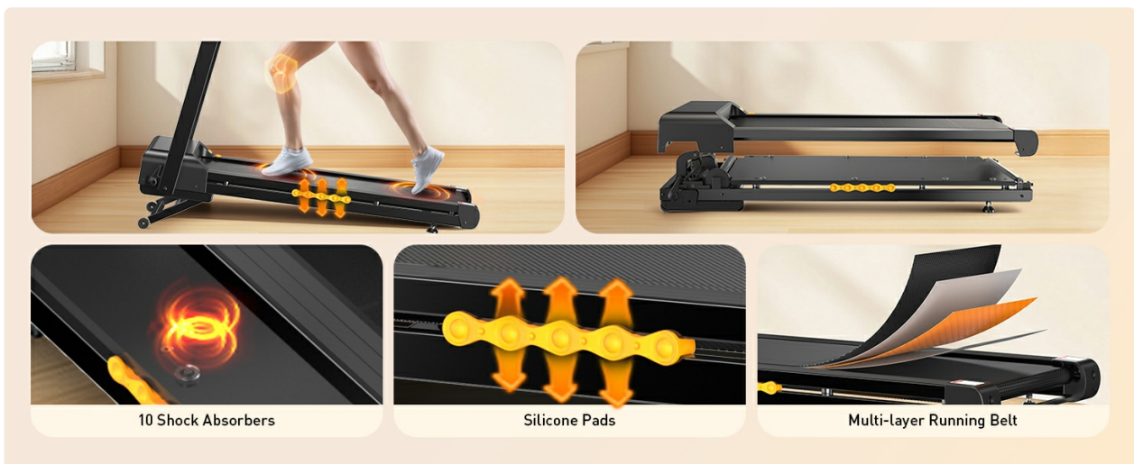
Figure 4: The treadmill folds compactly for easy storage.

To fold the treadmill for space-saving storage, simply release the quick-release knob at the base of the handles, lower the console and handrails, and then fold the running deck upwards. The built-in wheels allow for easy movement and storage under a bed or in a closet.