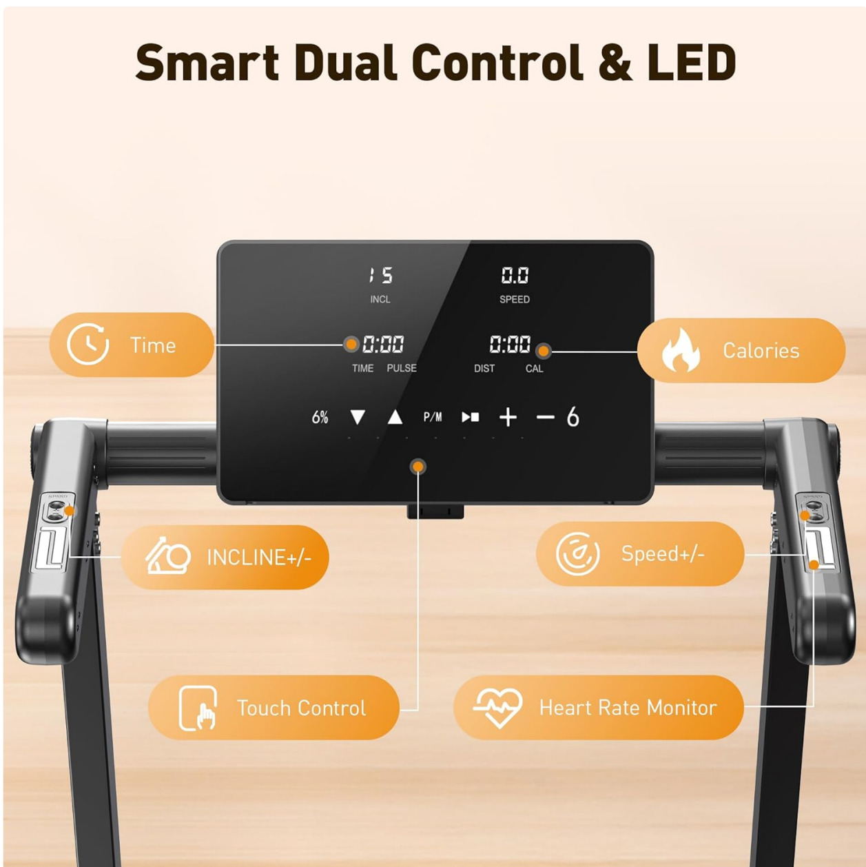
Figure 5: Smart Dual Control & LED Touchscreen.