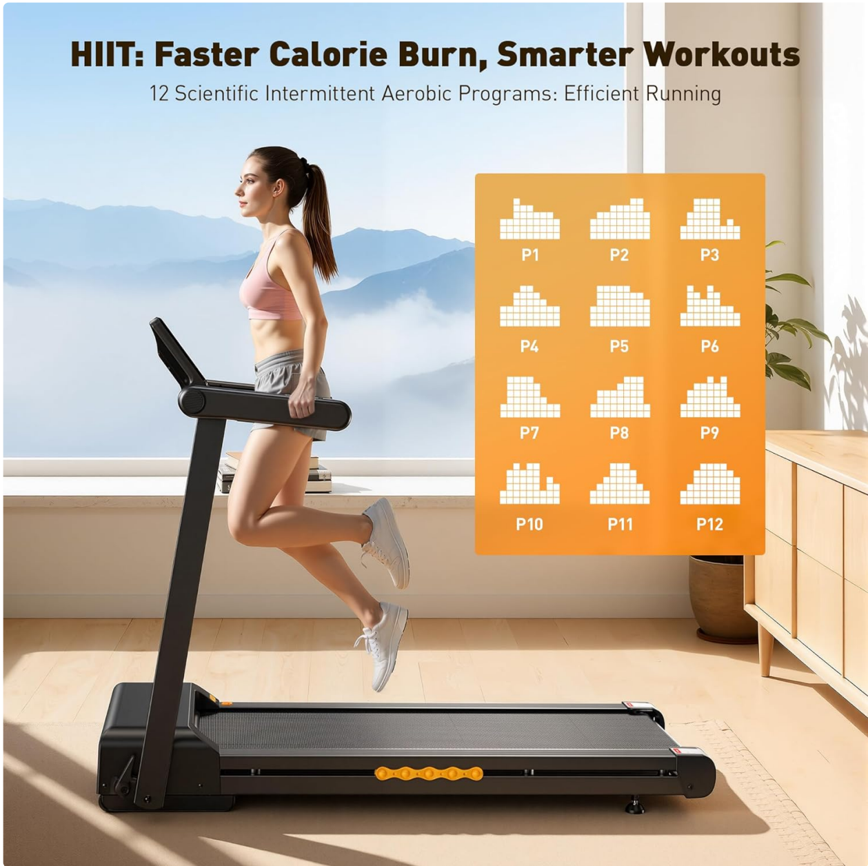
Figure 6: 12 HIIT Programs for faster calorie burn and smarter workouts.