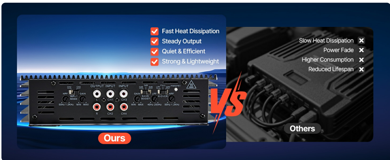
Image: Amplifier's rear panel detailing input, output, and control connections.