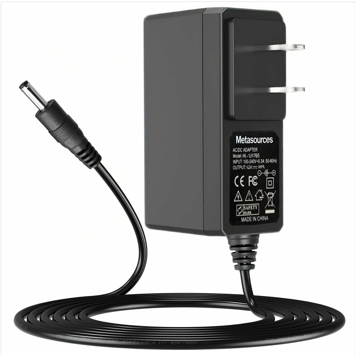
Image: The Metasources AC/DC Adapter, showing the main unit, power cord, and barrel round connector.