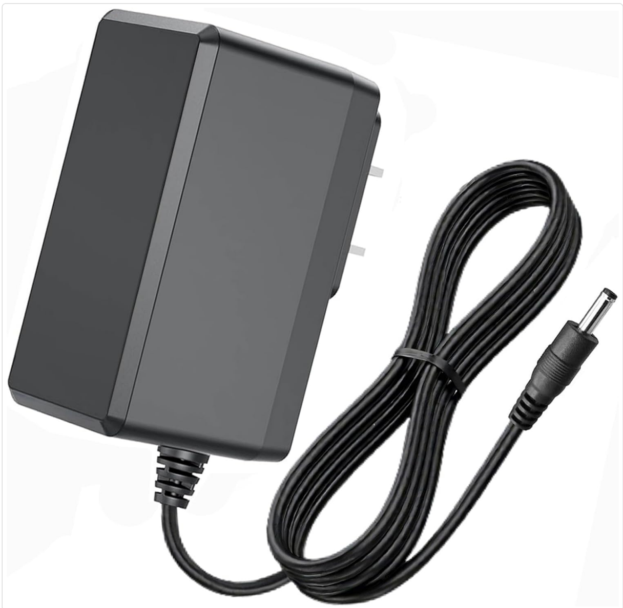
Image: The AC/DC adapter showing the barrel connector, ready for connection to a device.