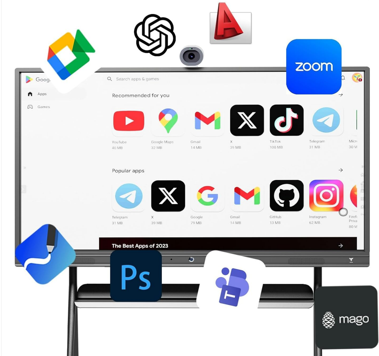
Image: The TIBURN HQ Board displaying its Android 13 home screen with various applications.