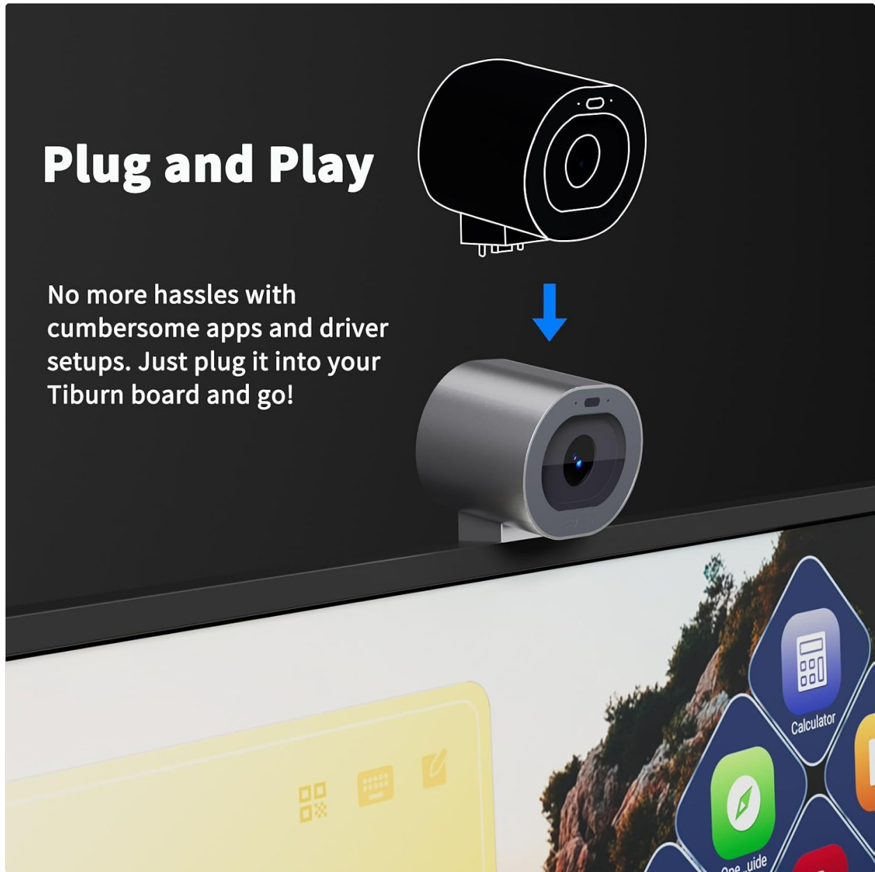
Image: The TIBURN HQ Board 75" R3, showcasing its large display and sleek design.

The TIBURN HQ Board 75" R3 is a 4K Smart Board designed for hybrid work and classroom environments. It features an Android 13 operating system, a high-performance A7 CPU, and 128GB SSD for a responsive user experience. The integrated 4K auto-framing webcam enhances video conferencing and interactive presentations.