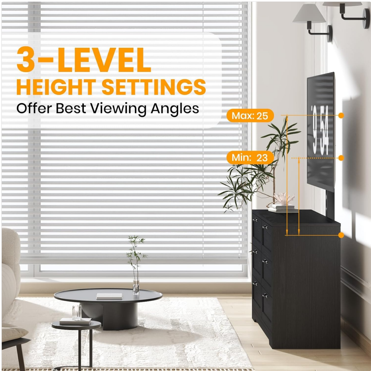
Figure 3: Demonstrating the 3-level height adjustment for optimal viewing.