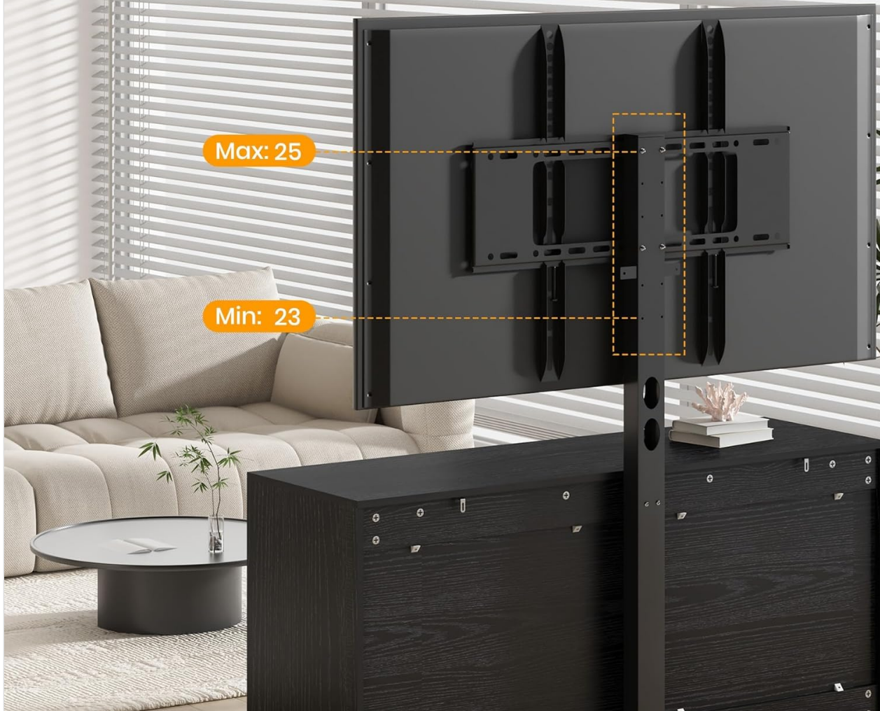
Figure 2: Detail of the TV mount bracket and reinforced crossbars.