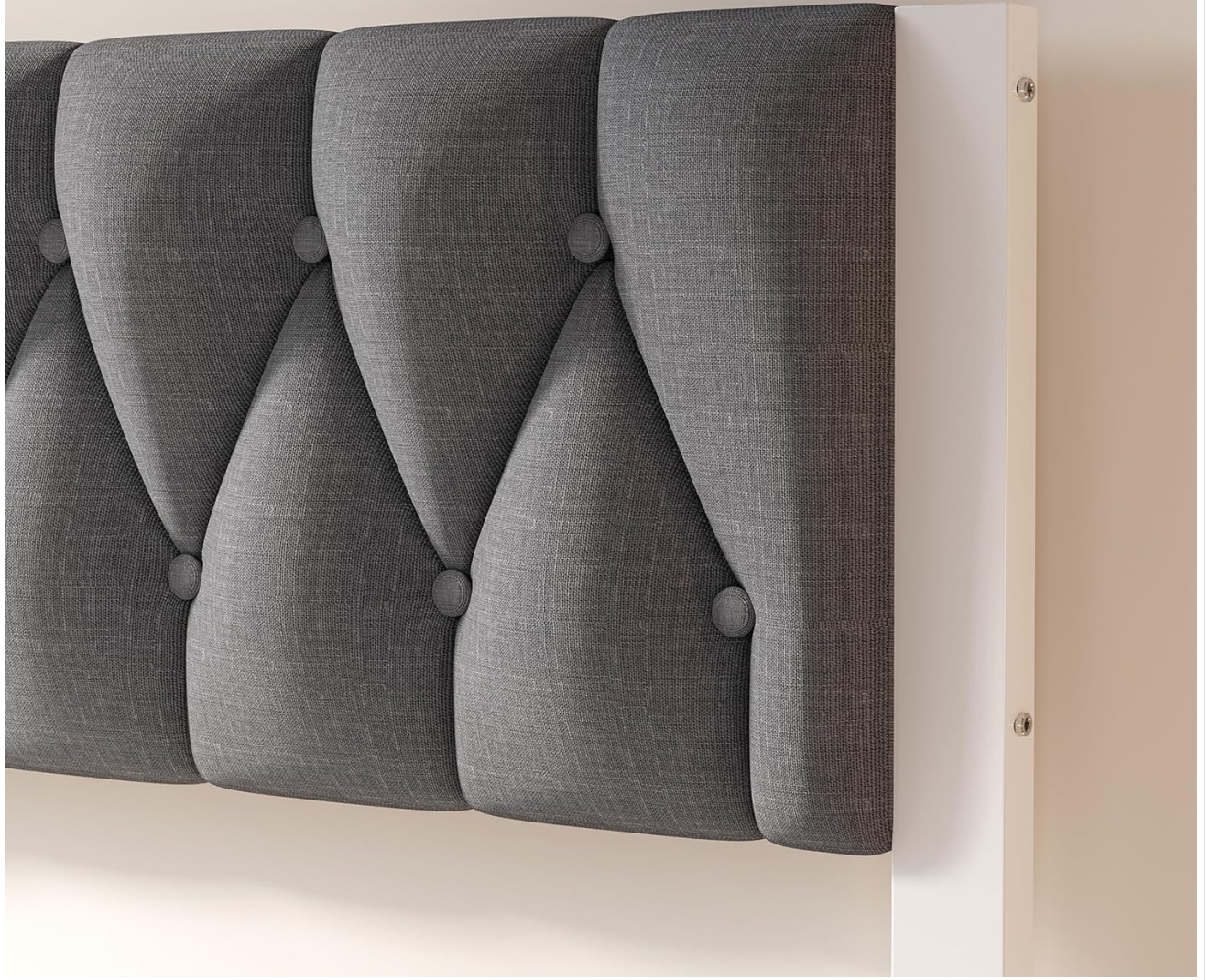
Image: Tufted Headboard Design. A close-up view of the classic button-tufted headboard, highlighting the linen-like fabric and plush padding.