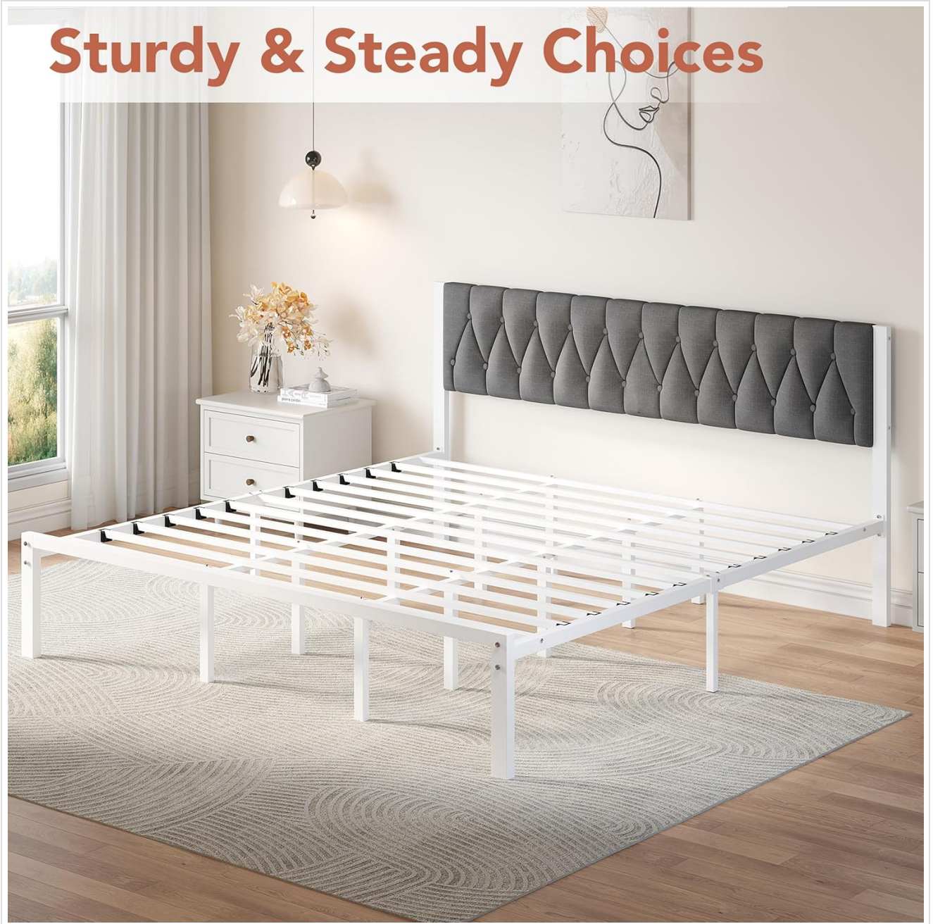
Image: Sturdy Metal Slat System. The fully assembled metal frame without a mattress, demonstrating the robust all-metal slat support system.