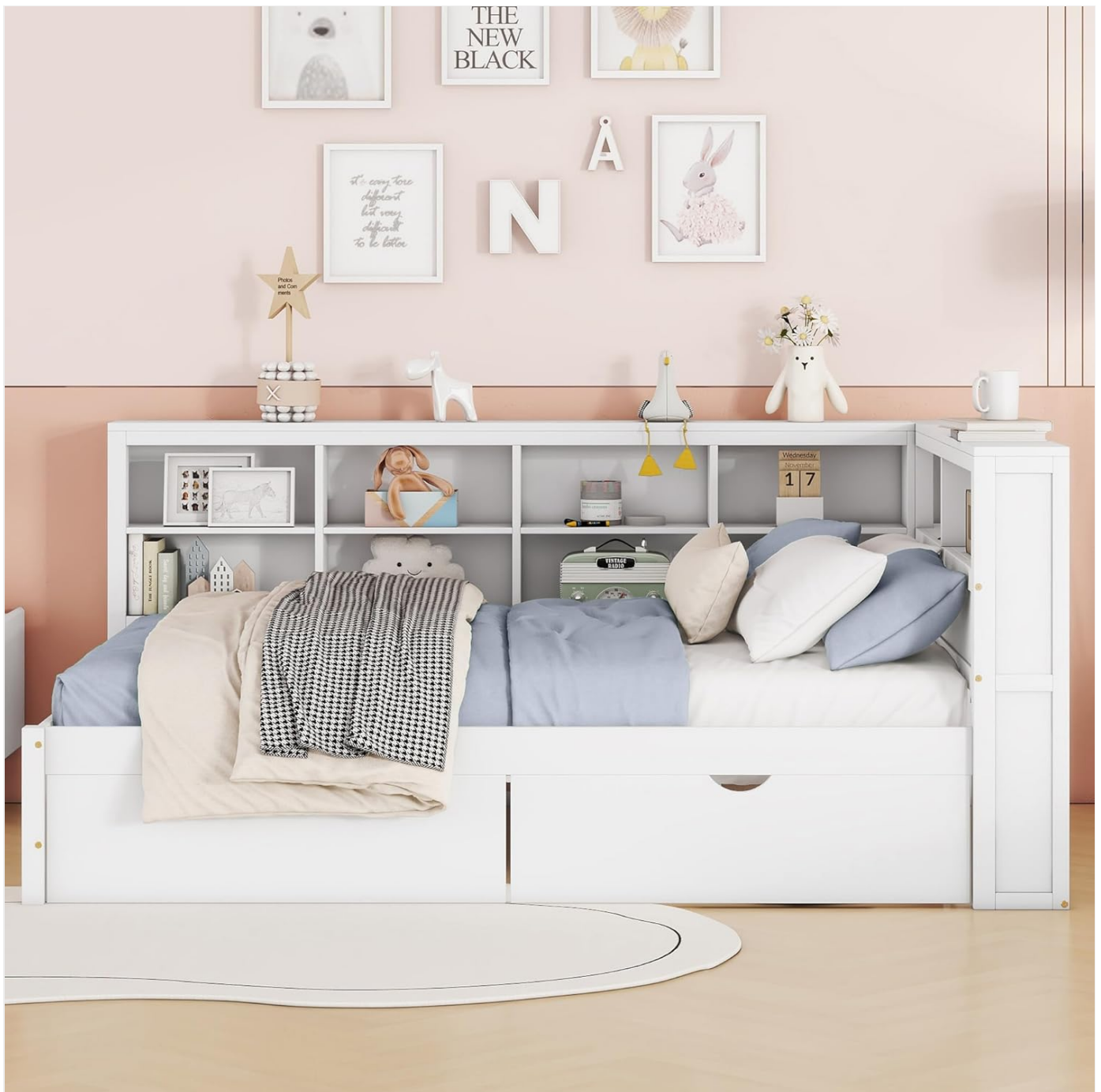
An overhead view of the assembled daybed, showcasing the integrated double-layer storage shelves filled with books and decorative items. The trundle is visible underneath the main bed.