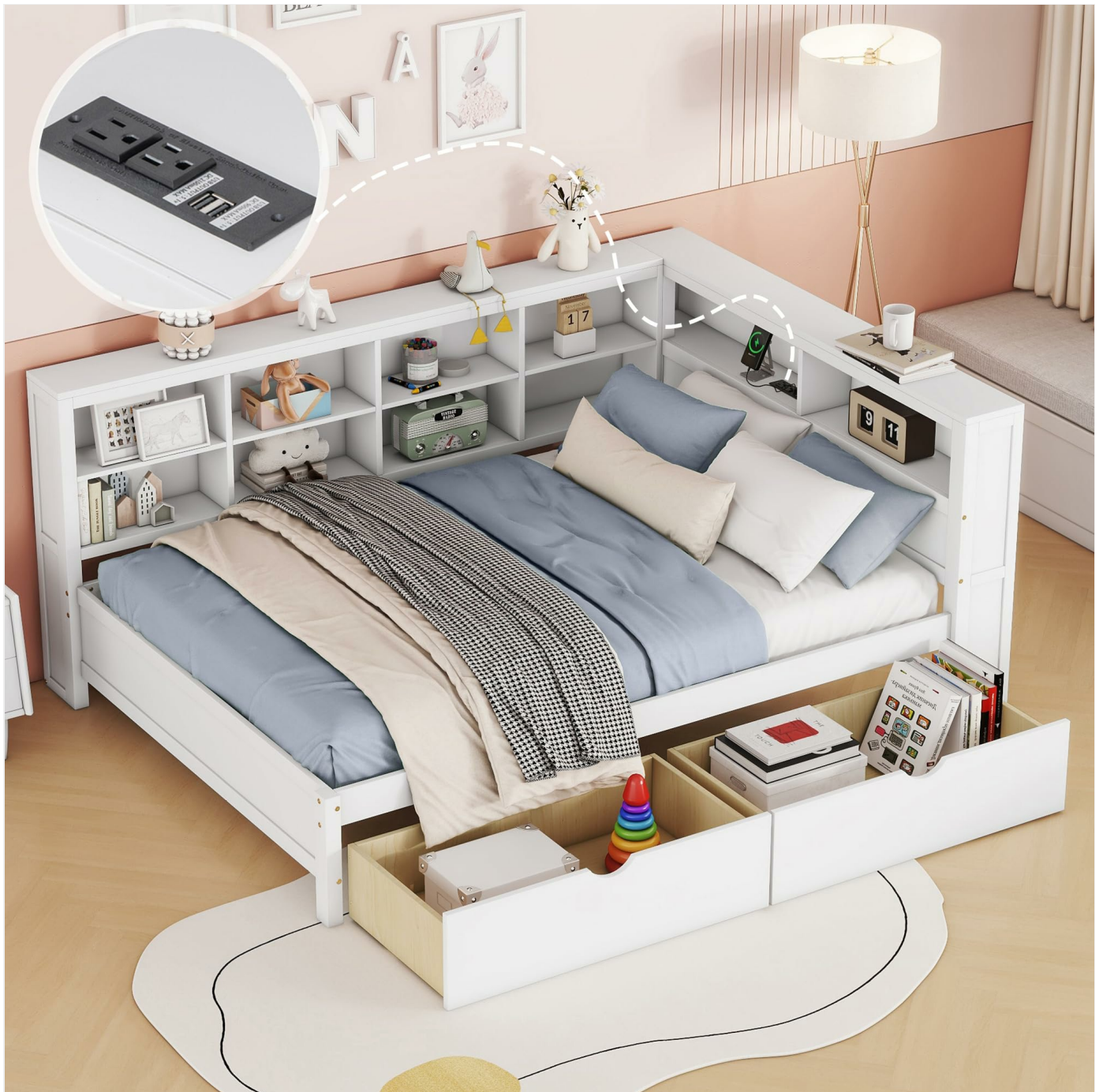
This image displays the fully assembled daybed in a room setting, highlighting its multi-functional design with a pull-out trundle and integrated storage shelves.