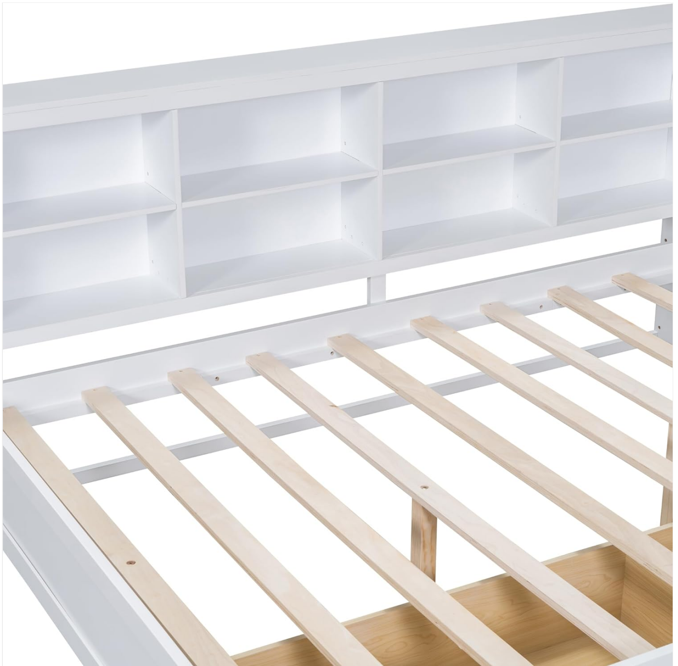
A detailed view focusing on the wooden slats that form the mattress support and the construction of the integrated storage shelves, emphasizing the quality of materials.