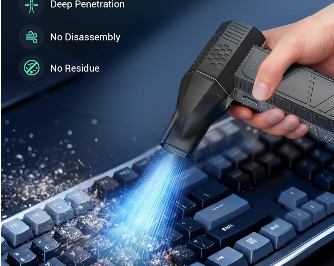
Image 5.1: Cleaning a keyboard with the air duster, demonstrating its effectiveness on electronics.