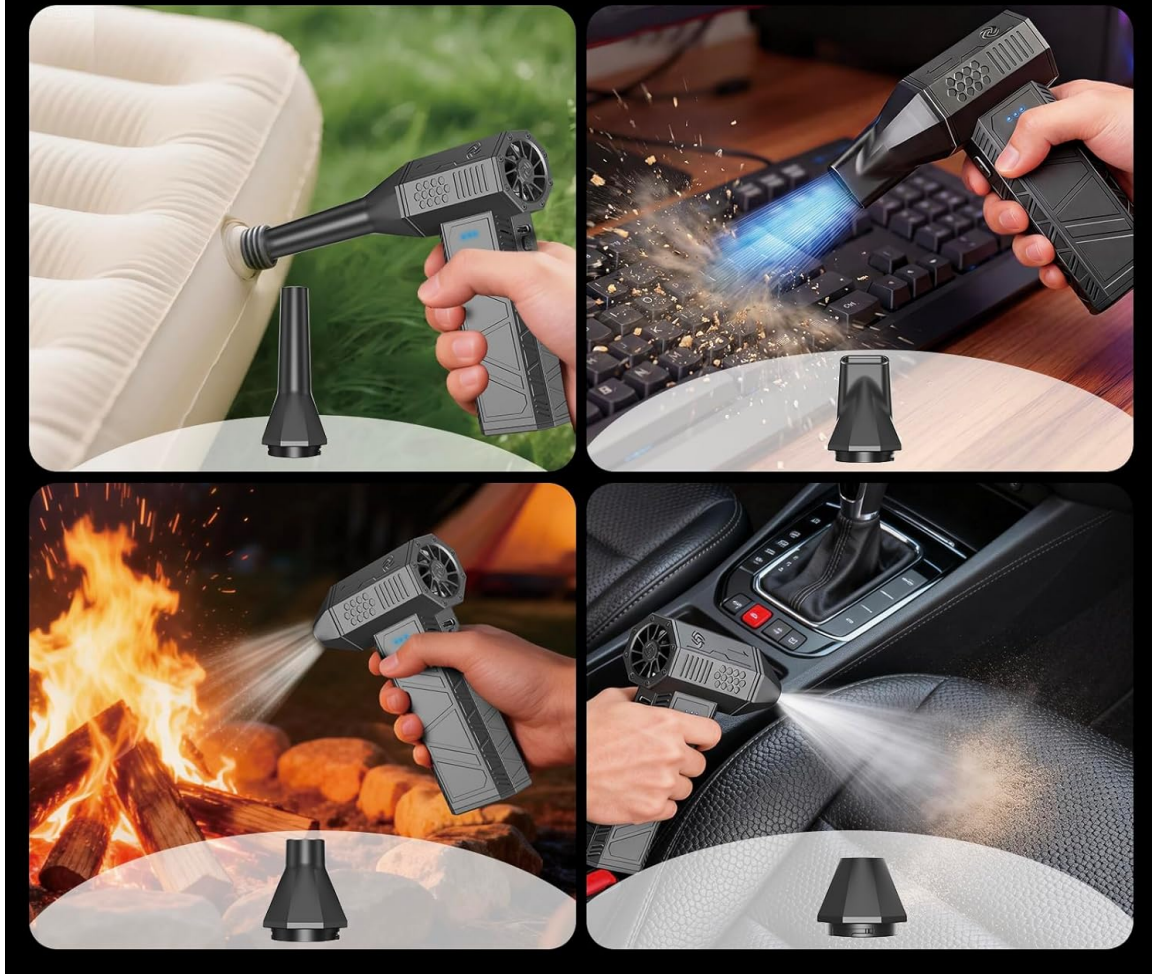
Image 4.1: The four specialized nozzles provided with the duster, designed for various cleaning and inflation tasks.

Designed for Tech,Auto, Home and Outdoor