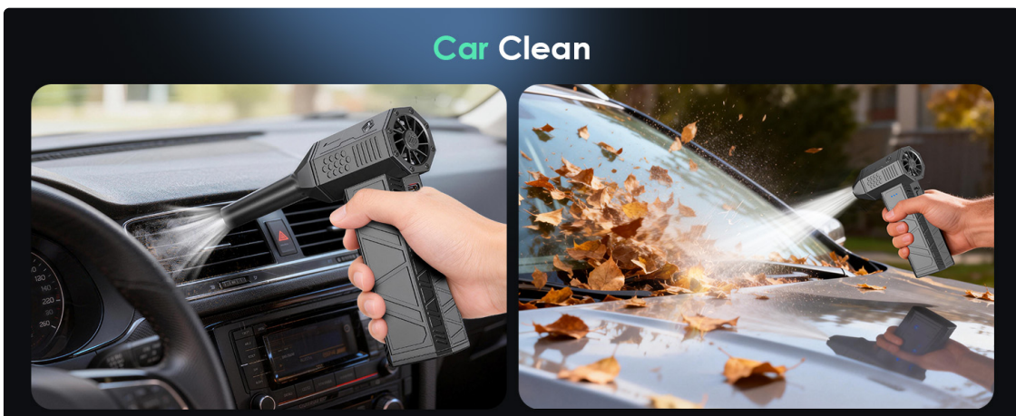
Image 5.2: The air duster being used to clean a car's dashboard, highlighting its utility for automotive detailing.

Your browser does not support the video tag.