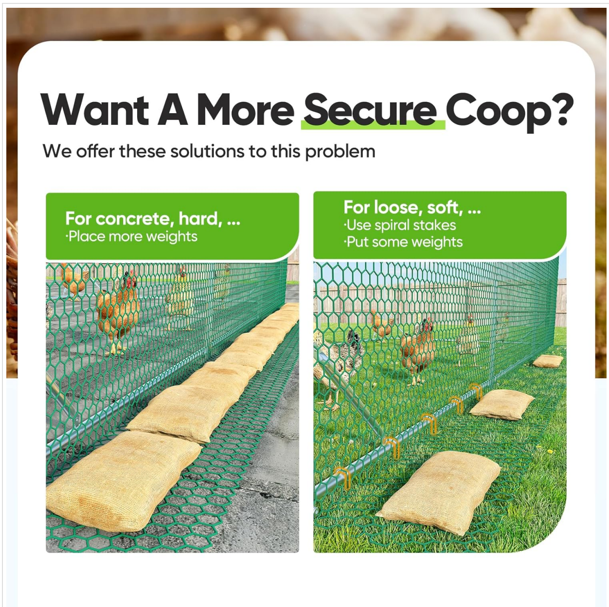
Image: Solutions for securing the ground skirt on different terrains: using weights for hard surfaces and spiral stakes with weights for soft ground.