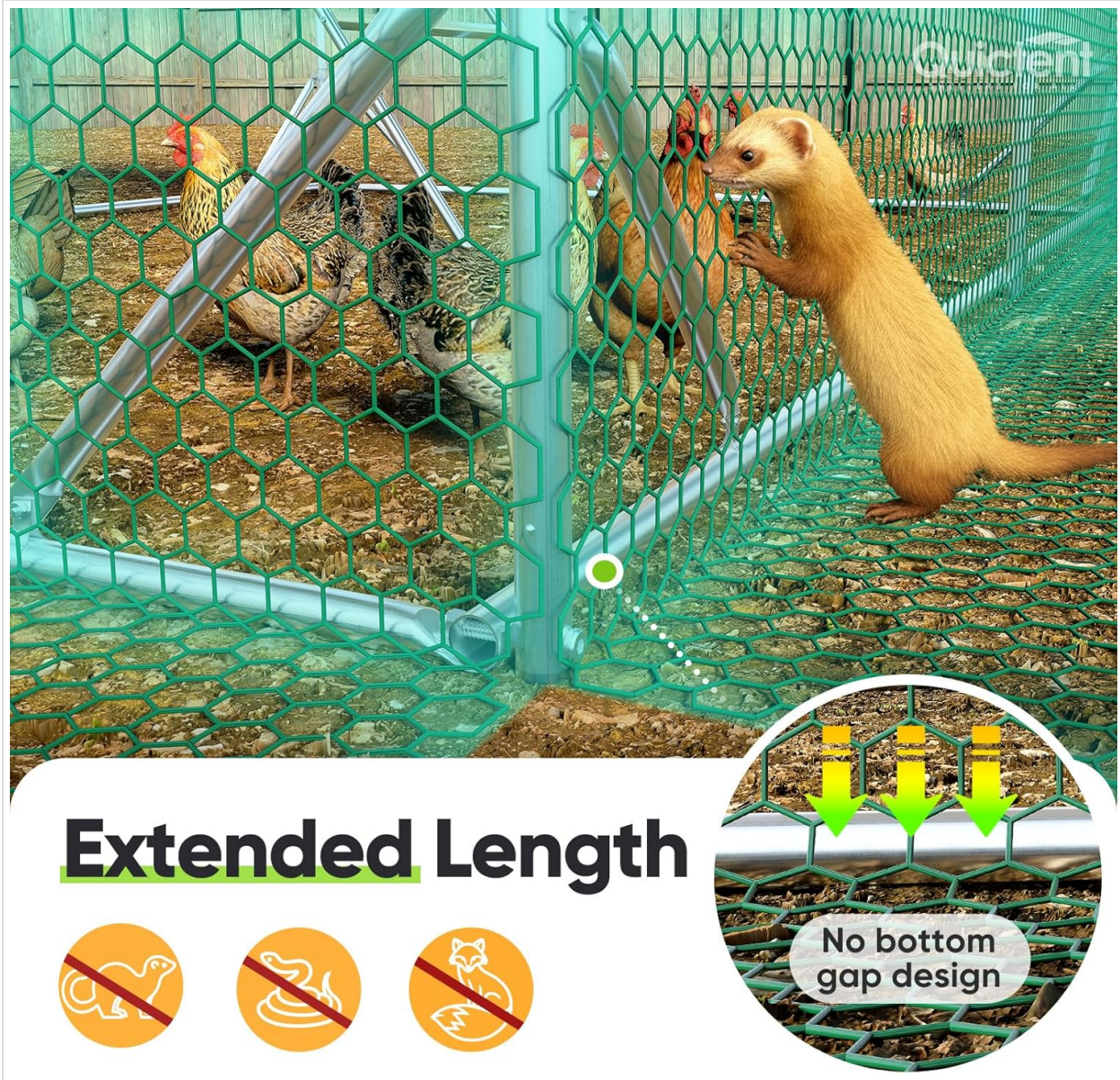
Image: The extended mesh ground skirt provides a barrier against digging predators like ferrets, ensuring no bottom gap.

latch door to prevent small predators from entering. Regularly check for any breaches in the wire or frame.