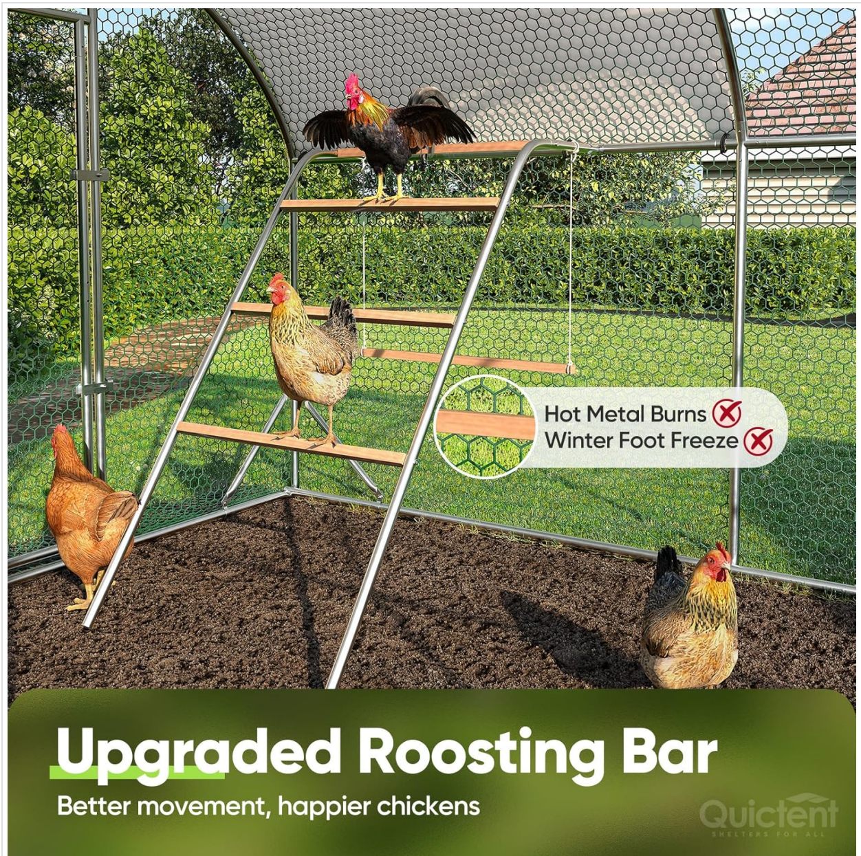
Image: Chickens utilizing the multi-level wooden roosting bar, designed for better movement and comfort, preventing hot metal burns or winter foot freeze.