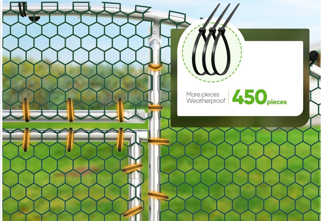
Image: Close-up view demonstrating the use of zip ties to secure the PVC-coated chicken wire tightly to the metal frame.

Thoughtful accessories for a better experience