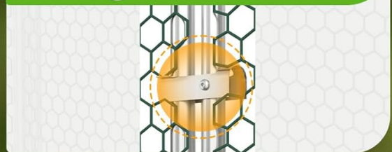
Image: Illustration of reinforced corner poles and U-shaped stakes being assembled for enhanced stability of the coop frame.