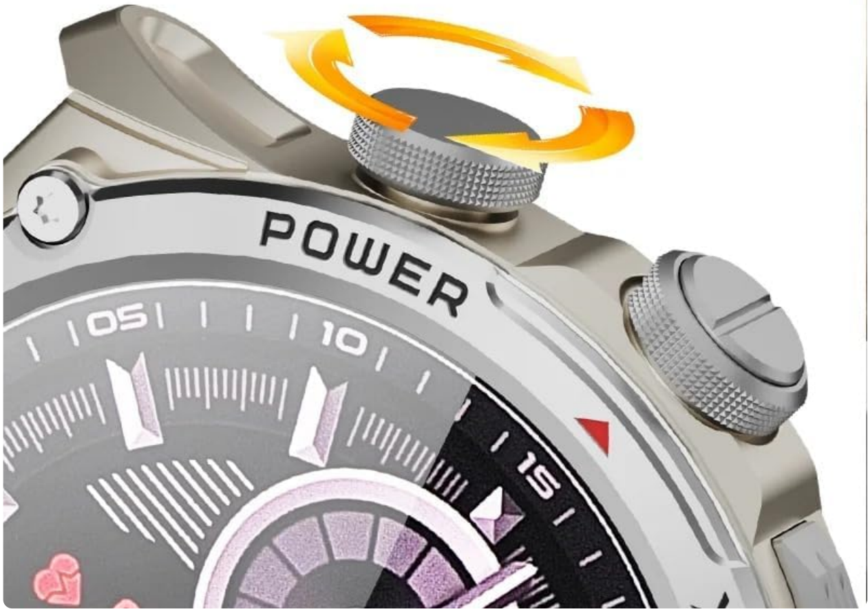
Image: Close-up of the smartwatch's intelligent rotating crown, which allows for intuitive navigation through menus and watch faces.

You can freely choose the dial and play with the menu, experiencing a brand new human-computer interaction Take you into a rich world on your wrist