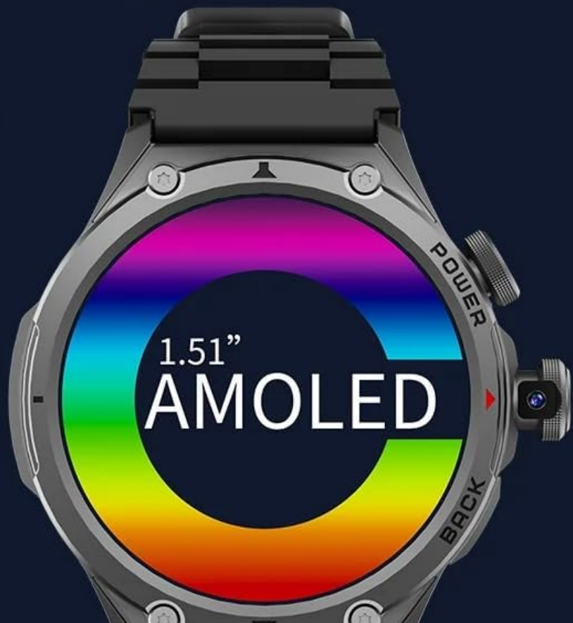
Image: The smartwatch features a 1.51-inch AMOLED display with 466x466 resolution, offering a wide color gamut (98% Adobe RGB) and a 178-degree ultra-wide viewing angle for clear visuals.

Accurate color: reducing power( \Delta E < 5 )