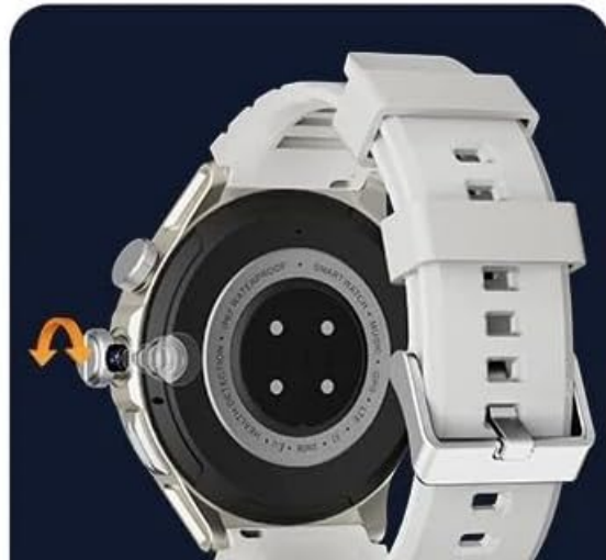
Image: The smartwatch is equipped with a 500W HD camera that can rotate 180 degrees, functioning as both a front and rear camera.