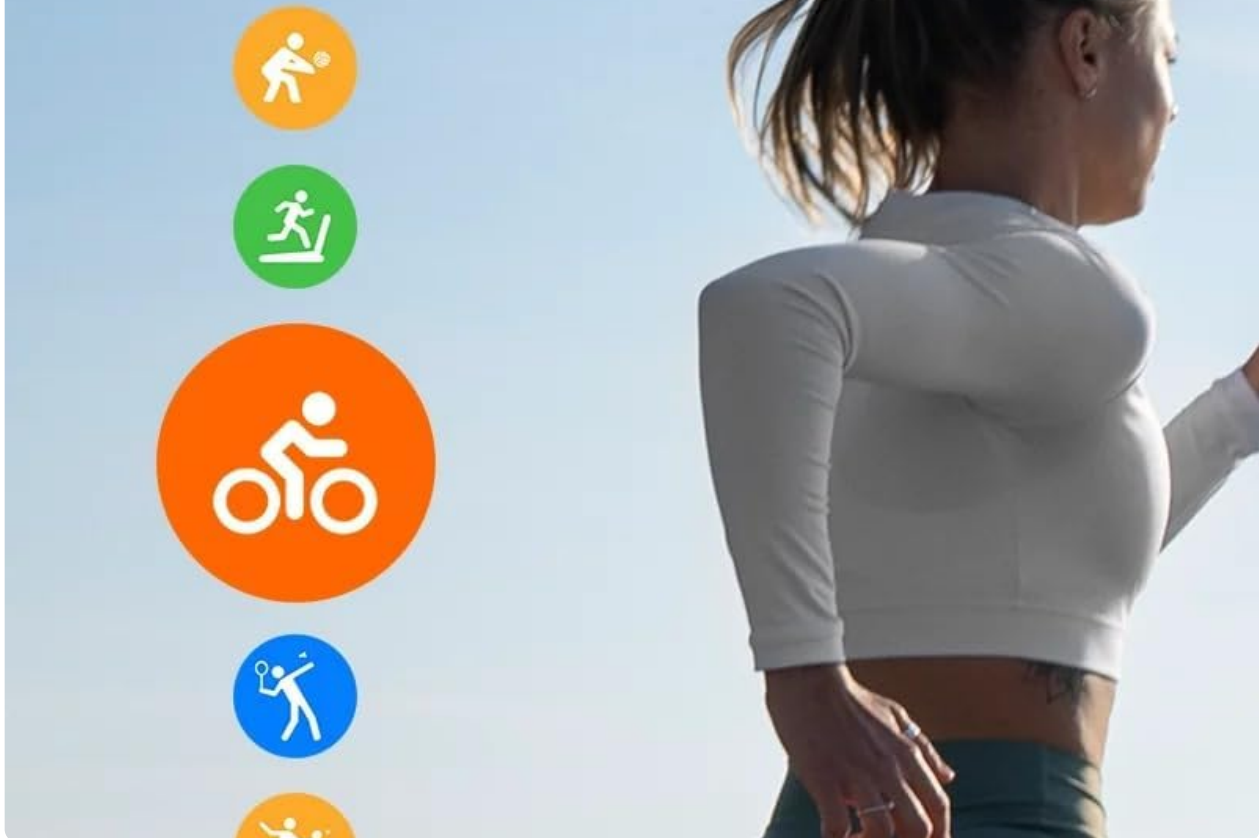
Image: Icons representing various sports modes available on the smartwatch, including running, walking, cycling, mountaineering, and rope skipping.

Mountaineering, walking, mountain climbing and other sports modes help you stay active at all times Mastering exercise data to safeguard your health