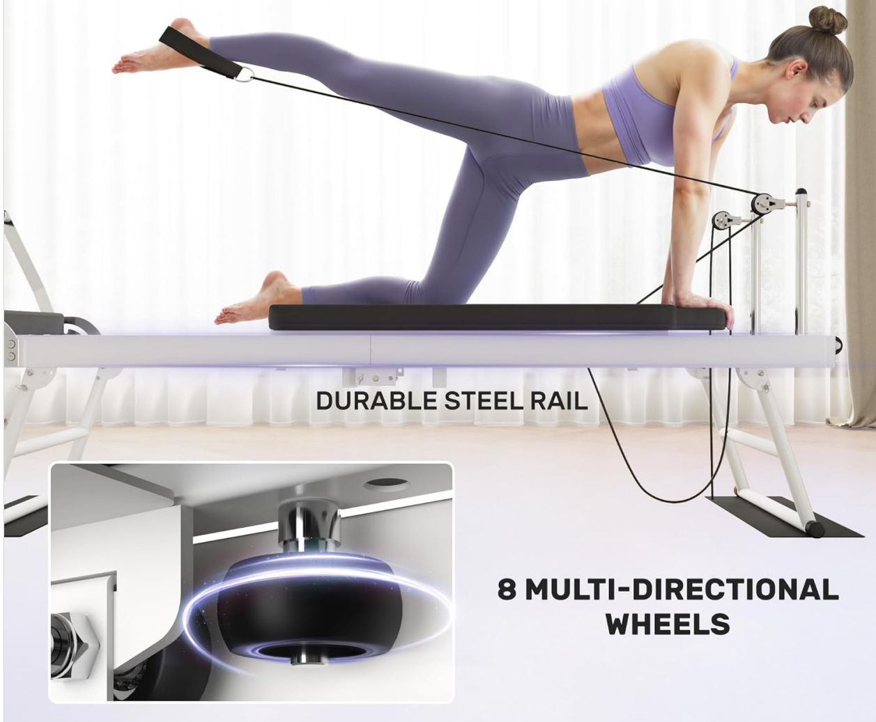
Figure 6.2: The durable steel rail and multi-directional wheels contribute to a smooth and stable workout, requiring minimal maintenance.