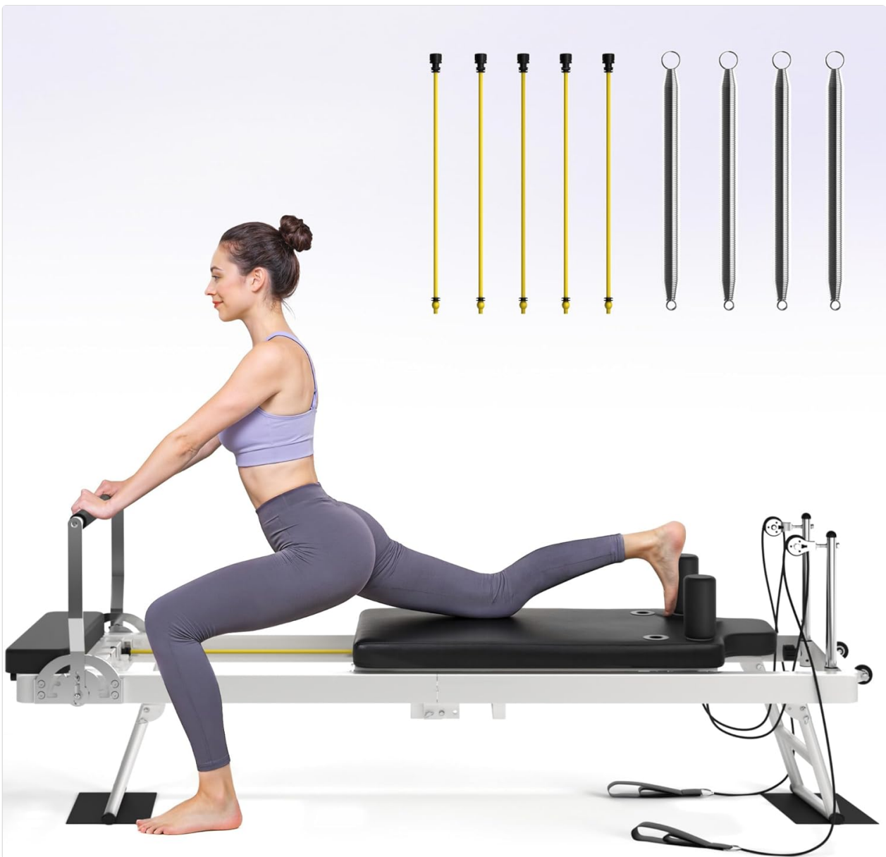
Figure 5.3: Examples of full-body exercises that can be performed on the JELENS JP01 Pilates Reformer.

For specific exercise routines and techniques, it is recommended to consult a certified Pilates instructor or refer to professional Pilates resources.