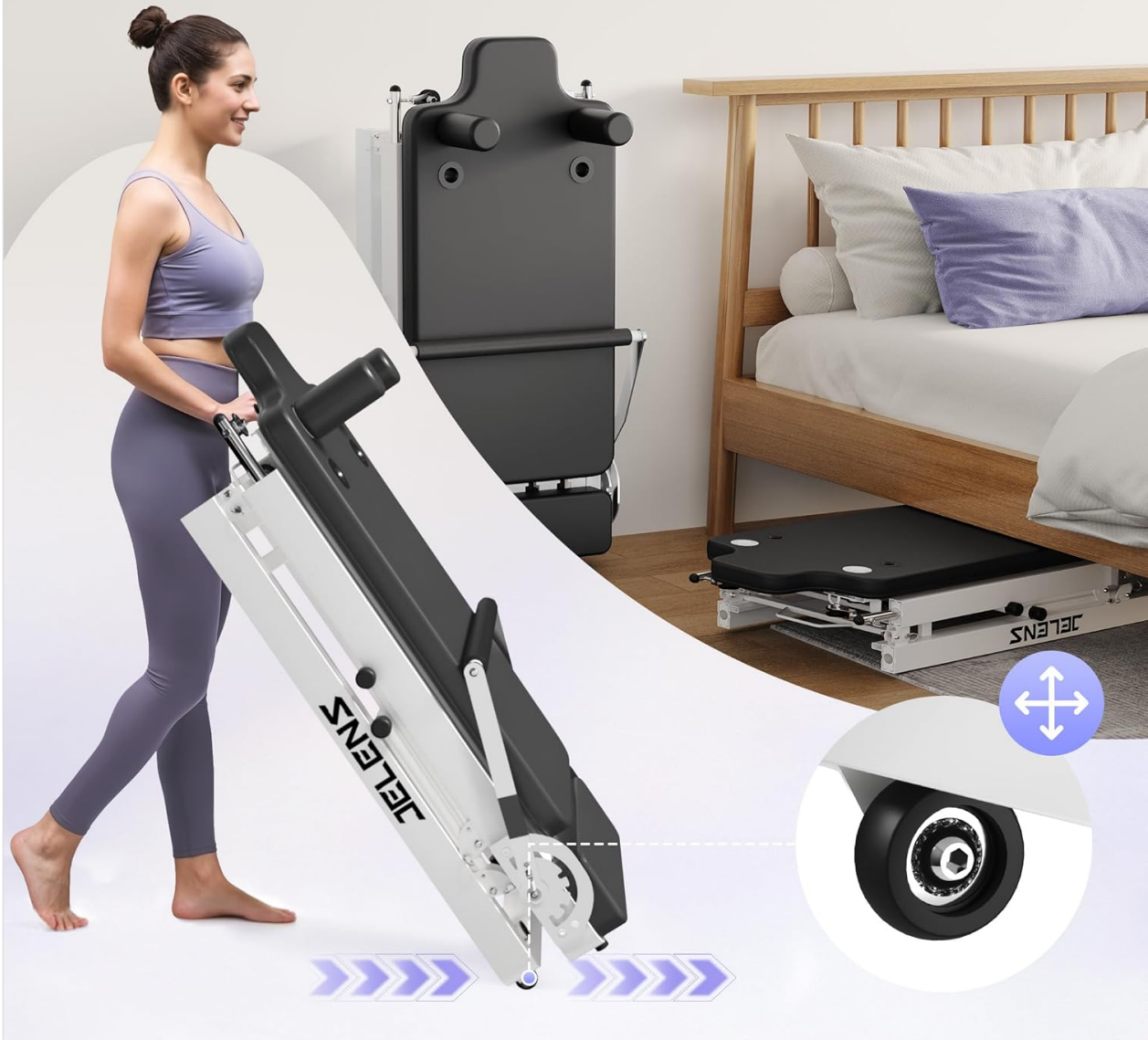
Figure 4.1: The JELENS JP01 Pilates Reformer being moved and stored, highlighting its foldable design and integrated wheels for convenience.