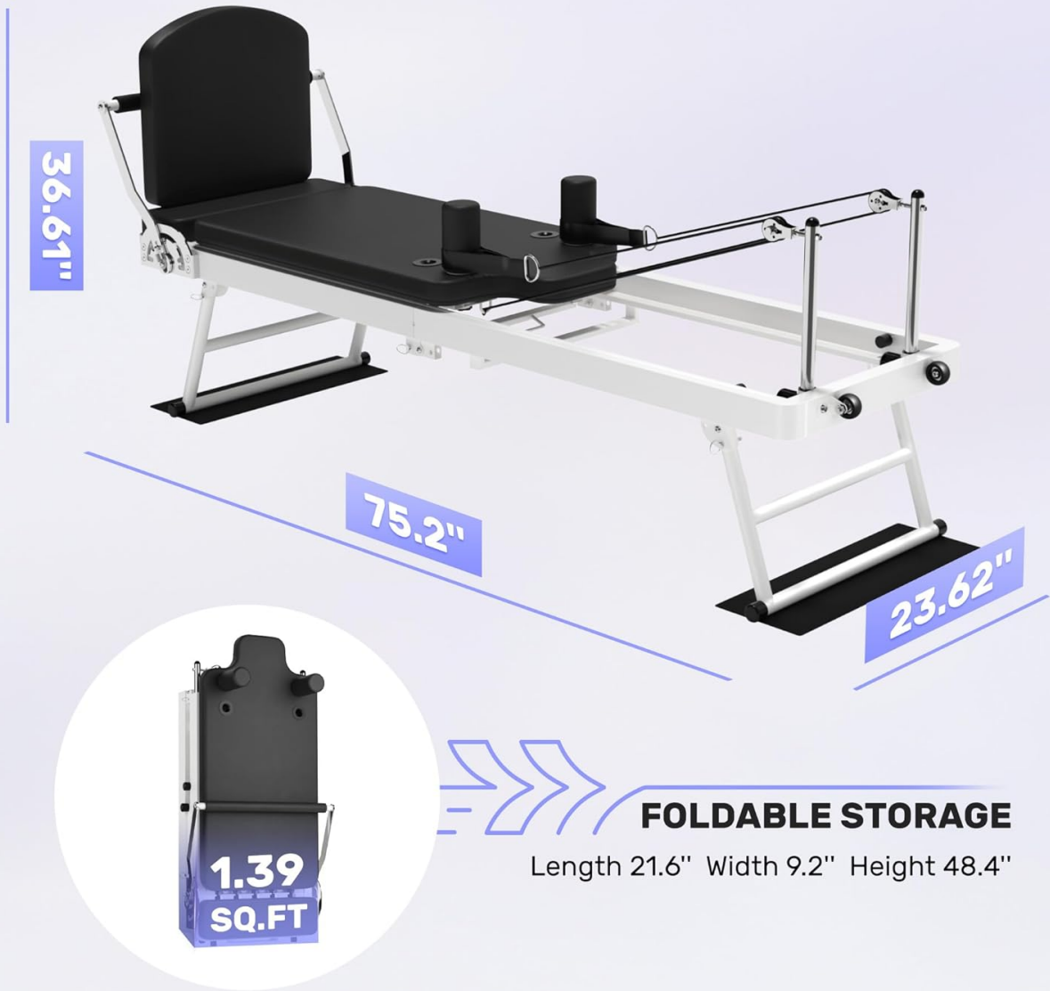
Figure 8.1: Dimensions of the JELENS JP01 Pilates Reformer, both unfolded and folded for compact storage.