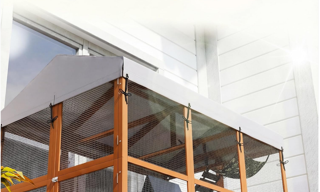
Image: The weatherproof cover, emphasizing its waterproof and UV-resistant features for all-season protection.