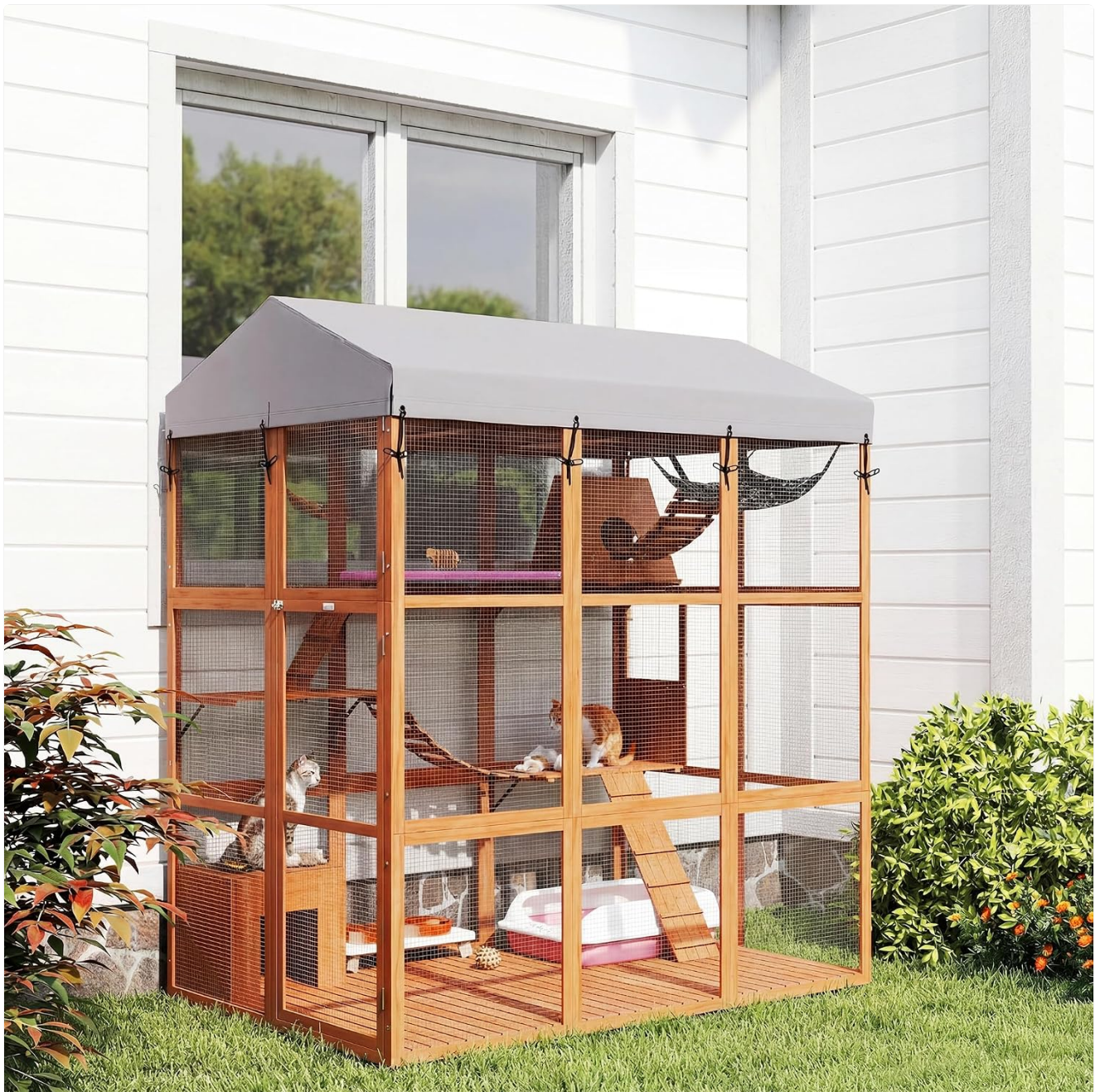
Image: The DIY design feature, demonstrating how the catio can be connected to a window or pet door for free access.