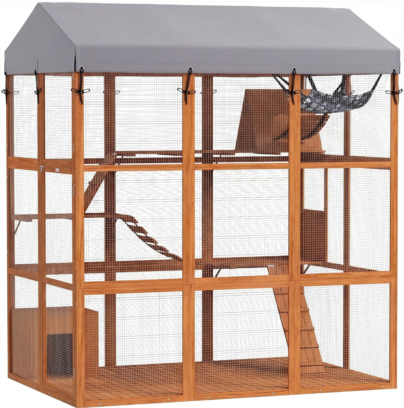
Image: The PawHut 81-inch Outdoor Cat Enclosure, showcasing its multi-level design and spacious interior for cats, situated in a backyard environment.