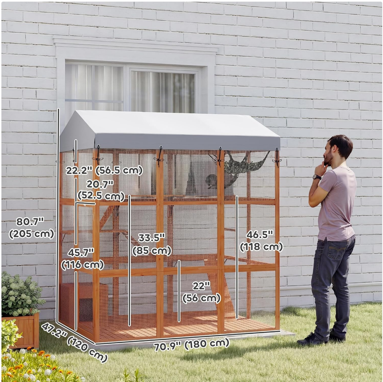
Image: Detailed dimensions of the PawHut 81-inch Outdoor Cat Enclosure.