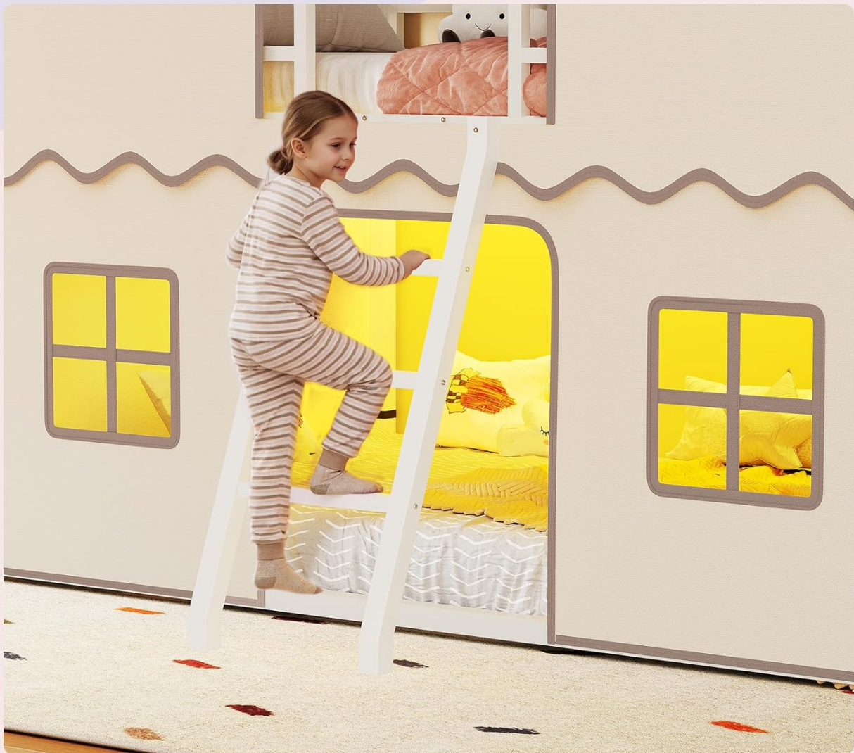
Image: The house bunk bed illuminated with colorful LED lights, showcasing the remote and app control options.

Angled design provides stable and secure climbing for kids, much safer