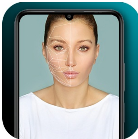
Image: Key features of the Android 16 operating system on the Eco 20.

The Eco 20 runs on Android 16, offering advanced privacy features, smoother navigation, and enhanced performance. Experience a modern and intuitive user interface designed for daily use.