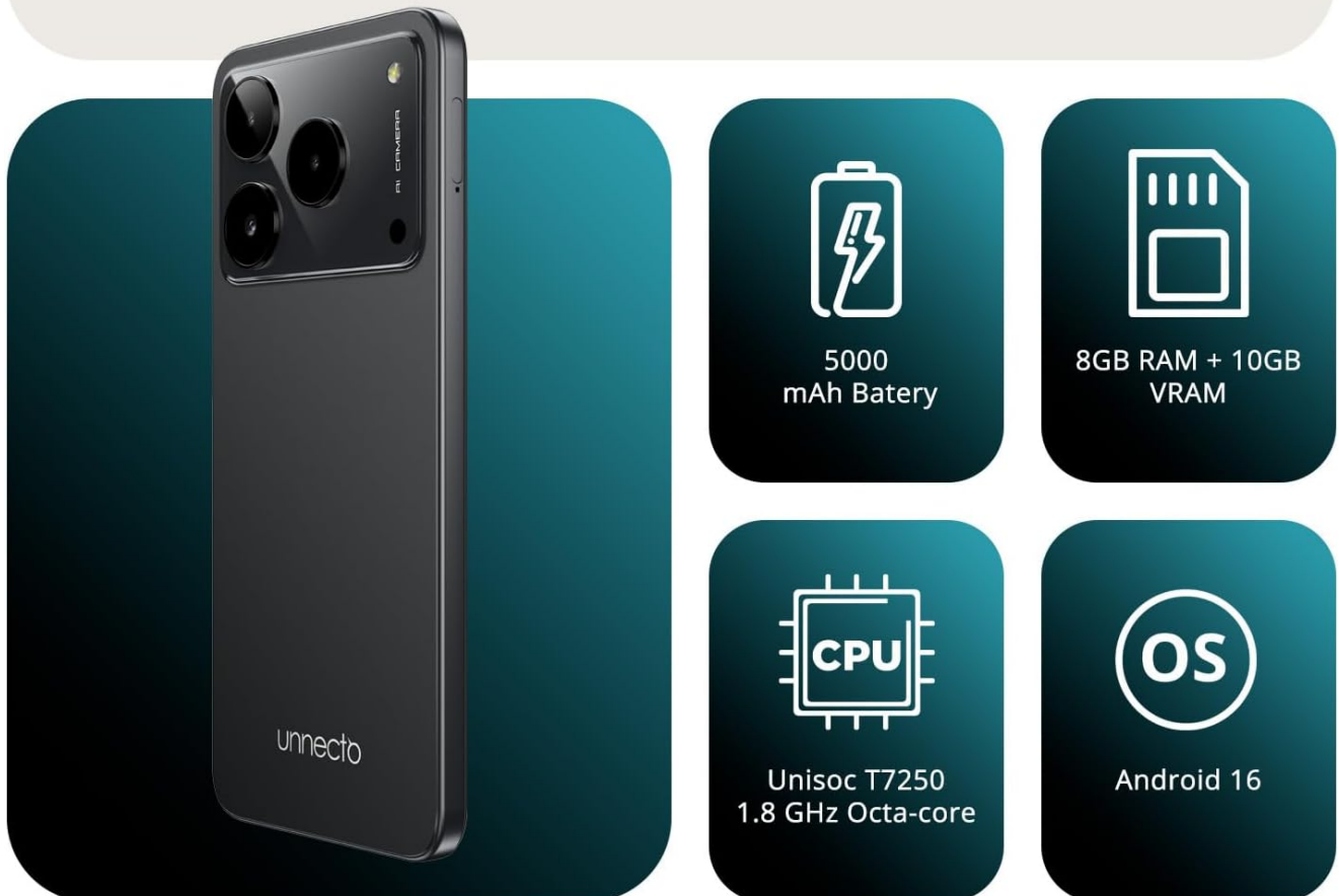
Image: The Unnecto Eco 20 smartphone and its included accessories.

The Eco 20 combines a large display, advanced camera system, robust performance, and modern software into a reliable everyday device ready for work, play, and everything in between.