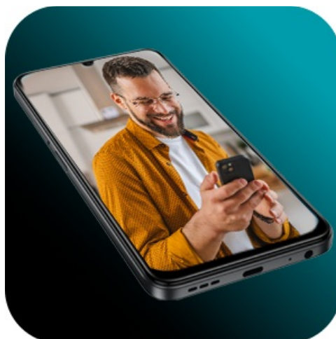
Image: Examples of high-detail photography with the Eco 20's 108MP camera.