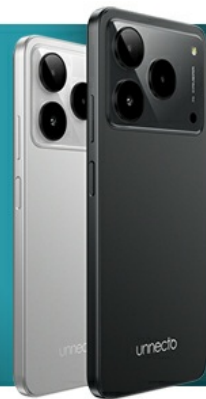
Image: Unnecto Eco 20 smartphone banner highlighting its power.