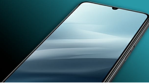
Image: The Eco 20 display, emphasizing a bigger and smoother experience.

The power to keep up with social feeds, streams, games, and video calls and a screen that makes it all look incredible.