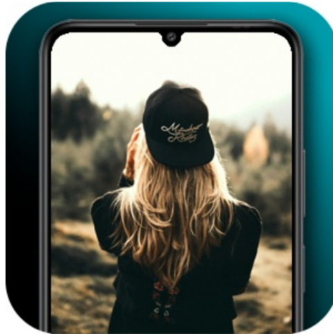
Image: Carrier compatibility information for the Unnecto Eco 20.

is not compatible with networks such as AT&T, Cricket, Verizon, or Tracfone. Please confirm compatibility with your preferred carrier before use.