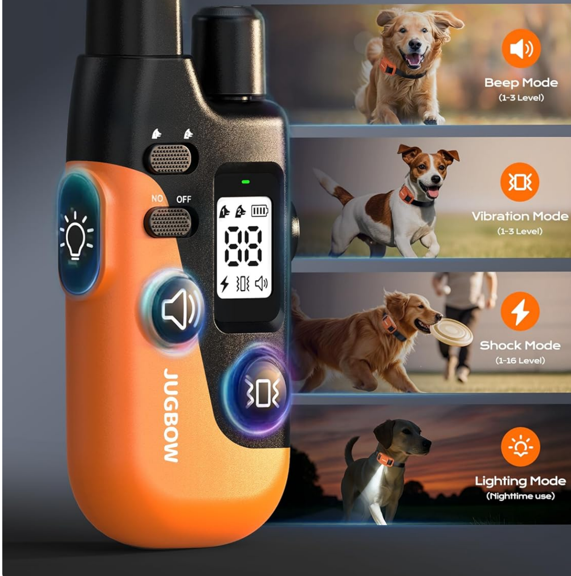
Image: Visual representation of the four effective training modes: Beep, Vibration, Shock, and Lighting, available on the Jugbow remote.

Correct Bad Behavior in Safe and Humane Way