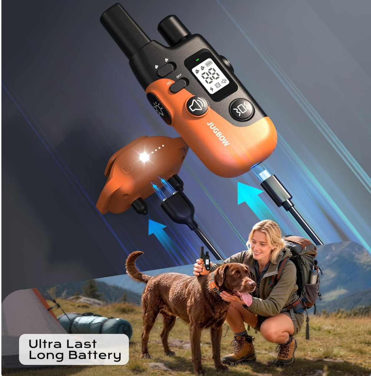
Image: Illustration of the Jugbow remote and collar being charged simultaneously with the 2-in-1 fast charging cable.

Your browser does not support the video tag.