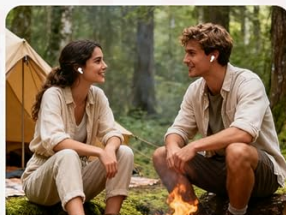
Nature Excursions and Camping