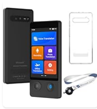
Image: Visual representation of the Wooask A9's long-lasting battery life, including single charge, total with case, and standby times.