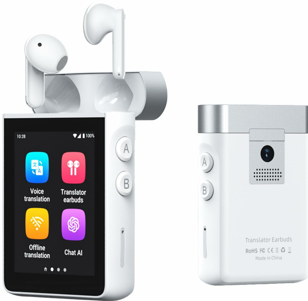
Image: The Wooask A9 AI Translator Earbuds device with its charging case, showcasing its compact design.