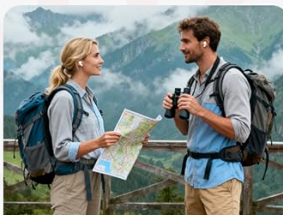
Rural and Remote Visits