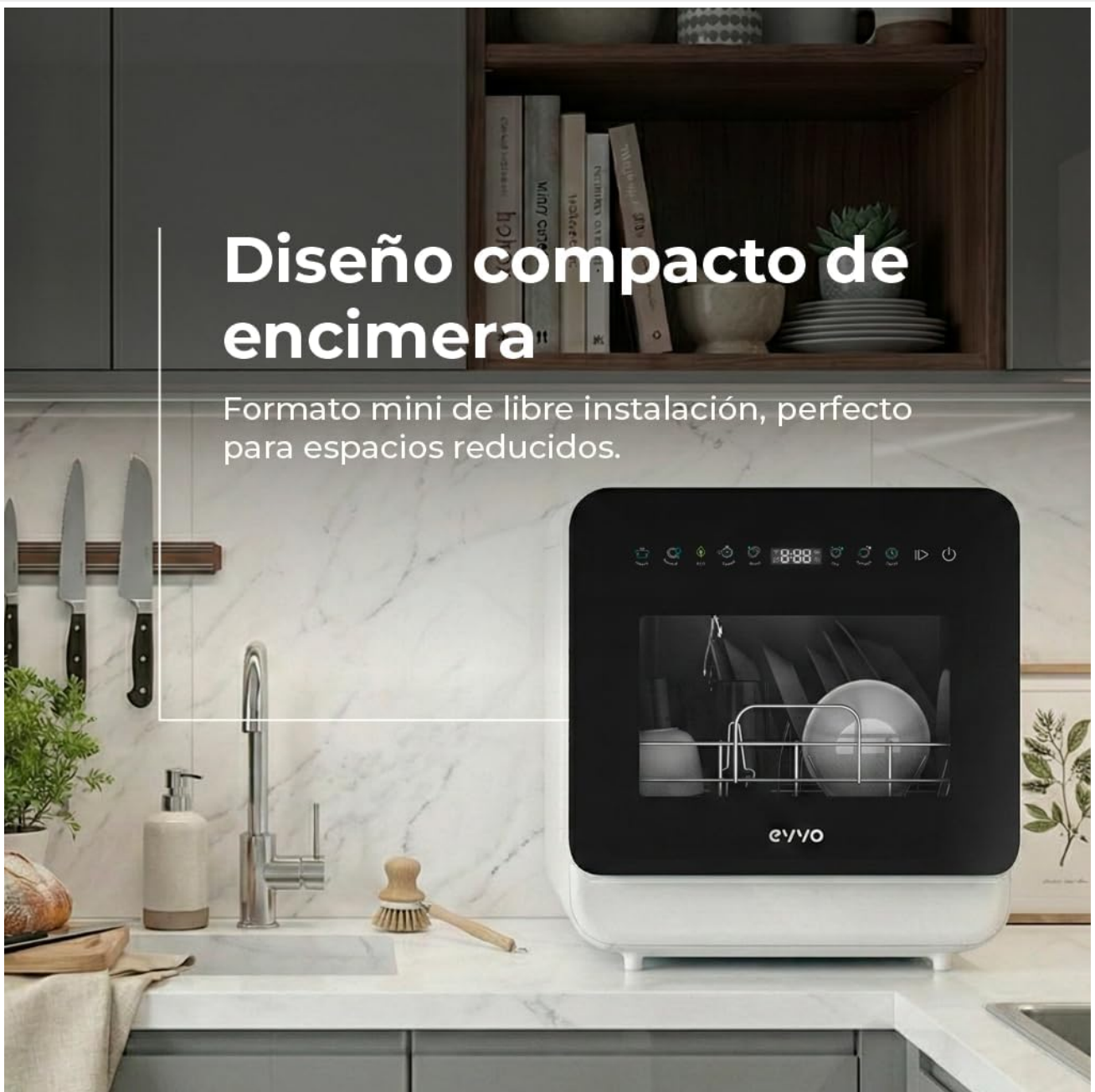
Image: The EVVO Mini D Trip 3 dishwasher positioned on a kitchen countertop, demonstrating its compact design and suitability for small spaces without requiring fixed installation.

Formato mini de libre instalación, perfecto para espacios reducidos.