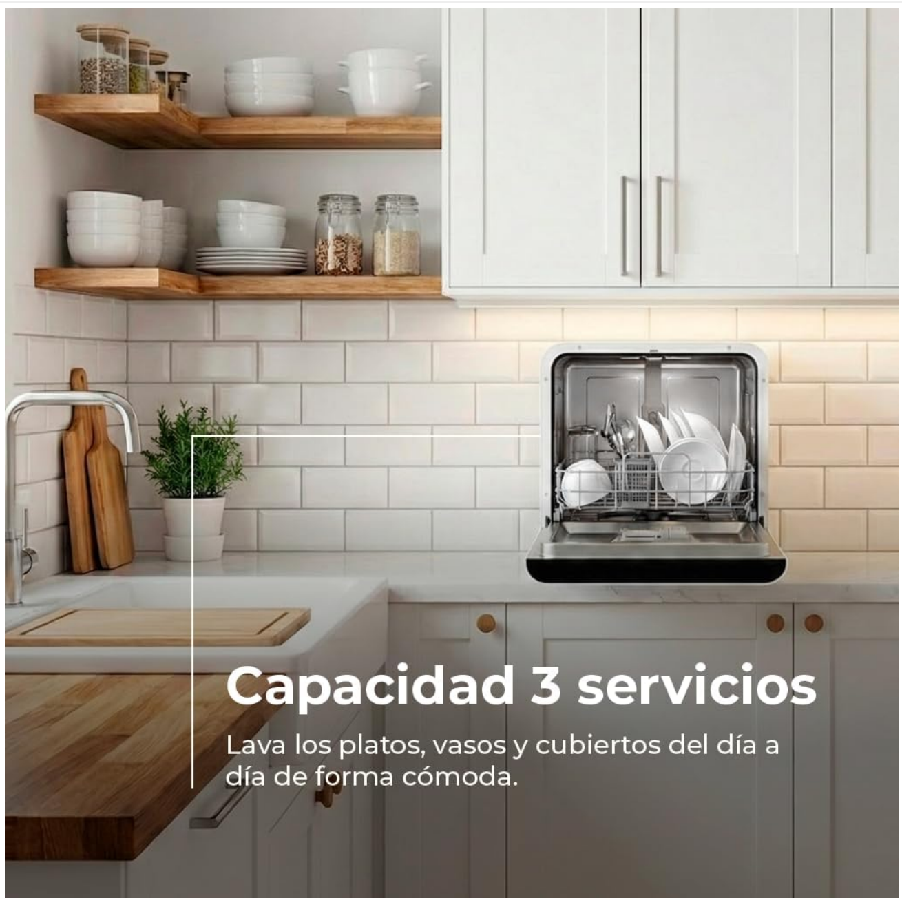
Image: The interior of the EVVO Mini D Trip 3 dishwasher showing a typical load of dishes, illustrating its 3 place setting capacity.